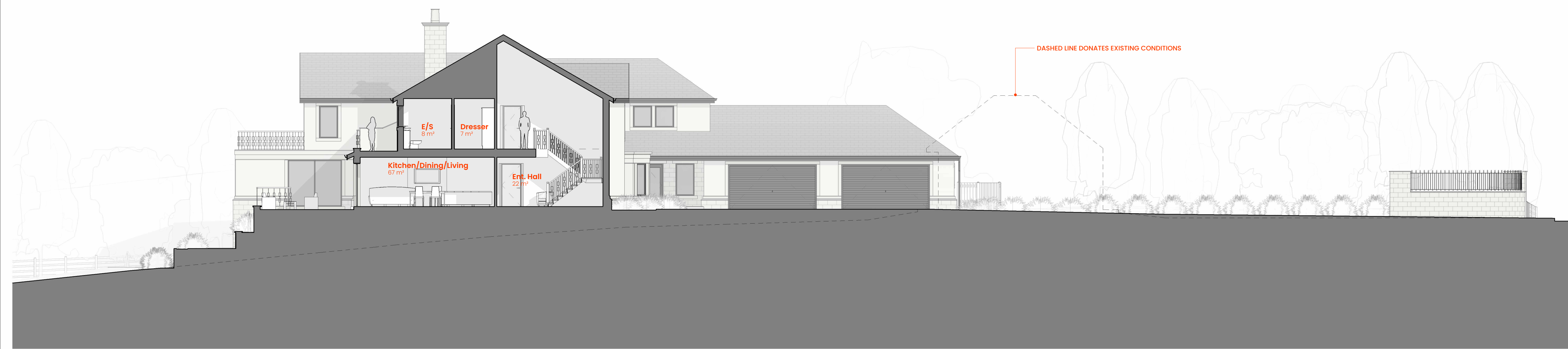
2 PROPOSED SECTION 1:100