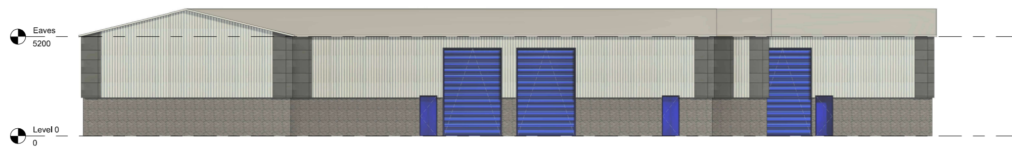
1 East 1 : 100