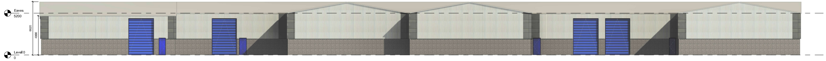
2 North 1 : 100