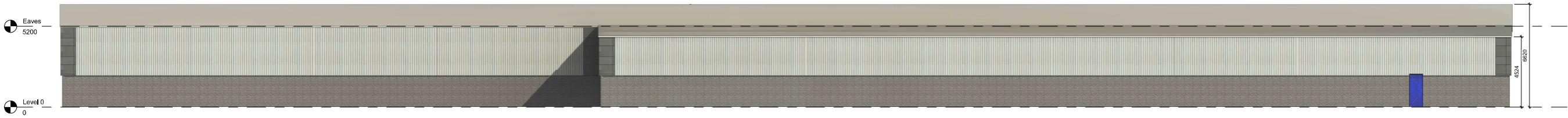
3 South 1 : 100