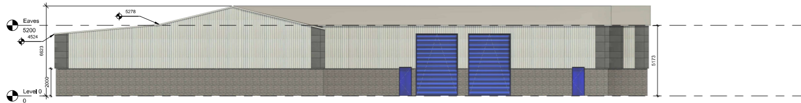
1 East 1 : 100