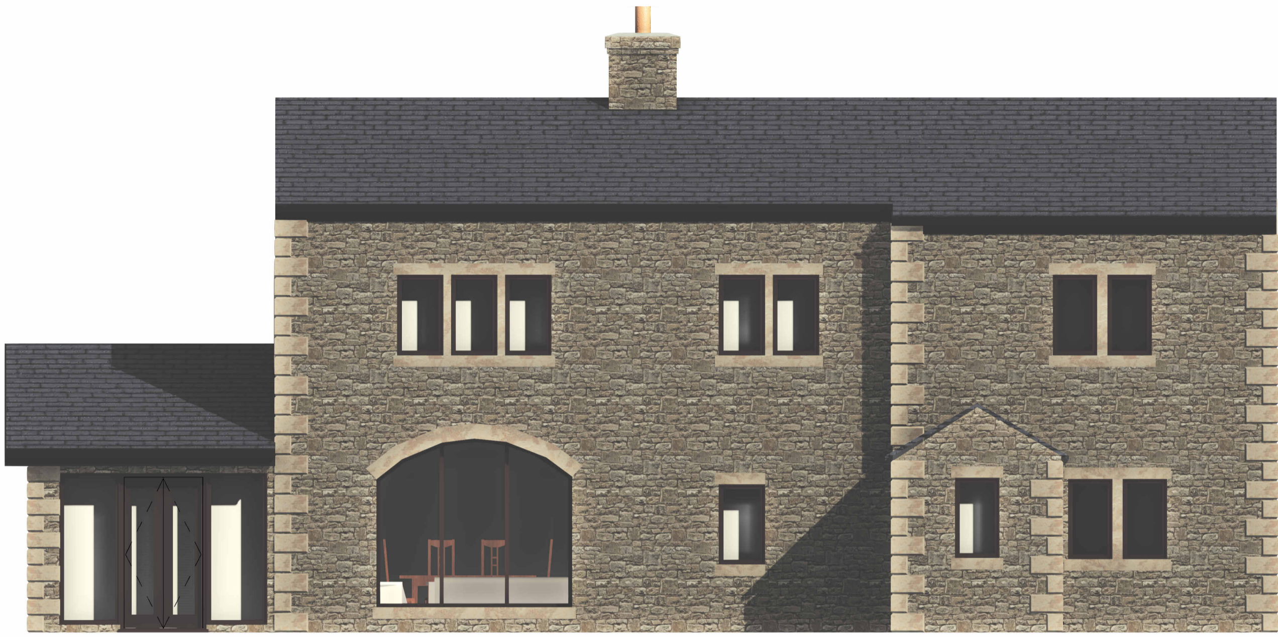
3 PROPOSED NORTH1 1 : 50