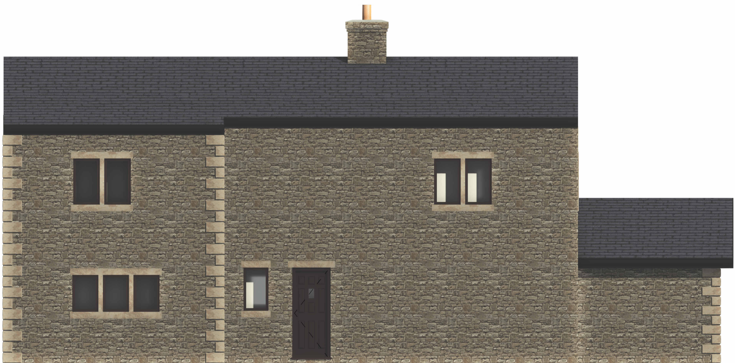
1 PROPOSED SOUTH1 1 : 50