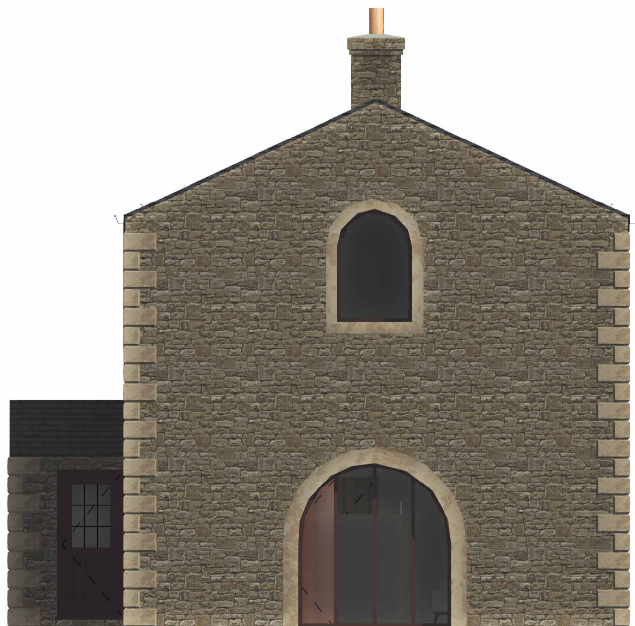
4 PROPOSED WEST1 1 : 50