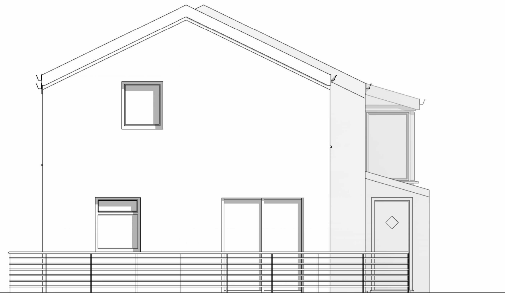
2 EXISTING EAST. 1 : 50