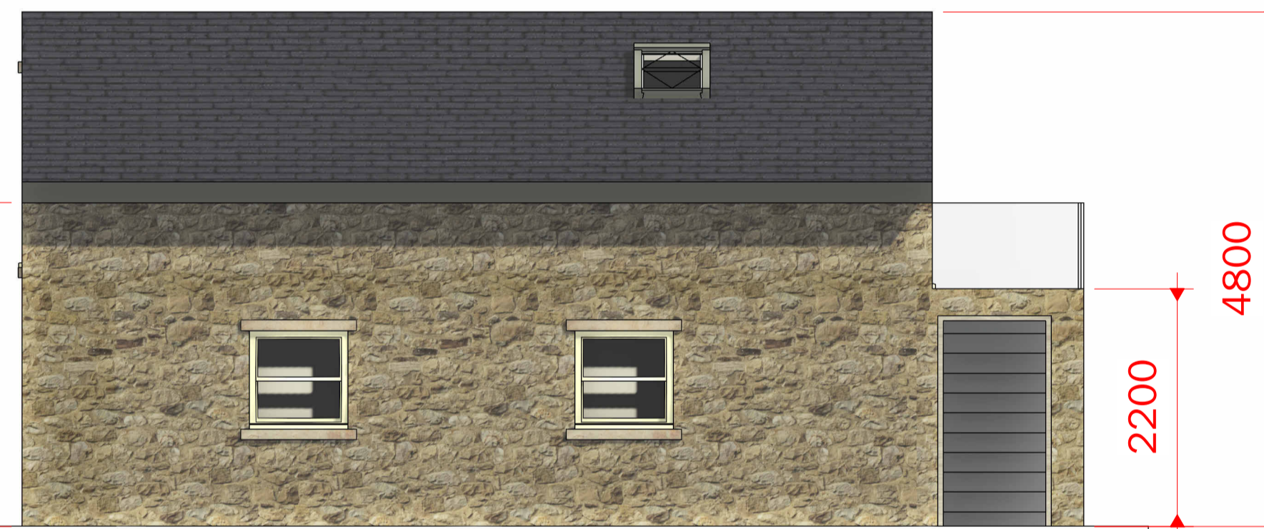
4 Existing North 1 : 50