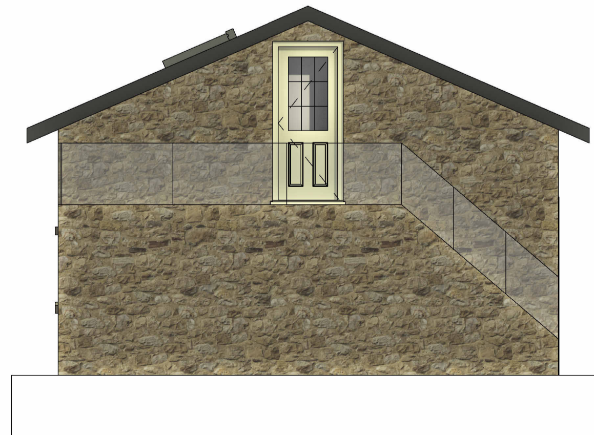
6 Existing West 1 : 50