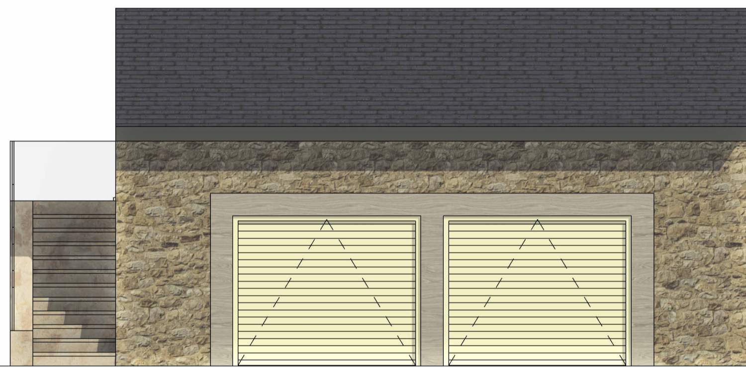
5 Existing South 1 : 50