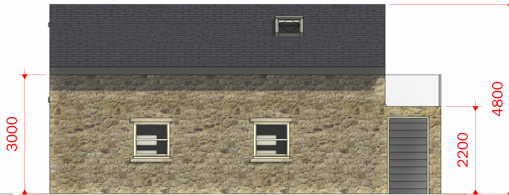
4 Proposed North 1 : 50