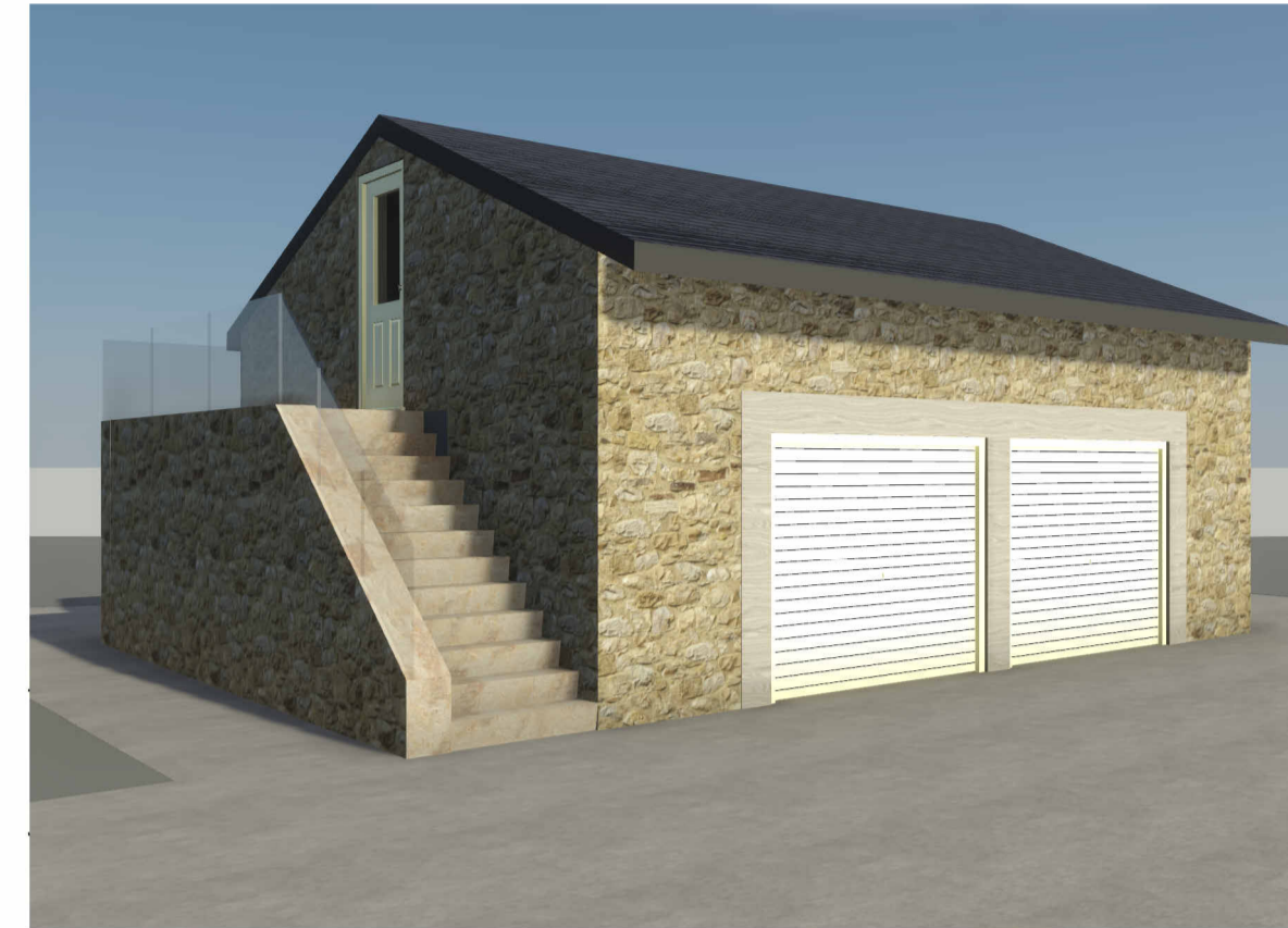
7 3D View 2