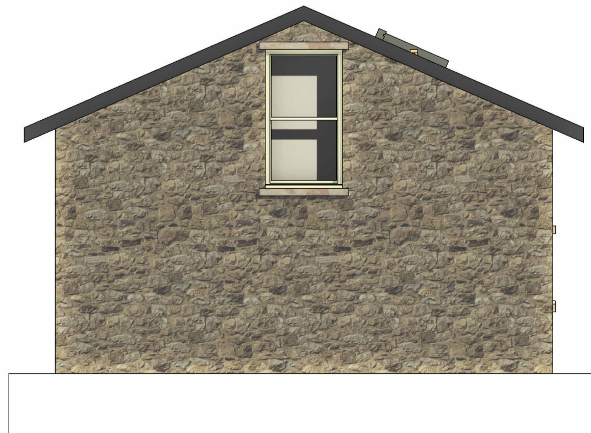
3 Proposed East 1 : 50