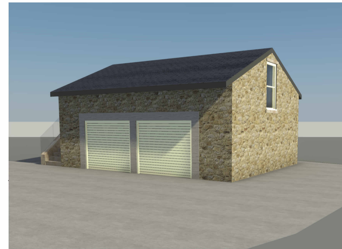
8 3D View 1