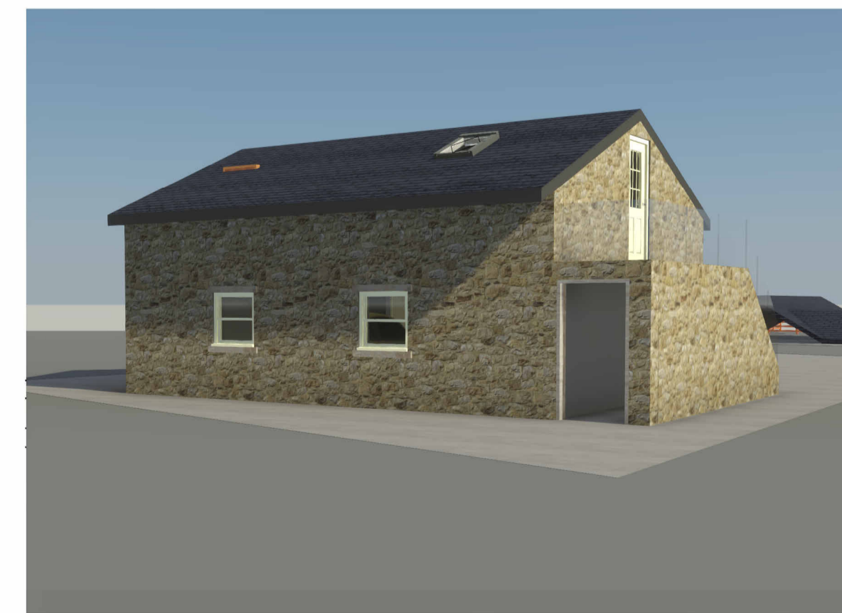
9 3D View 3