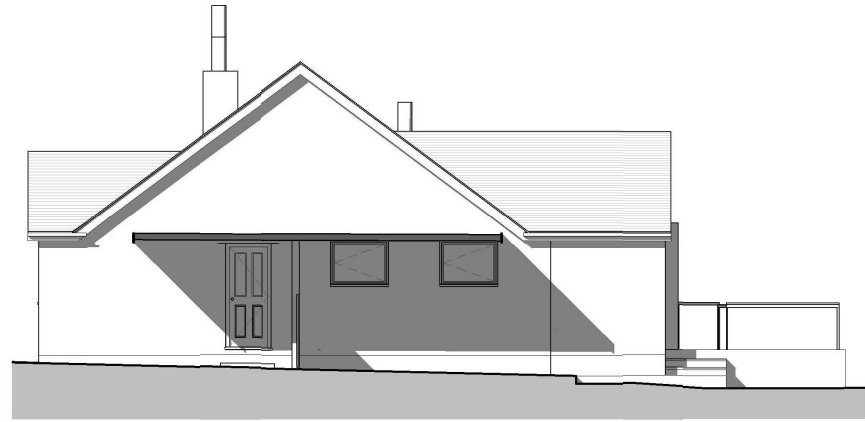
East Proposed 1 : 100