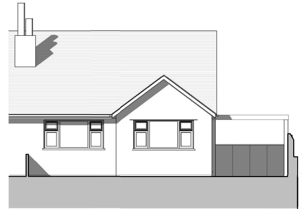
South Proposed 1 : 100

A 15 May 2026 Re-Issue with revised level and decking information