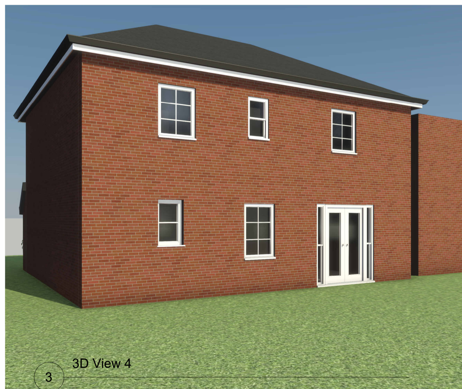
3 3D View 4