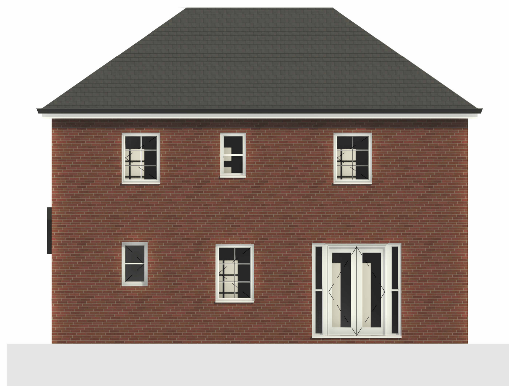
1 EXISTING NORTH 1 : 50

FOR THE LAWFUL DEVELOPMENT CERTIFICATE ONLY