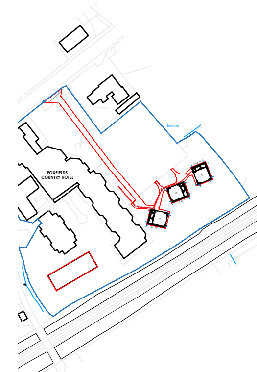
Mapping contents © Crown copyright and database rights 2026 Ordnance Survey 100035207 SCALE 1:2500