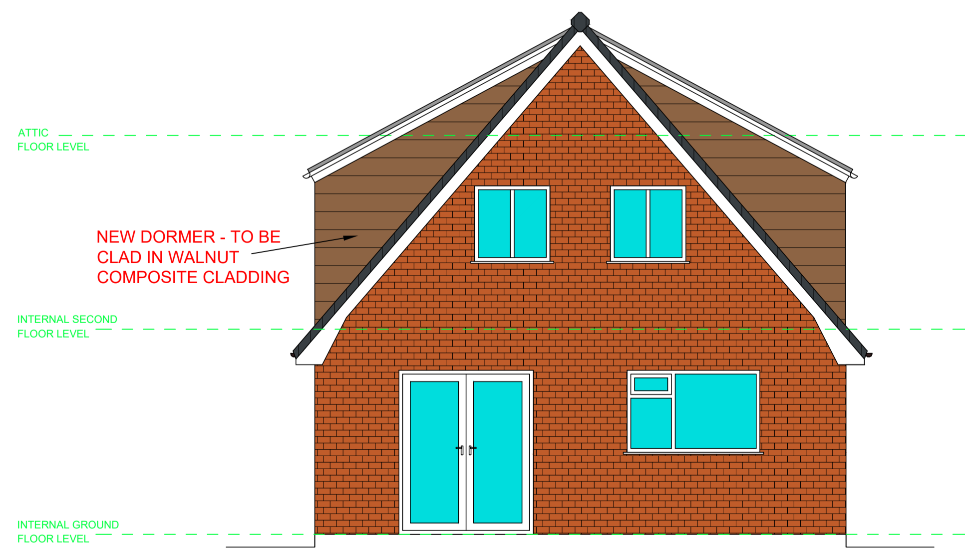
PROPOSED REAR ELEVATION SCALE - 1:50 @ A1