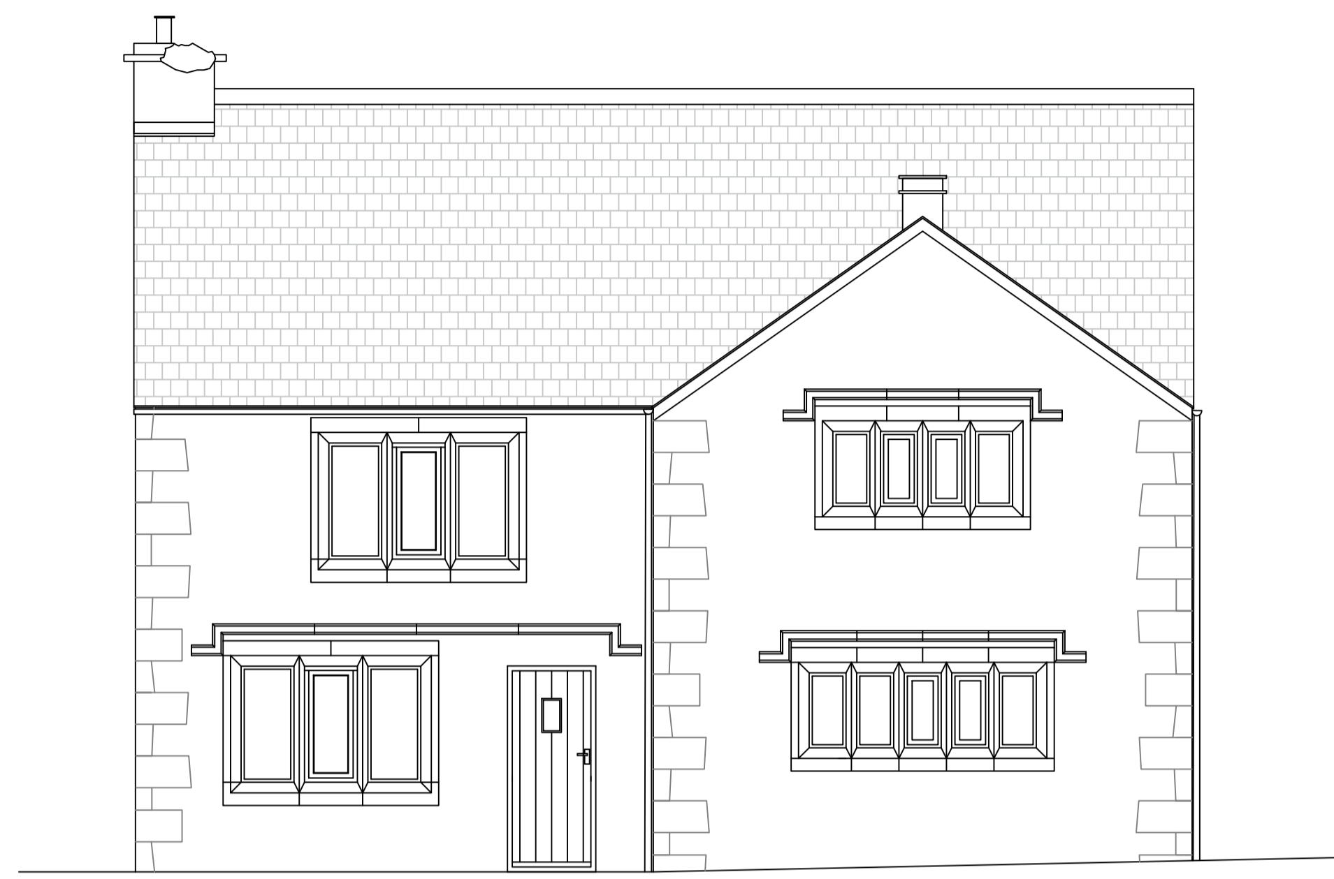
Existing Front Elevation 1:50