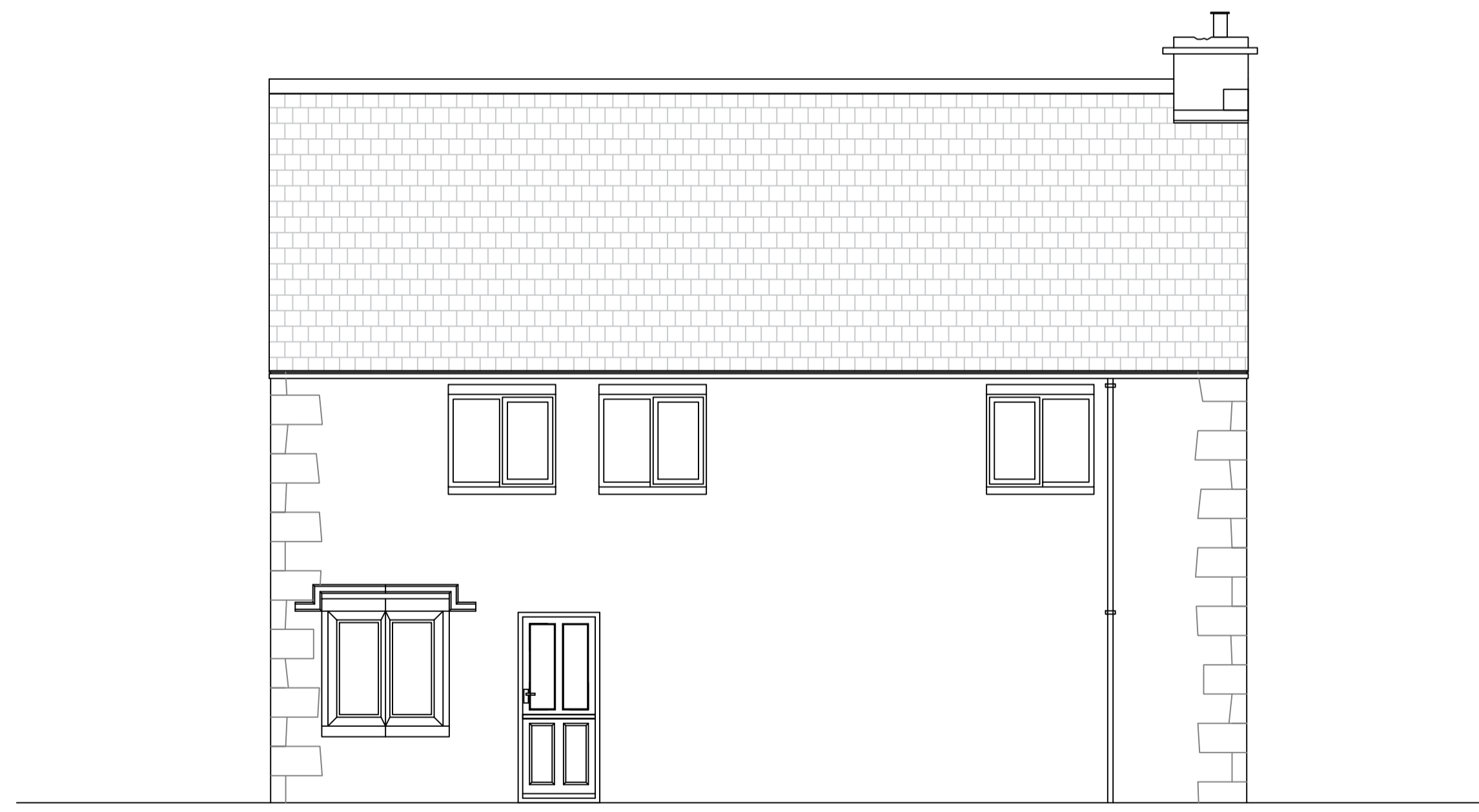
Existing Rear Elevation 1:50