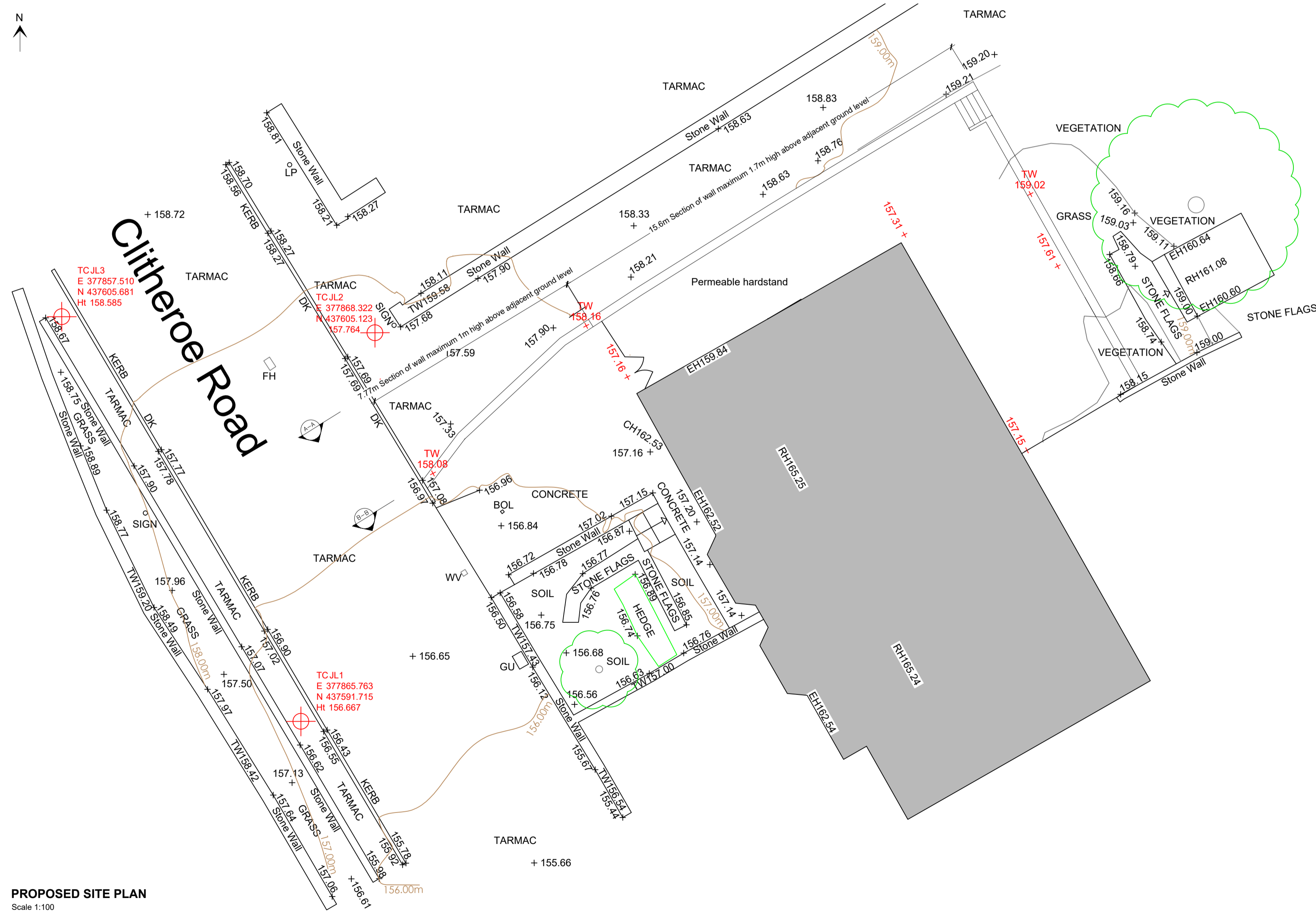
PROPOSED SITE PLAN Scale 1:100