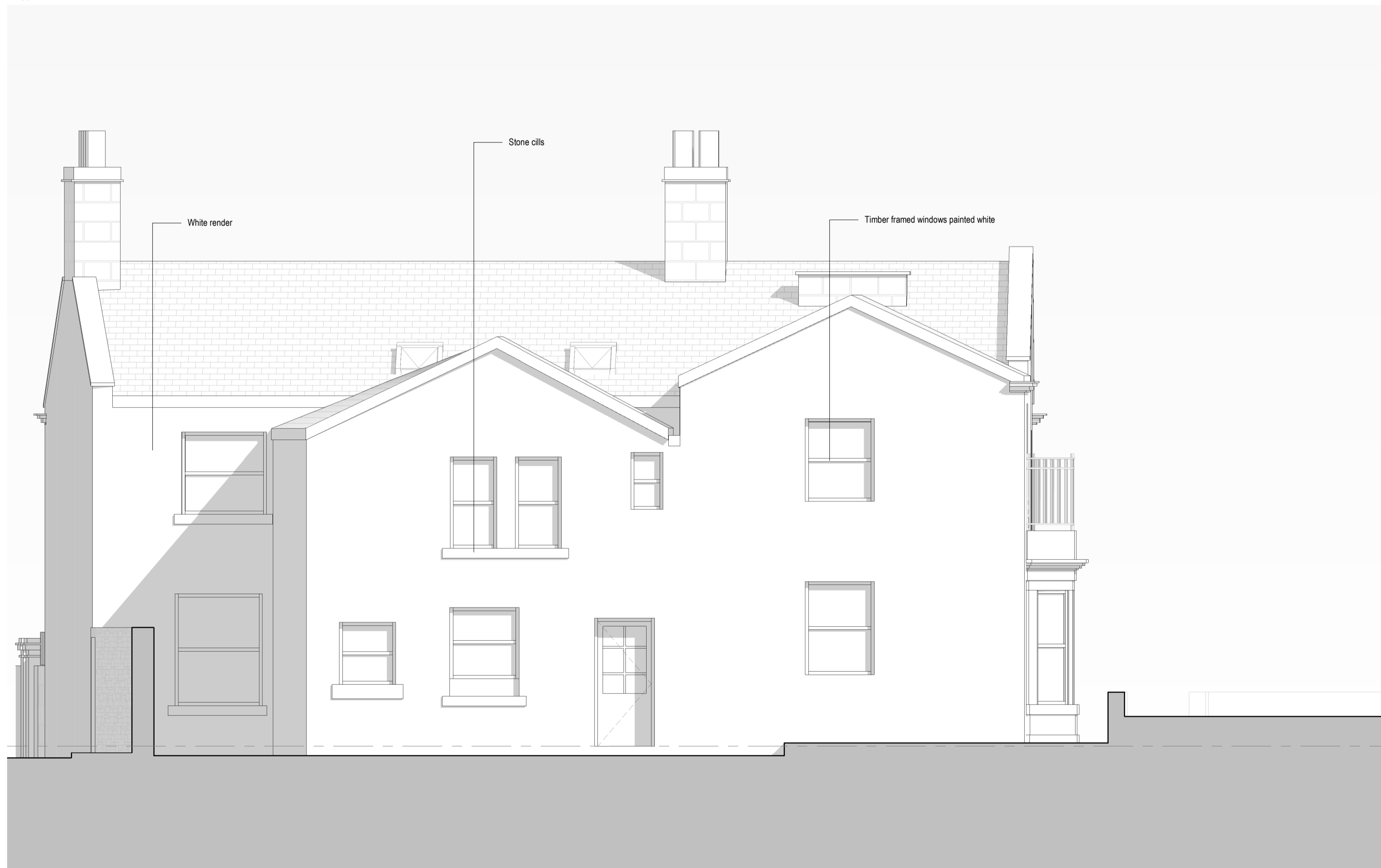
03 EXISTING ELEVATIONS - NORTH