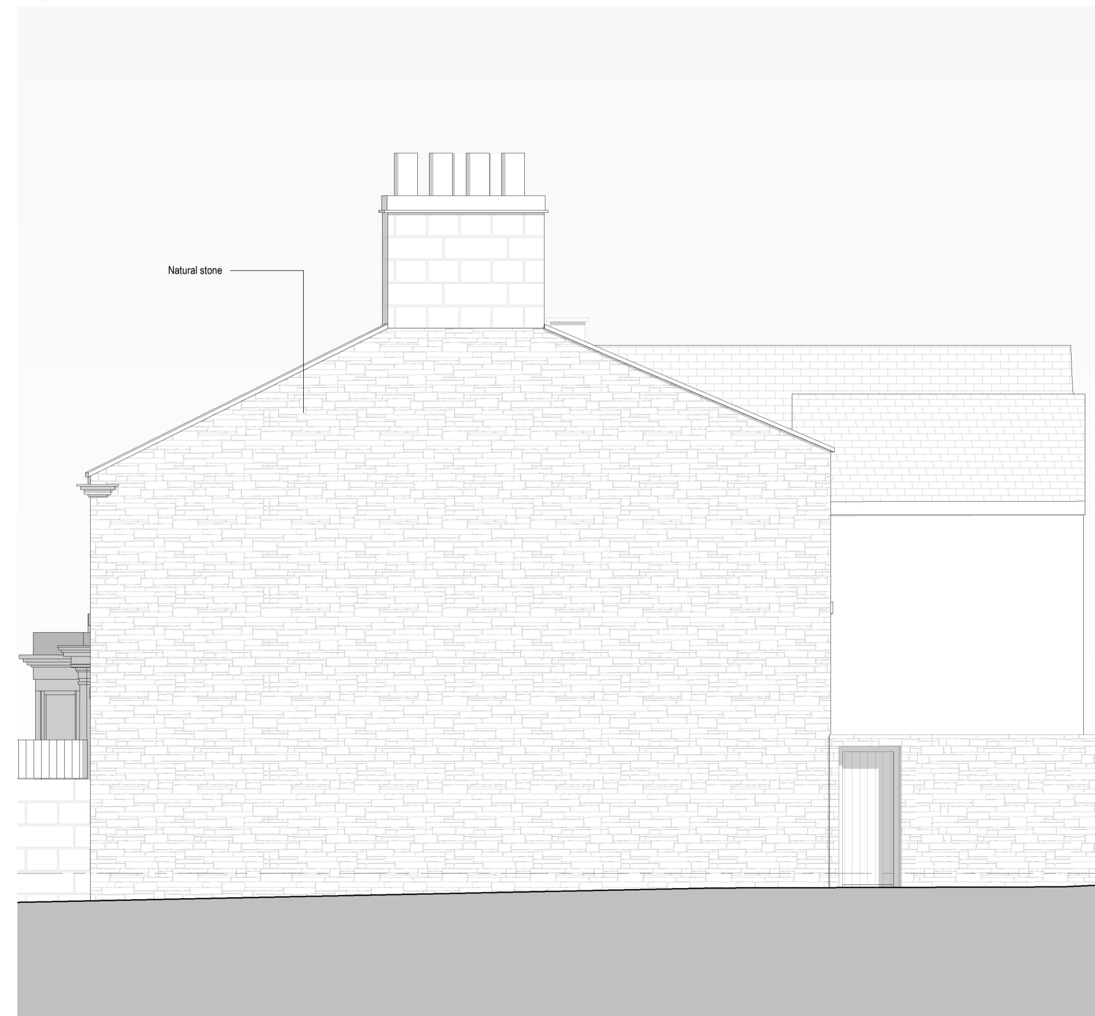
04 EXISTING ELEVATIONS - EAST