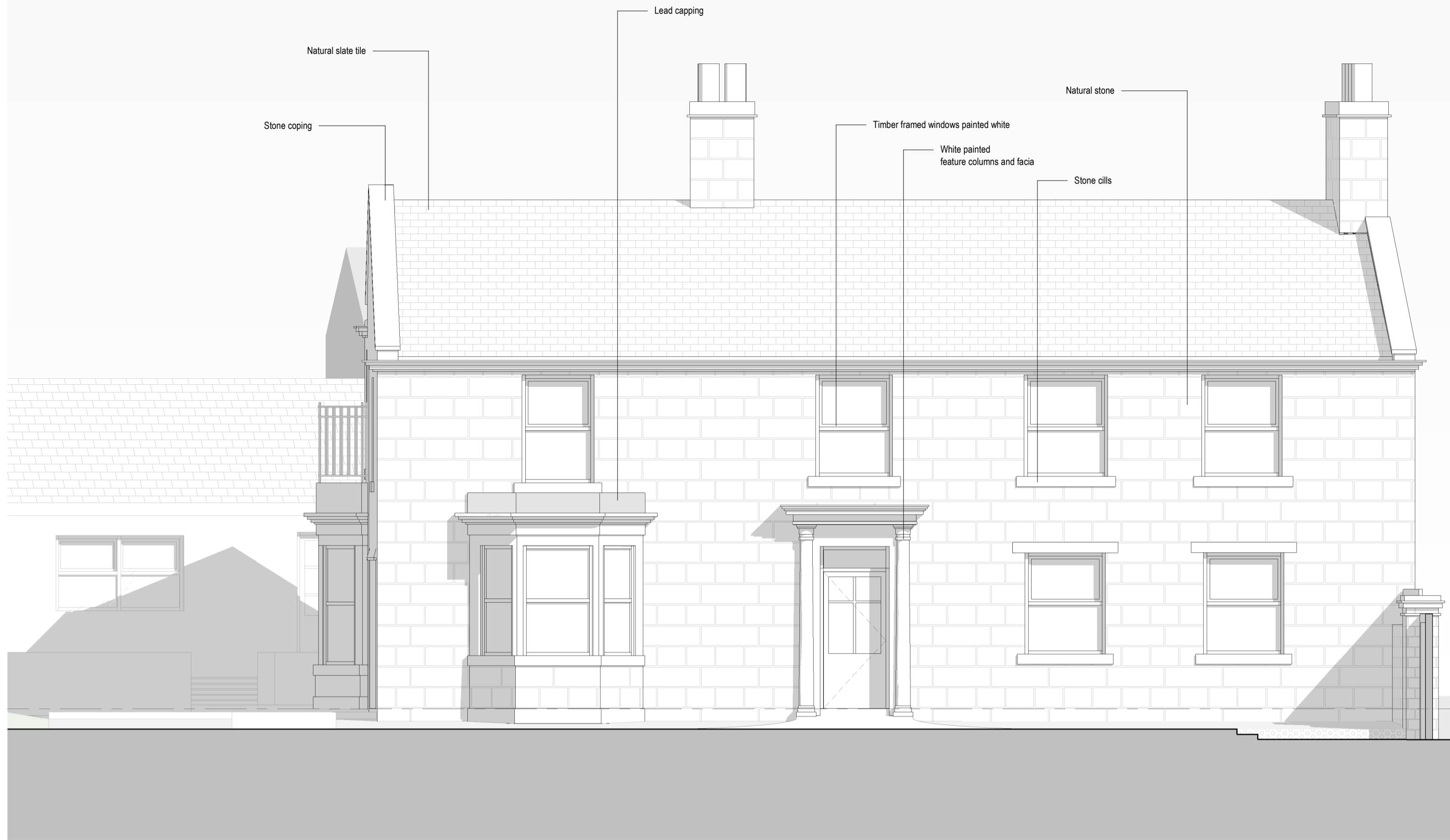
01 EXISTING ELEVATIONS - SOUTH