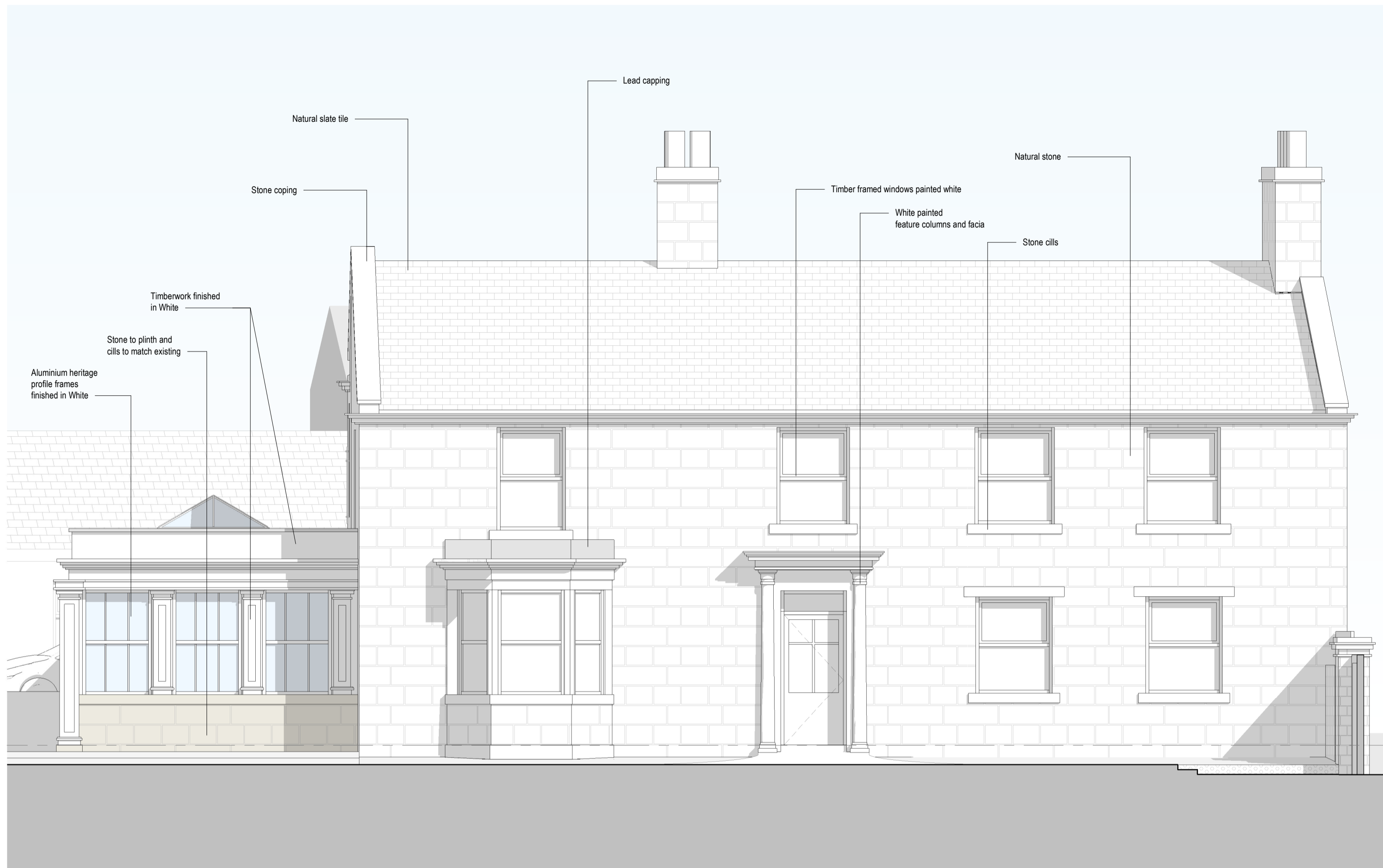
01 PROPOSED ELEVATIONS - SOUTH