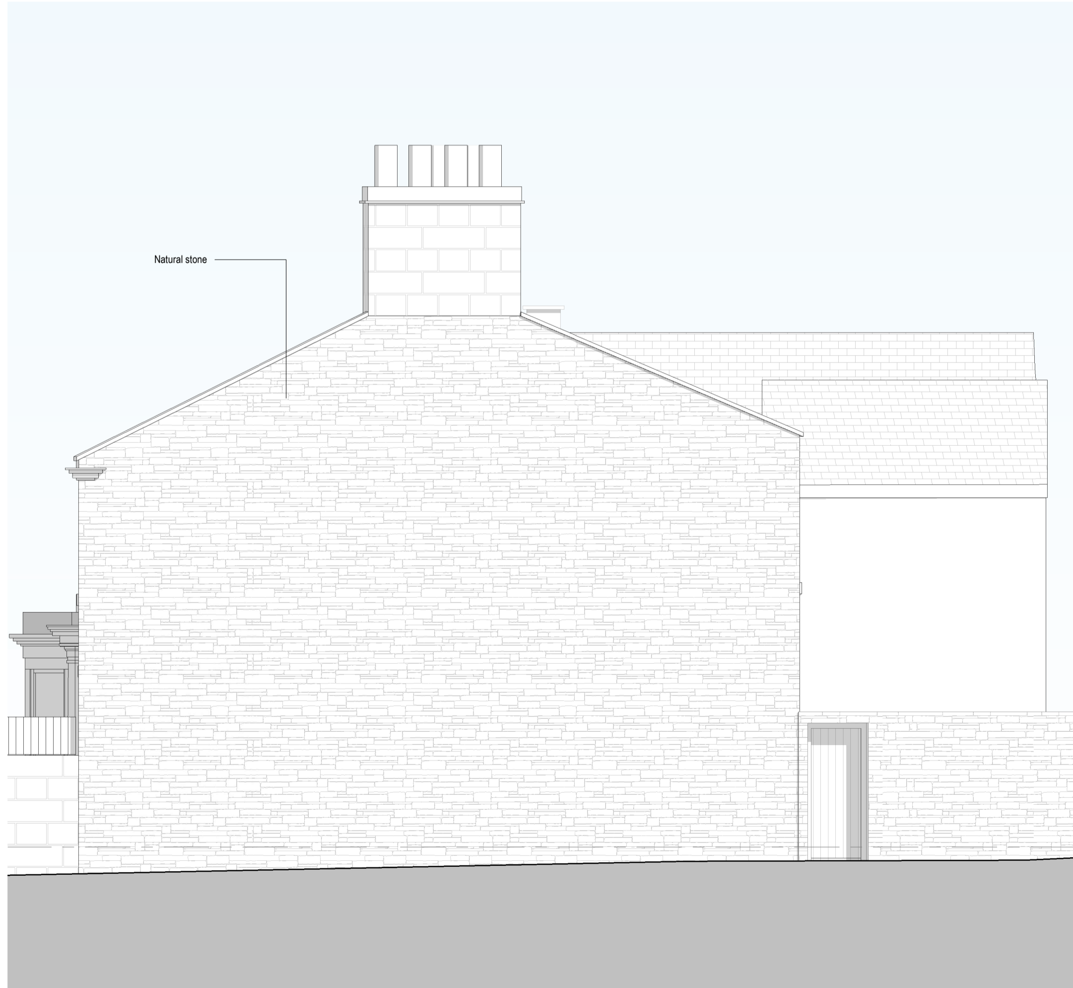
04 PROPOSED ELEVATIONS - EAST