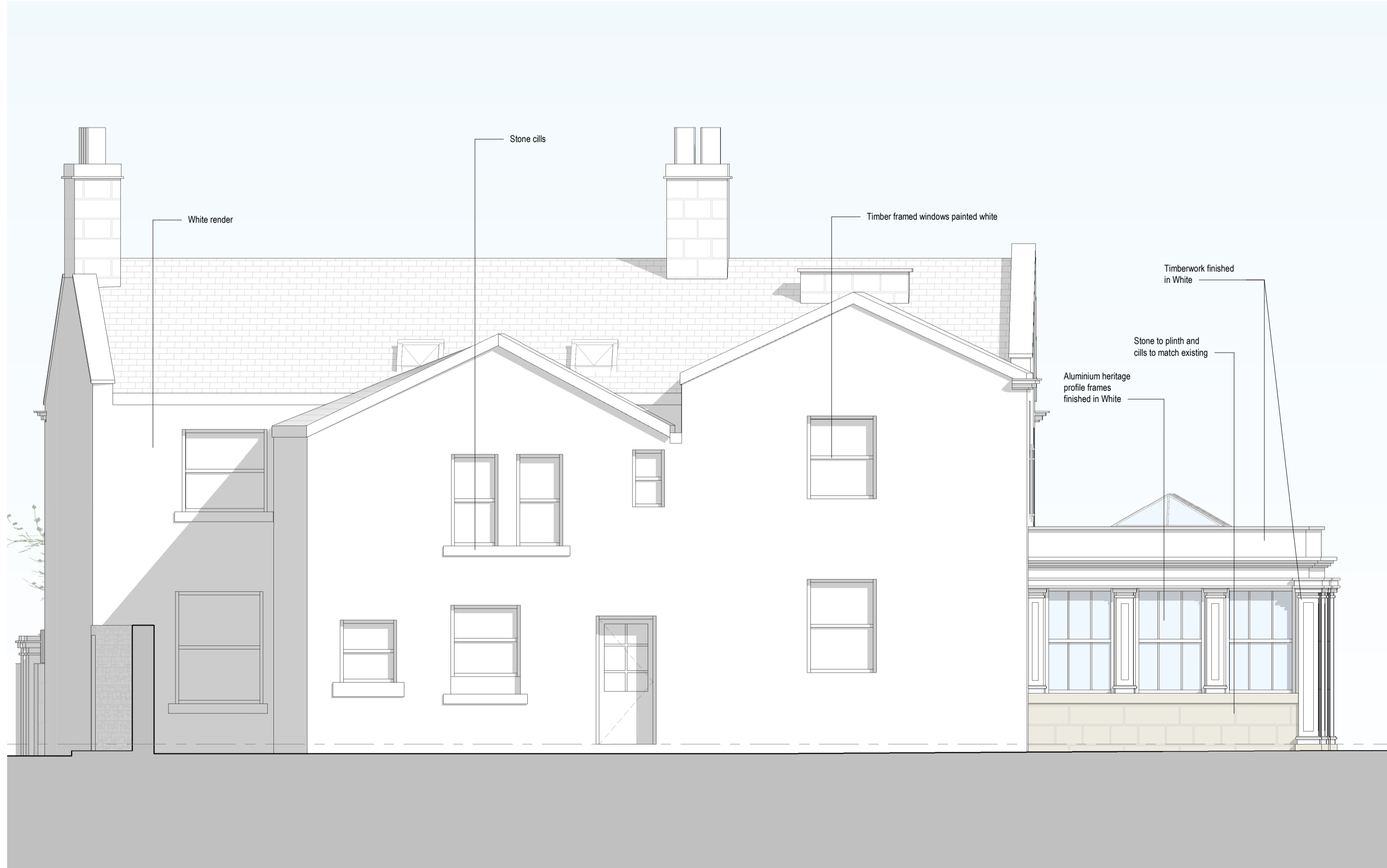
03 PROPOSED ELEVATIONS - NORTH