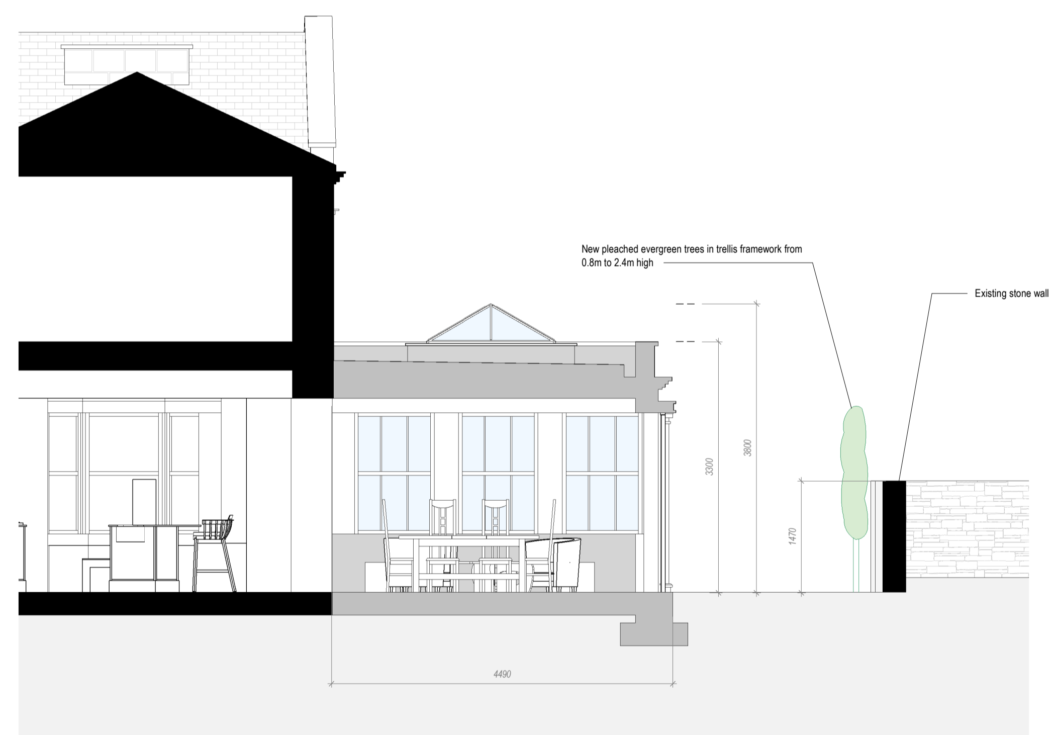
PROPOSED SECTION 02 - SHORT SECTION THROUGH EXTENSION AND BOUNDARY 1:50