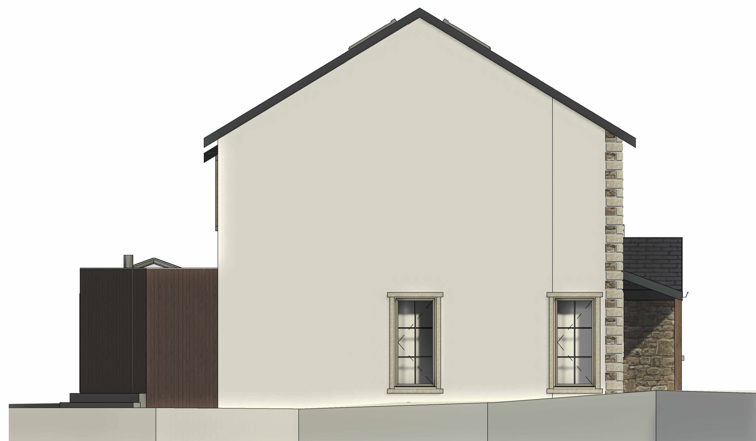
1 PROPOSED WEST 1 : 50