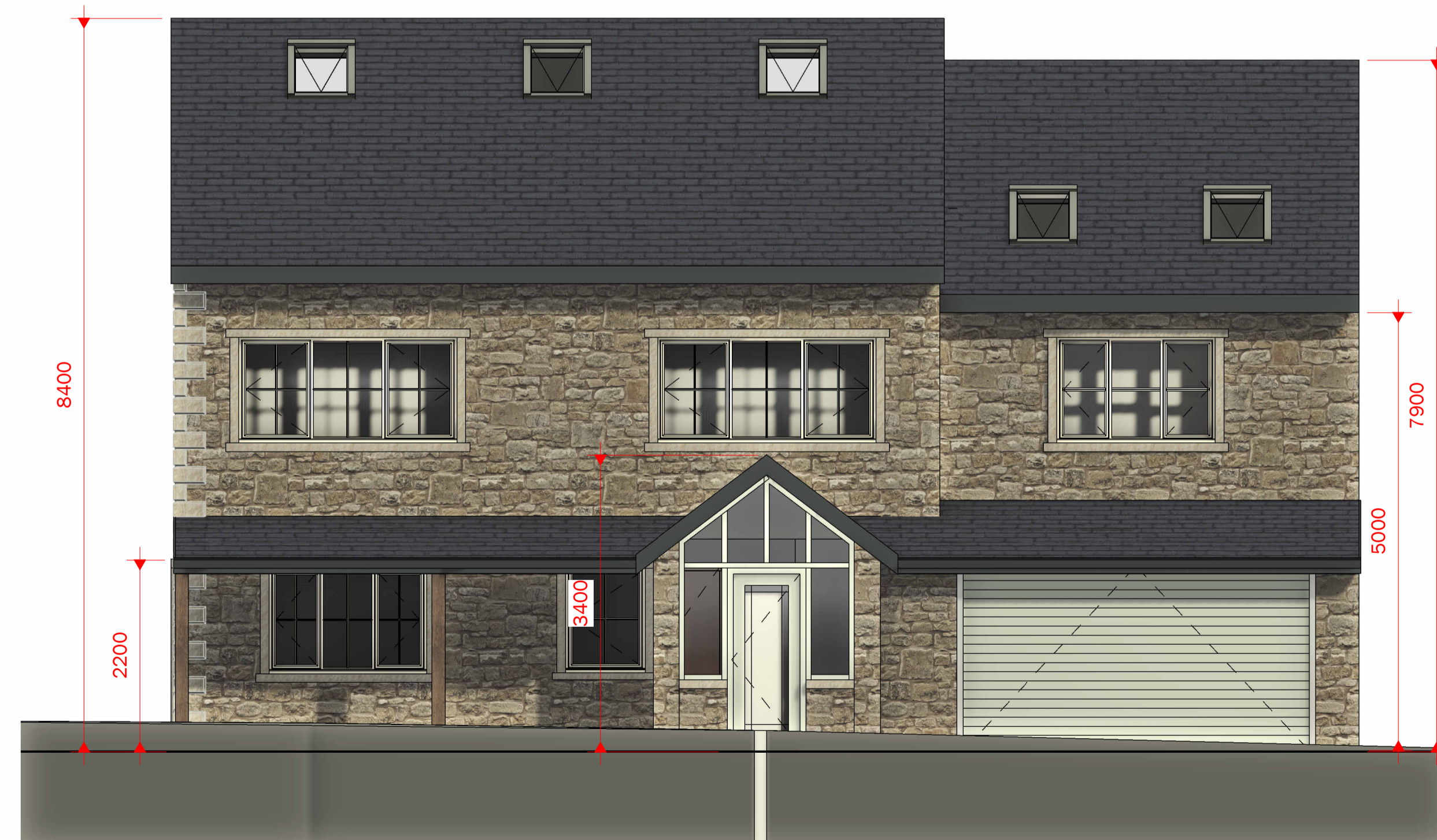
2 PROPOSED SOUTH 1 : 50