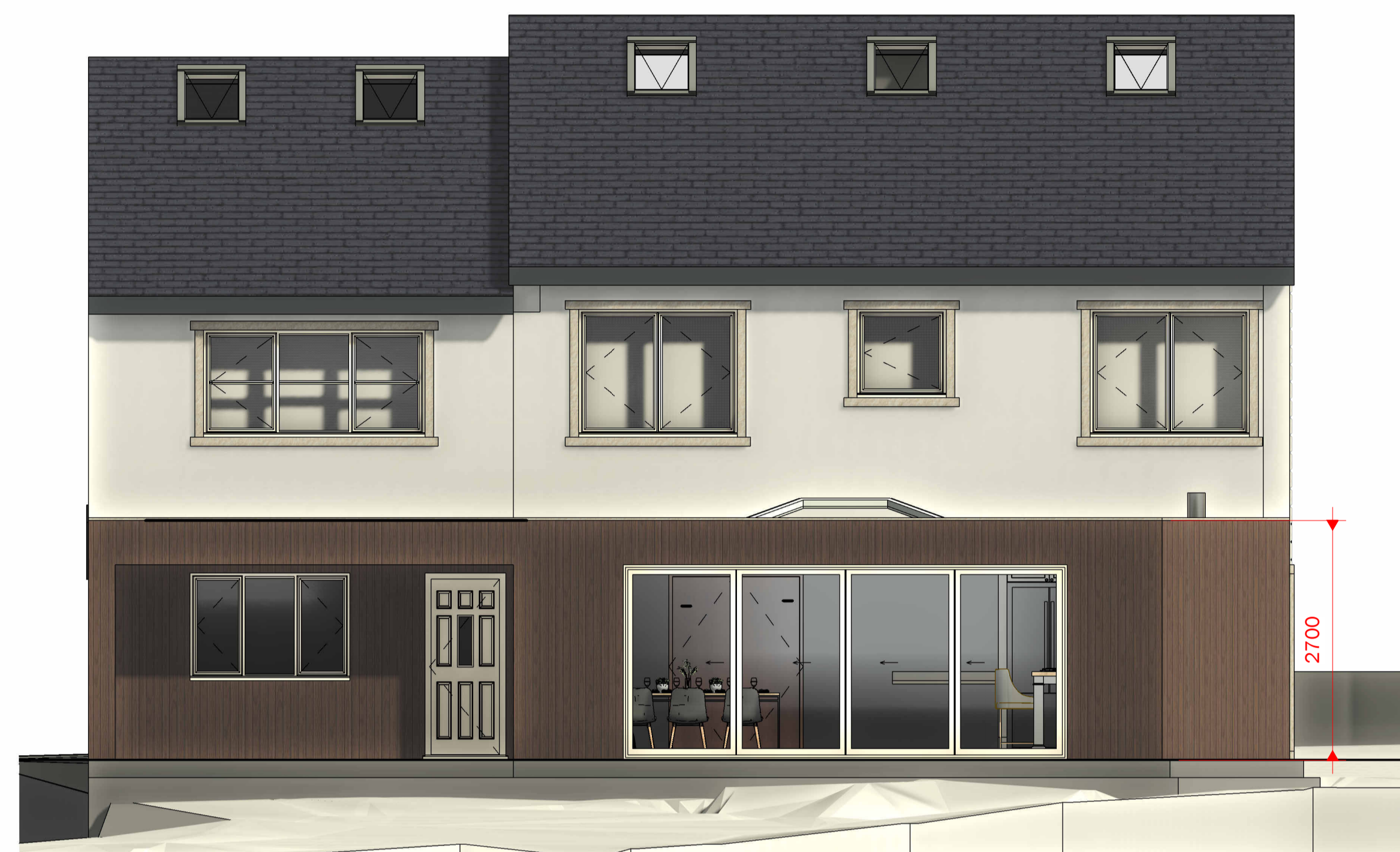
3 PROPOSED NORTH 1 : 50