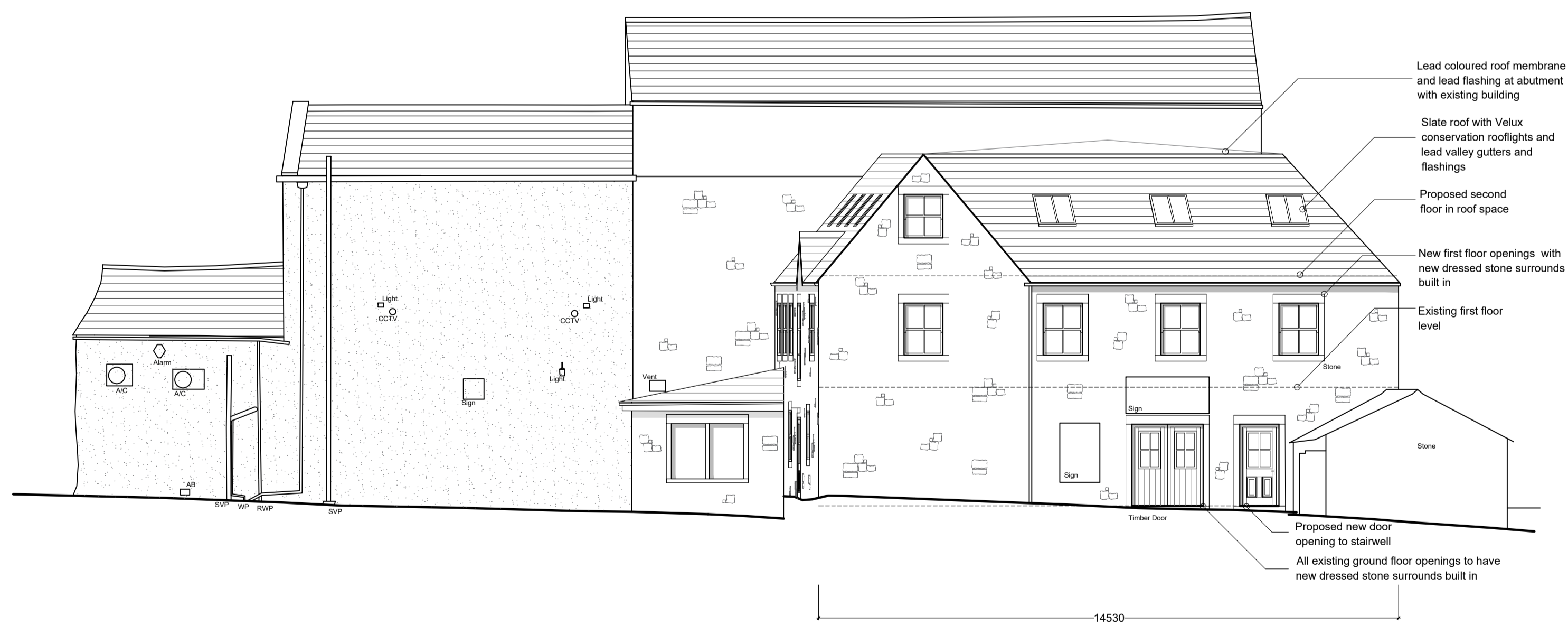
▼ 80.00m above OS Datum North East Elevation