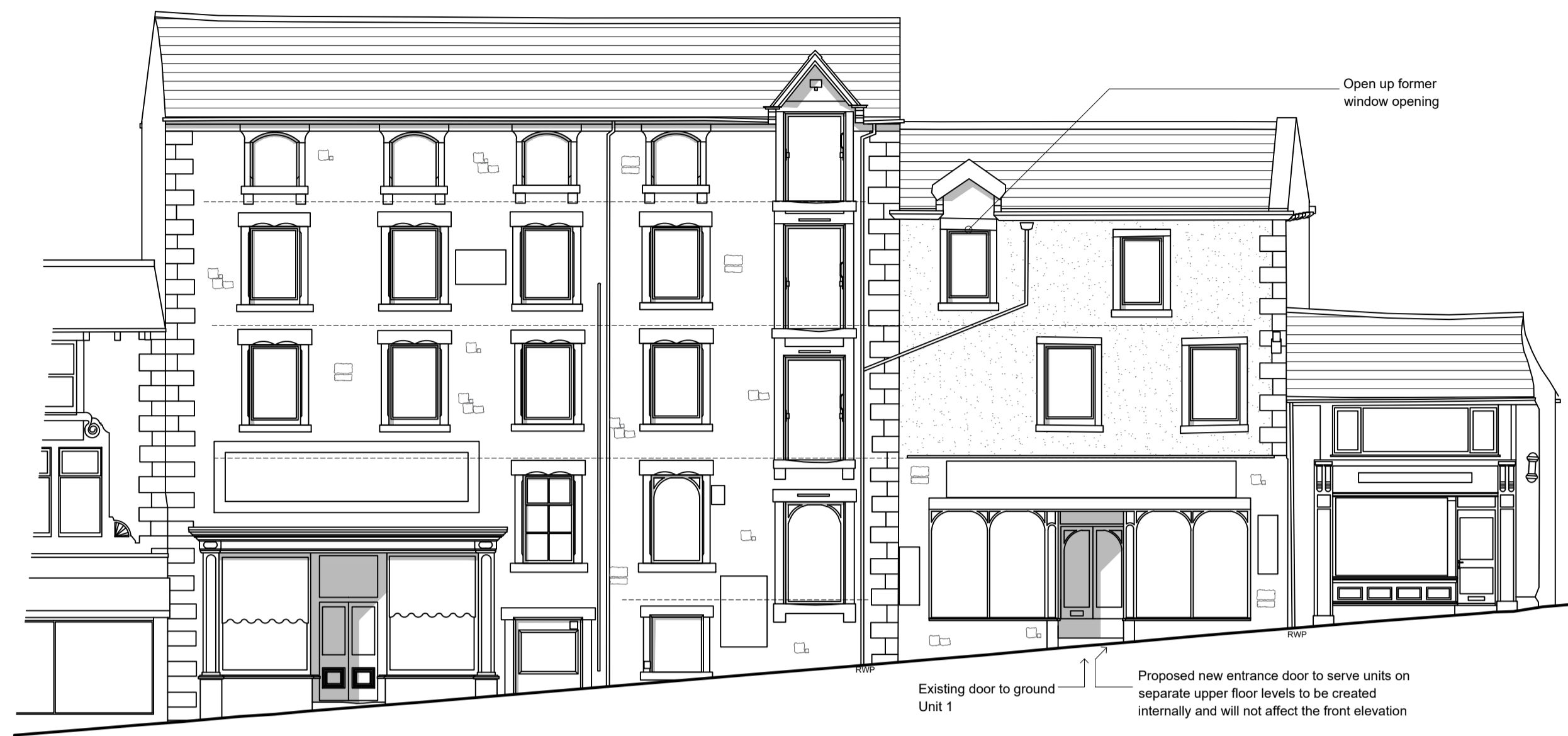
▼ 80.00m above OS Datum South West Elevation