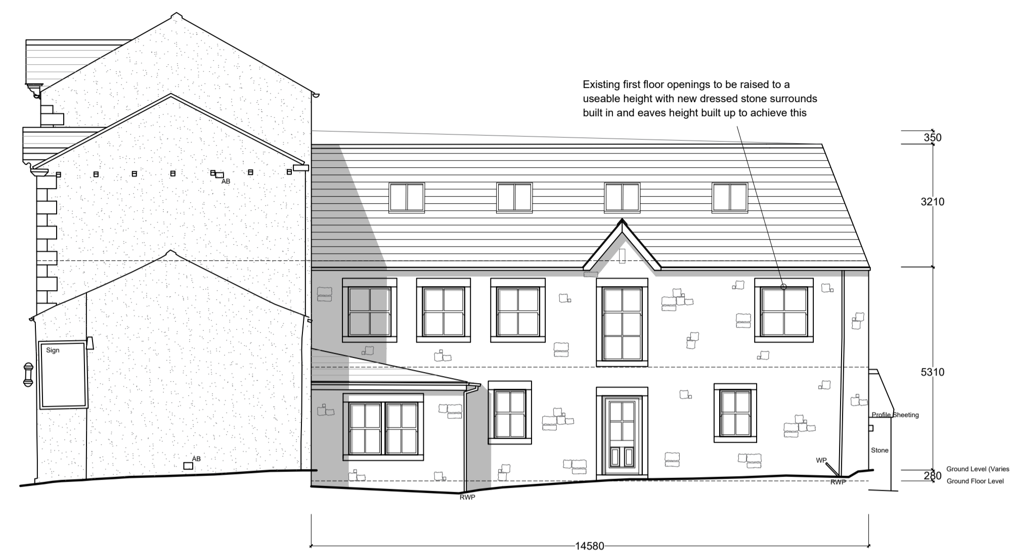
▼ 80.00m above OS Datum South East Elevation