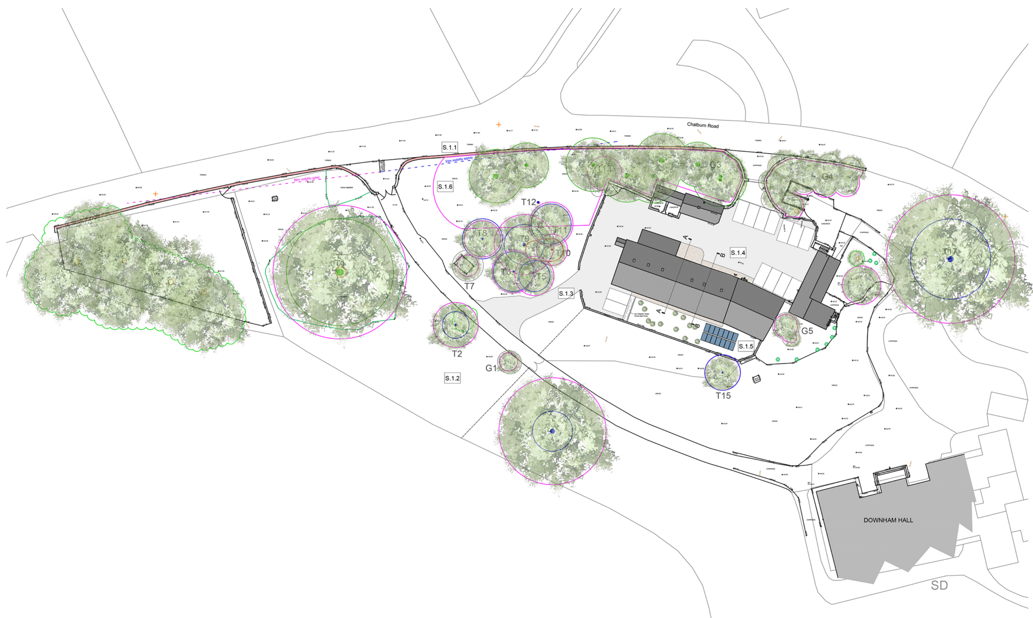
PROPOSED SITE PLAN SCALE 1:500