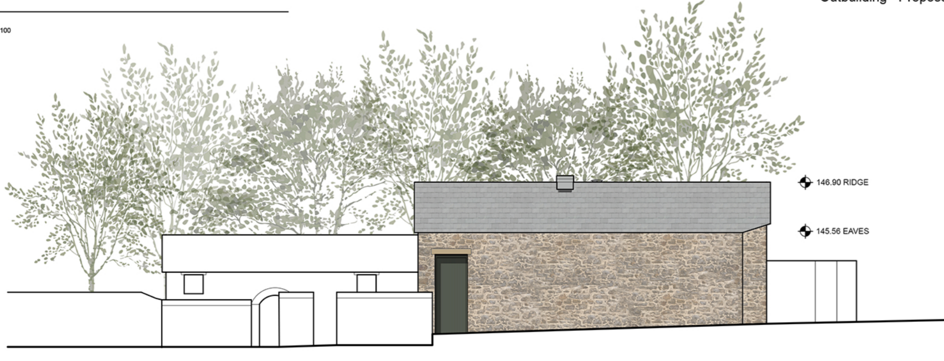
▼ 140.00m above OS Datum Outbuilding - Proposed South West Elevation - Scale 1:100