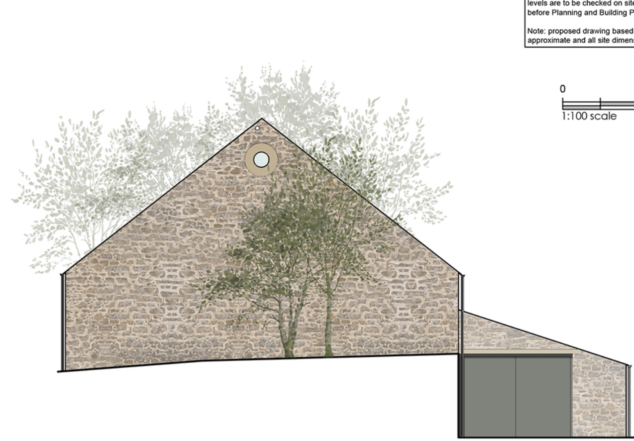
▼ 140.00m above OS Datum Proposed South East Elevation (Aisled Barn) - Scale 1:100