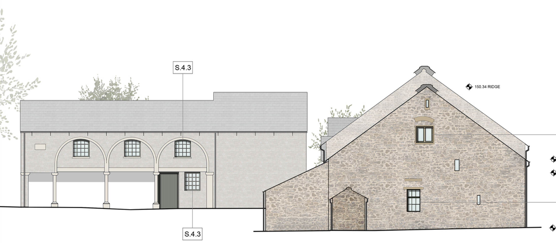
▼ 140.00m above OS Datum Proposed North West Elevation - Scale 1:100