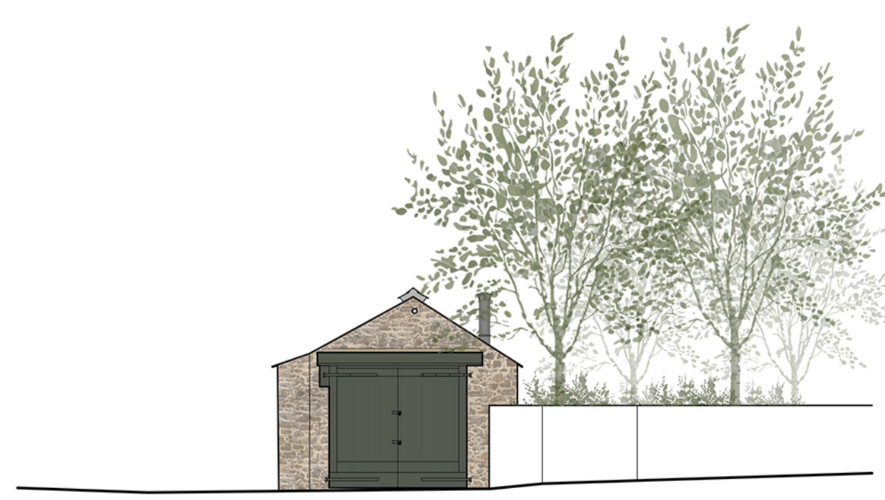
▼ 140.00m above OS Datum Outbuilding - Proposed South East Elevation - Scale 1:100