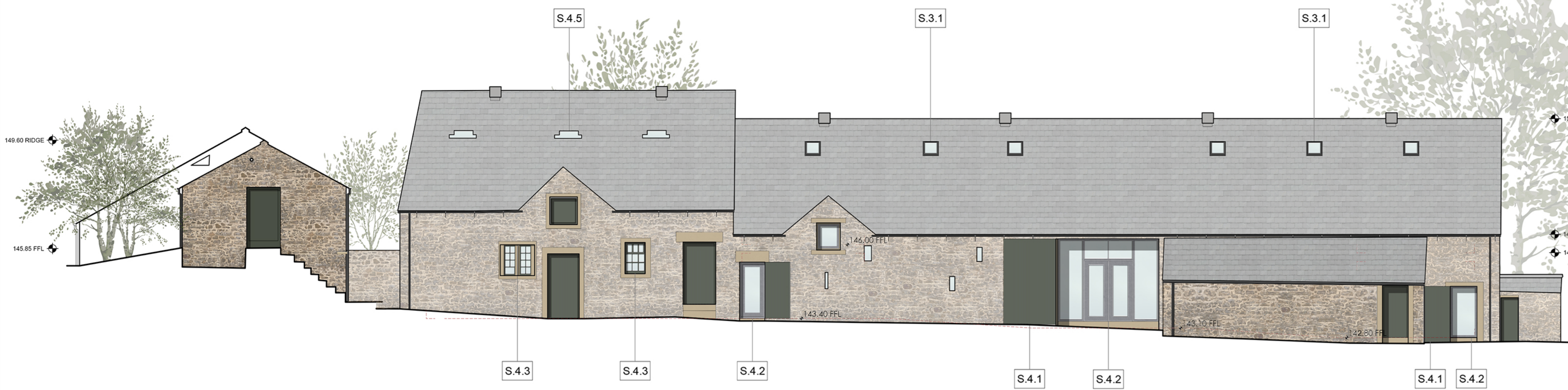
▼ 140.00m above OS Datum Proposed North East (Front) Elevation - Scale 1:100