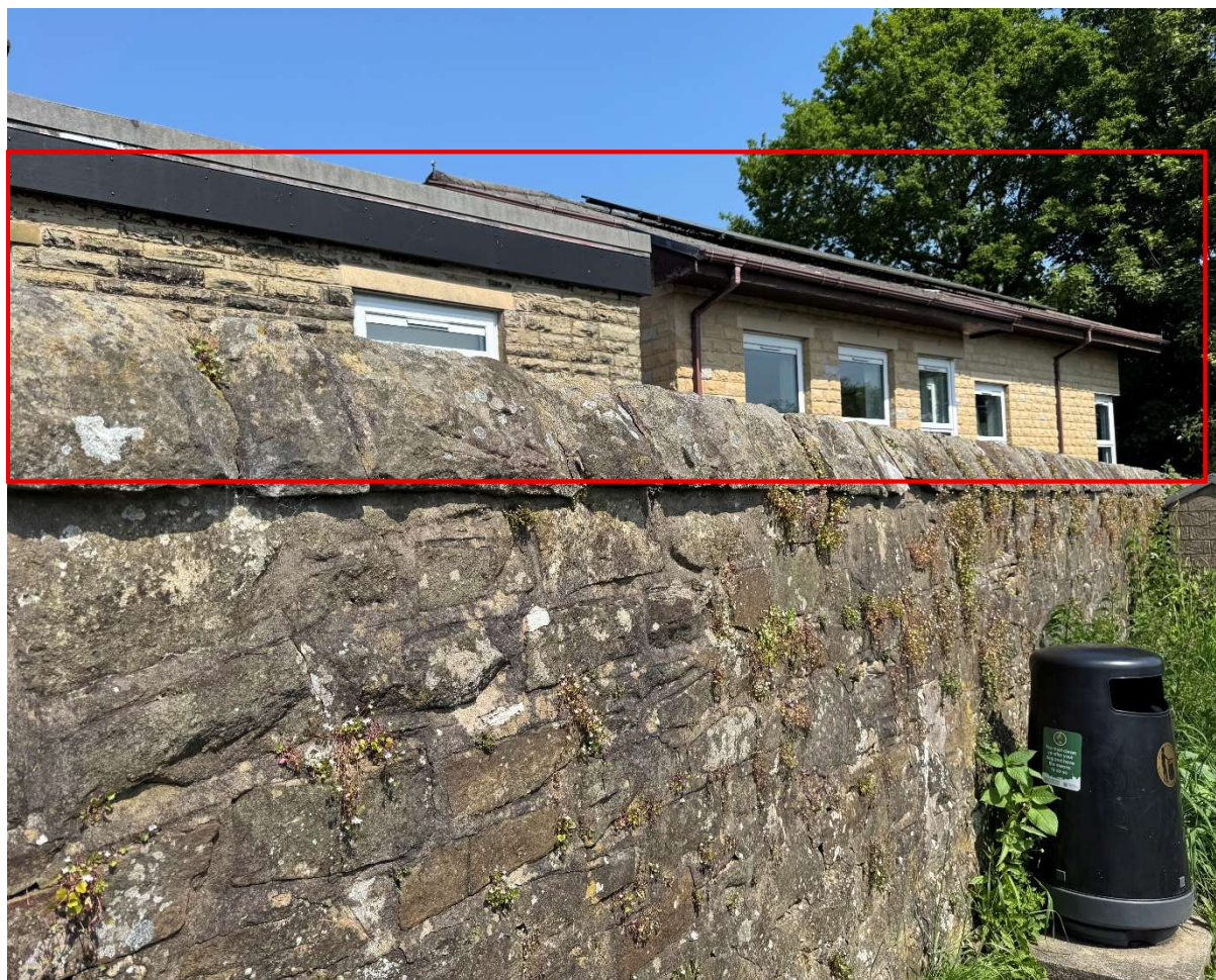
Figure 8. Photographs of proposed location of fencing on the Front and Riverside Elevations of the school