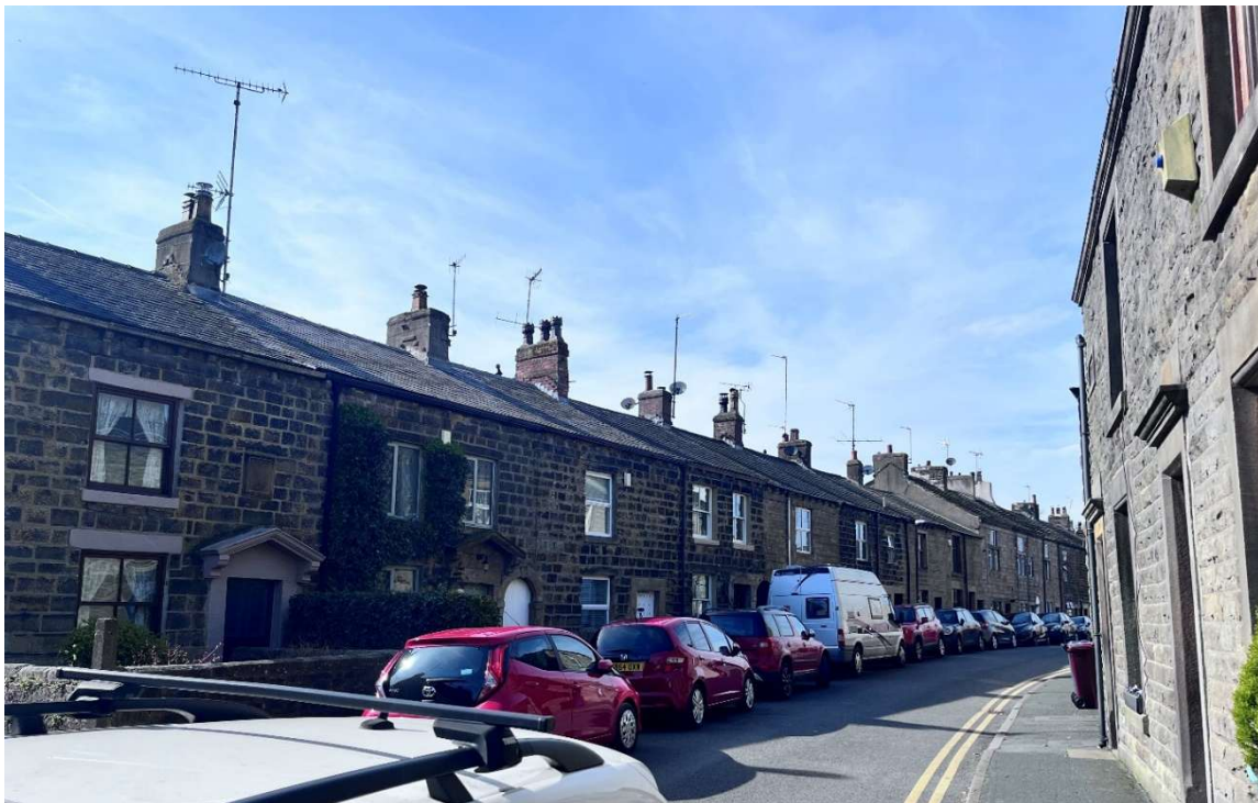
Figure 7. Photograph of 8-15 Church Street