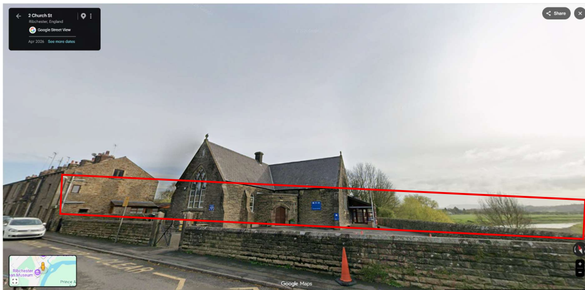
Figure 11. Photograph from road of the front elevation