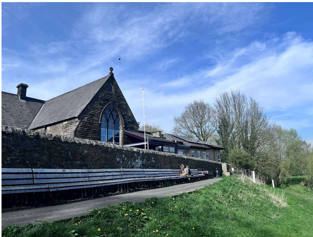
Figure 3. Side elevation of St Wilfrid's Primary School taken from the riverside