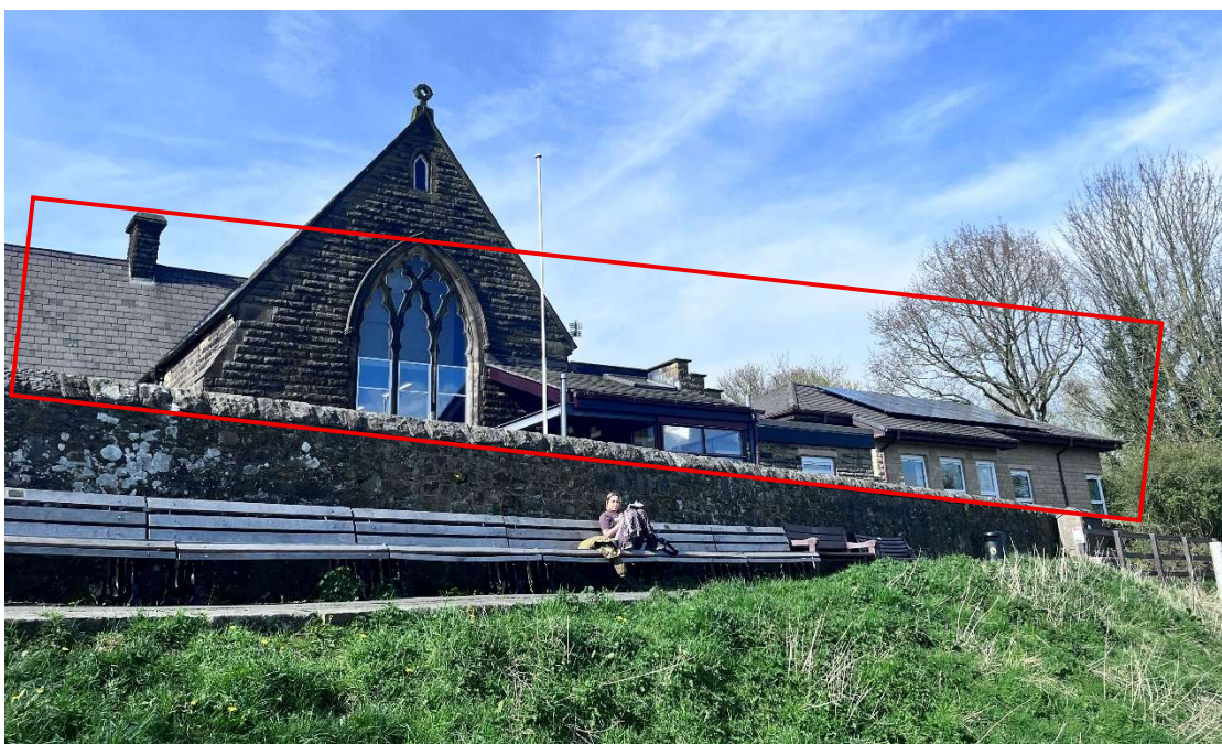
Figure 10. Photograph from footpath and riverside to the south of the site