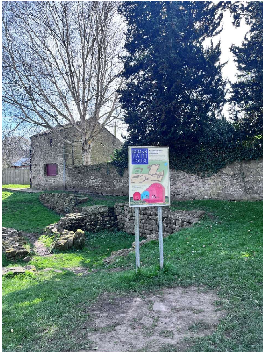
Figure 2. Ribchester Roman Bath House located to the northeast of the site