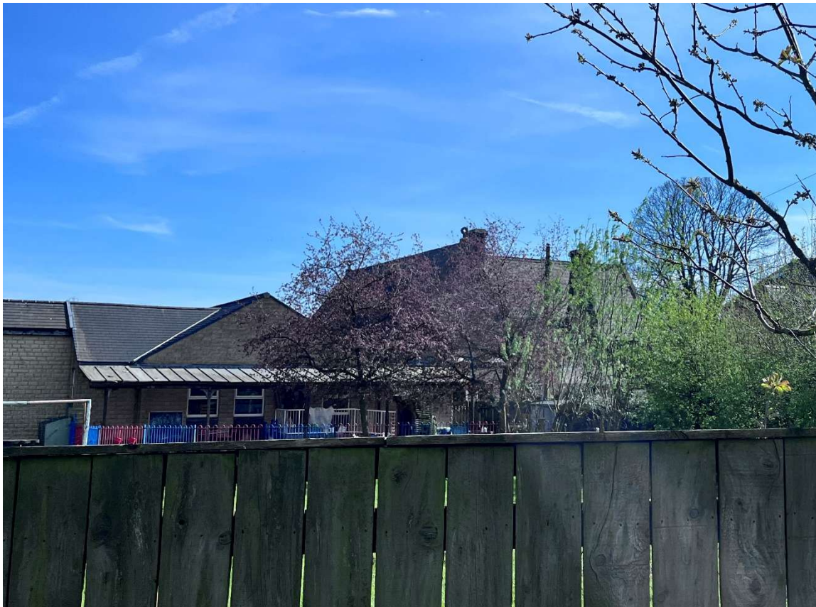
Figure 11. Photograph looking to the north of the site from the Roman Bath House