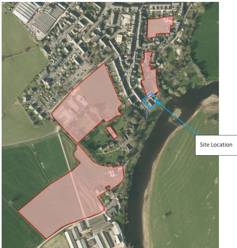
Figure 6. Ribchester Roman for Scheduled Monument areas