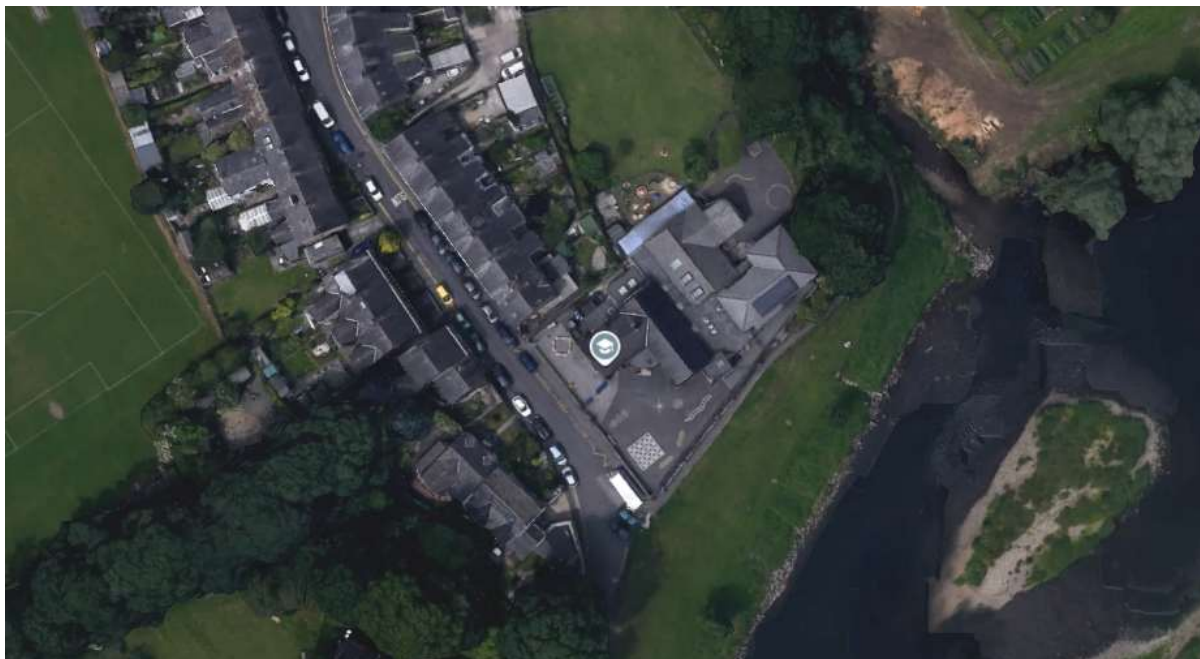
Figure 1. Site Location