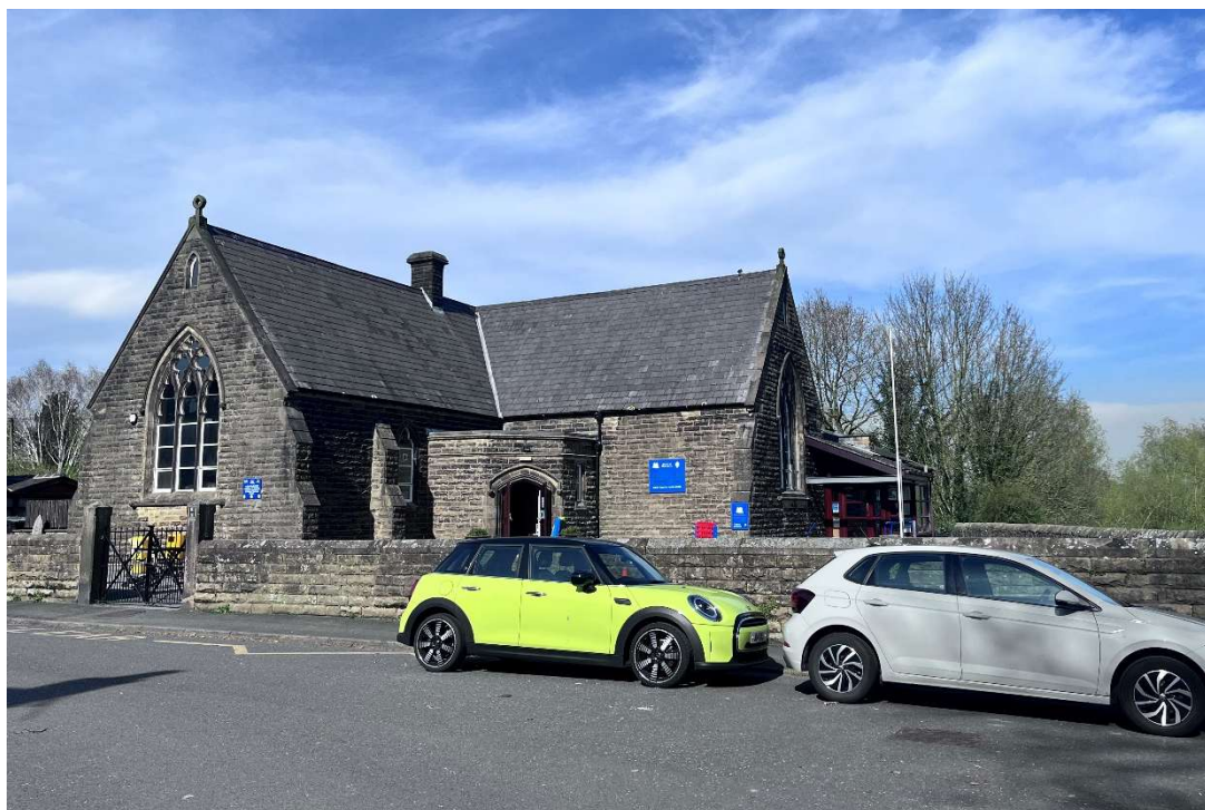
Figure 4. Front elevation of St Wilfrid's Primary School taken from the southwest