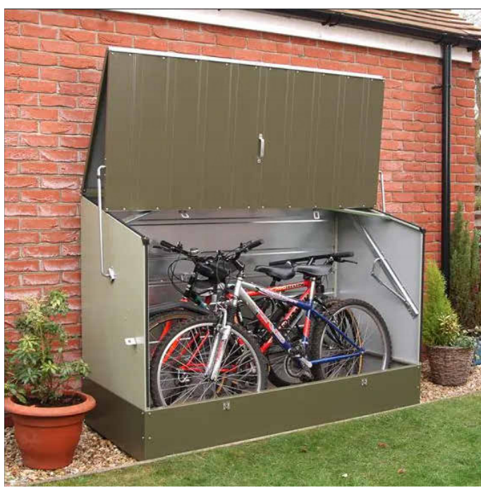
CYCLE STORAGE 2M X 0.9M