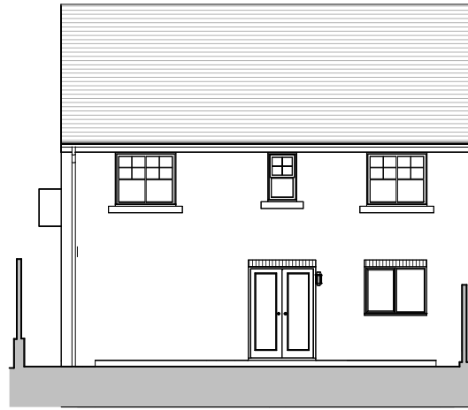
South West Existing