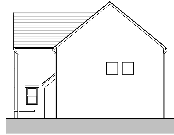
North West Existing