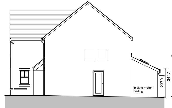
North West Proposed