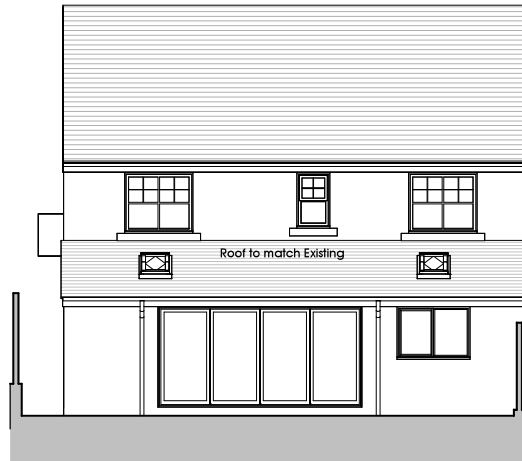
South West Proposed