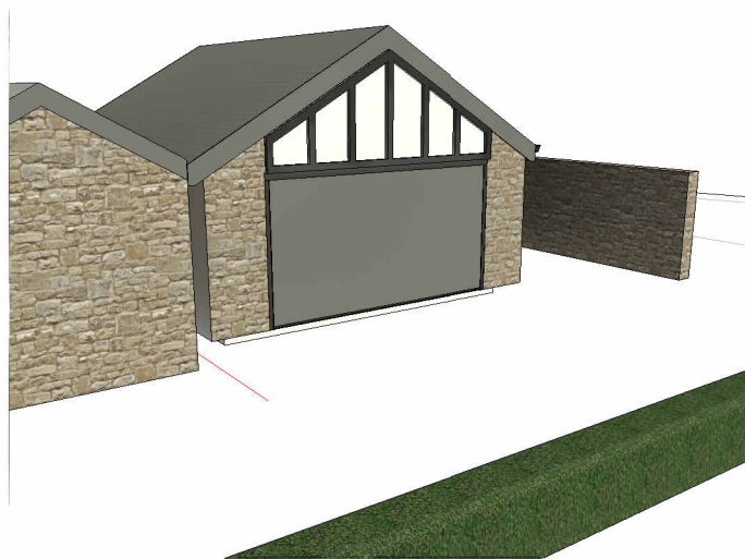
6 3D VISUAL 2