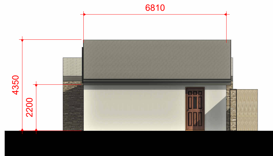
2 PROPOSED SIDE 1 : 50