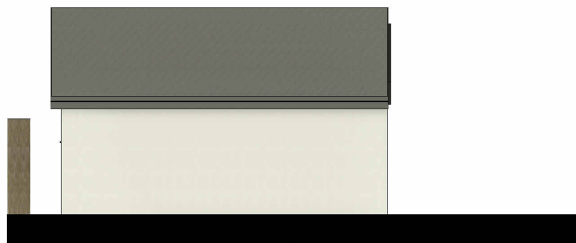
5 PROPOSED SIDE 2 1 : 50