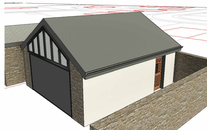
3 3D VISUAL