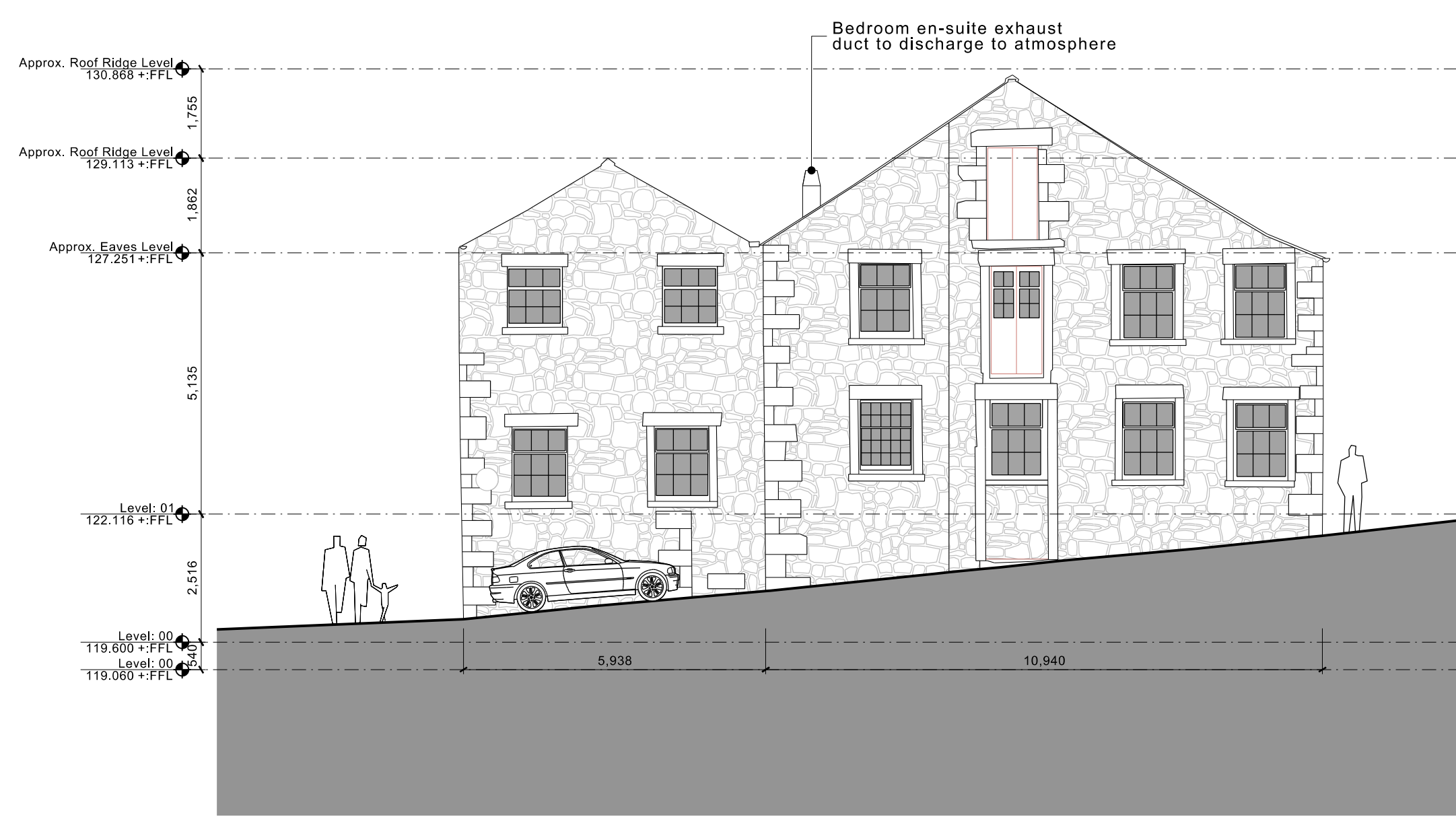
Elevation 10 (East Facing)