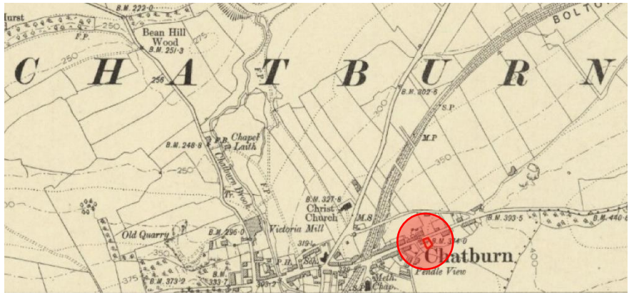
Figure 2, Historic map 1844 (NSL, 2020)

49 Downham road is shown in the early 1840's ordinance survey maps. It lays within the Chatburn Conservation Area, albeit, it is not classified as a heritage asset by the borough council.