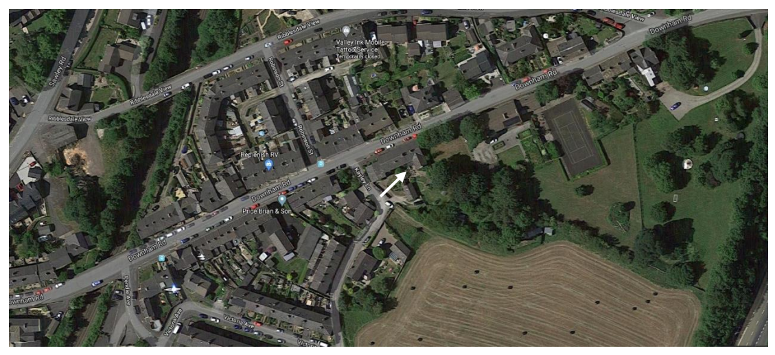
Figure 4, Visual Impact (Google maps, 2020)

49 Downham Rd is located on the south of Downham Road; the proposed work is to take place at the rear of the building. Albeit the proposal will not be visible from Downham Road, it will be partially visible from Kayley Lane as shown below; however, the visual impact is minimal.