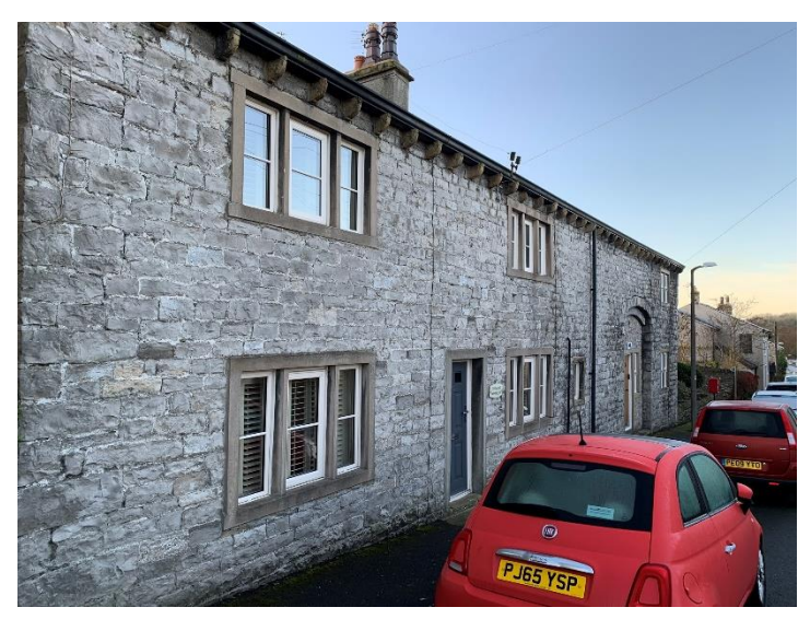
Figure 5, 49 & 49a Downham Road, Front Elevation