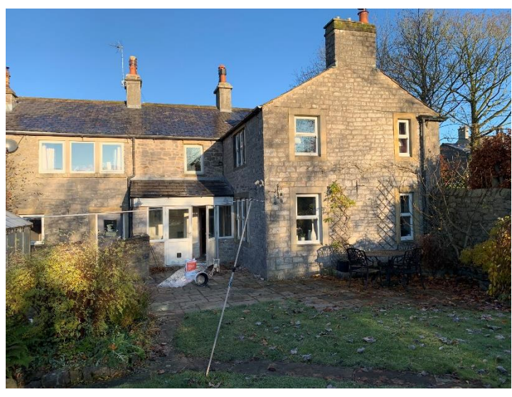
Figure 6, Rear Elevation (Authors Own, 2020)