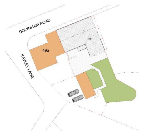
Figure 8, Existing Site Plan (Authors Own, 2020)