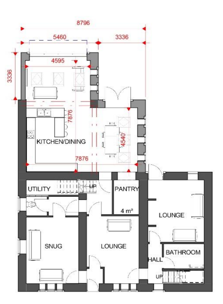
Figure 10 Proposed Floor Plan (Authors Own, 2020)