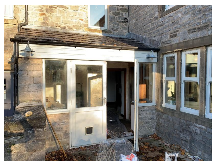
Figure 7, Rear Porch