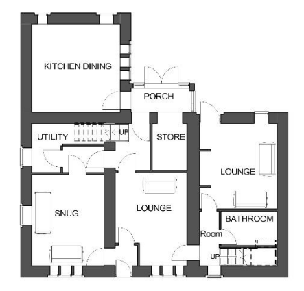
Figure 11, Existing Floor plan (Authors Own, 2020)