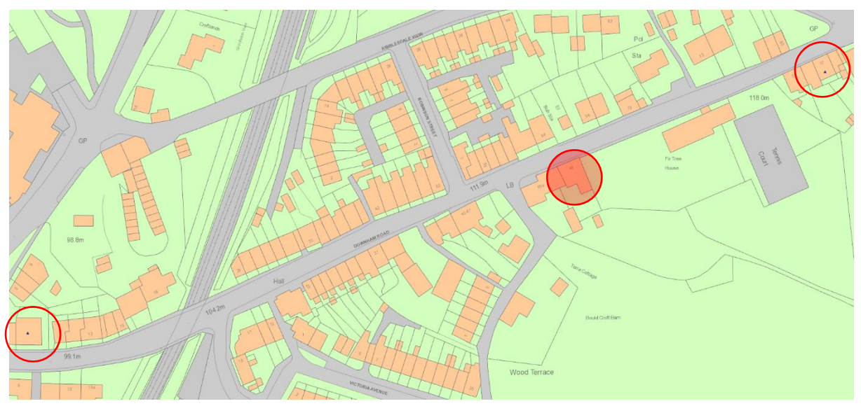
Figure 3. Heritage listing map (Historic England, 2020)

49 Downham Road is located within the Chatburn Conservation Area (CA). According to the Historic England database, the following fall within or are in close proximate to the building: