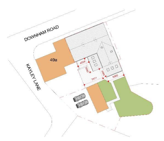
Figure 9, Proposed Site Plan (Authors Own, 2020)