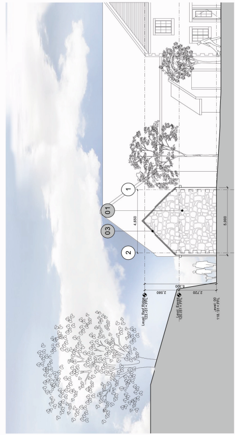
Elevation 04 (North-west facing)