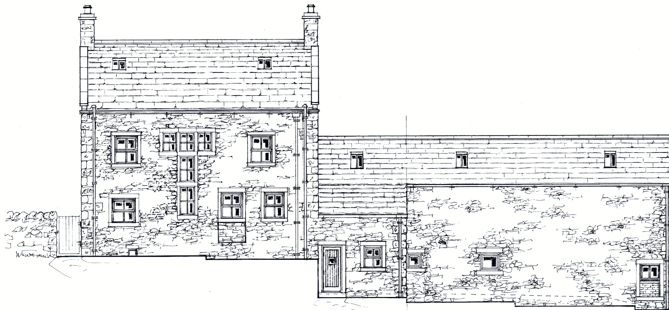
REAR ELEVATION (NORTH)