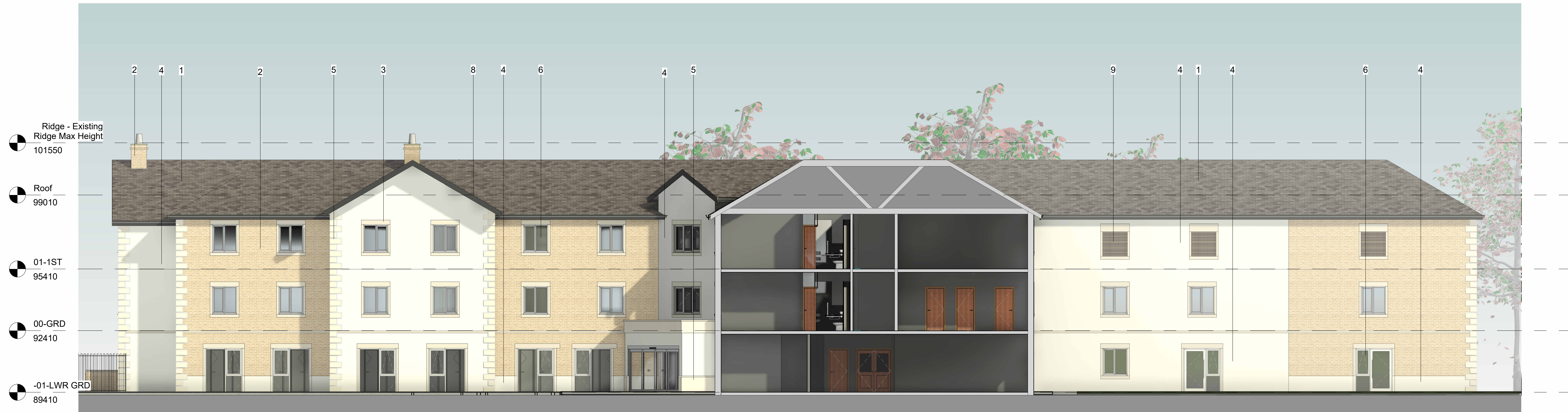
1 South Courtyard Elevation 1 : 100