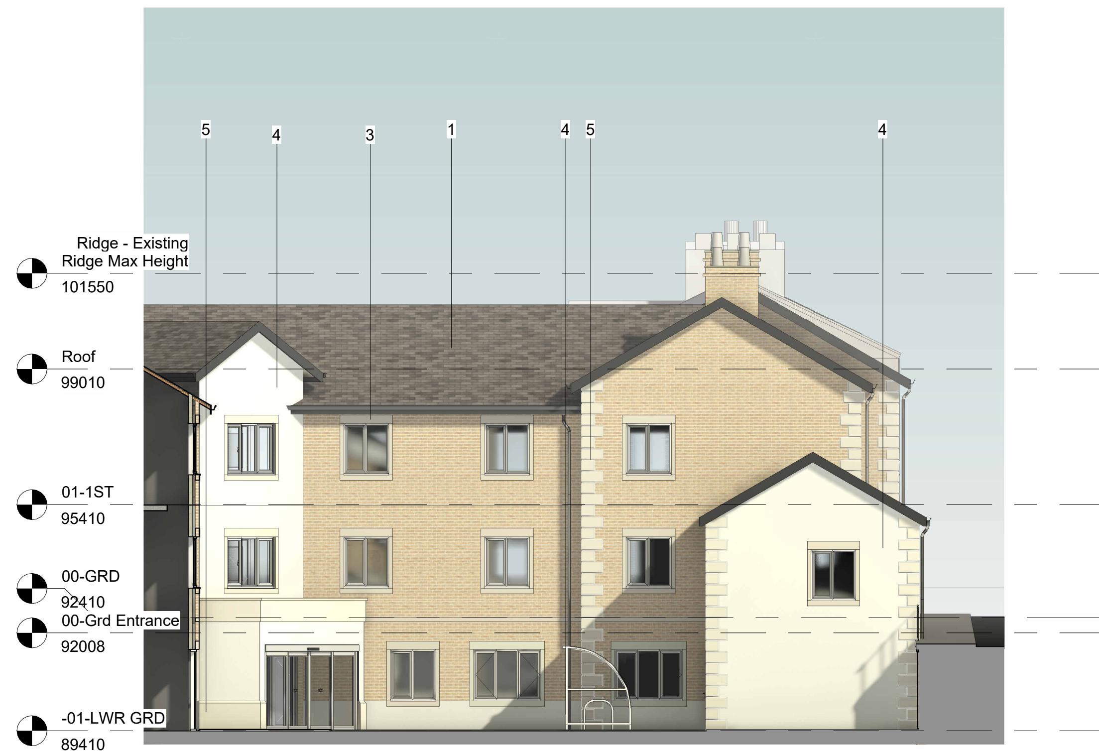
2 West Courtyard Elevation 1 : 100