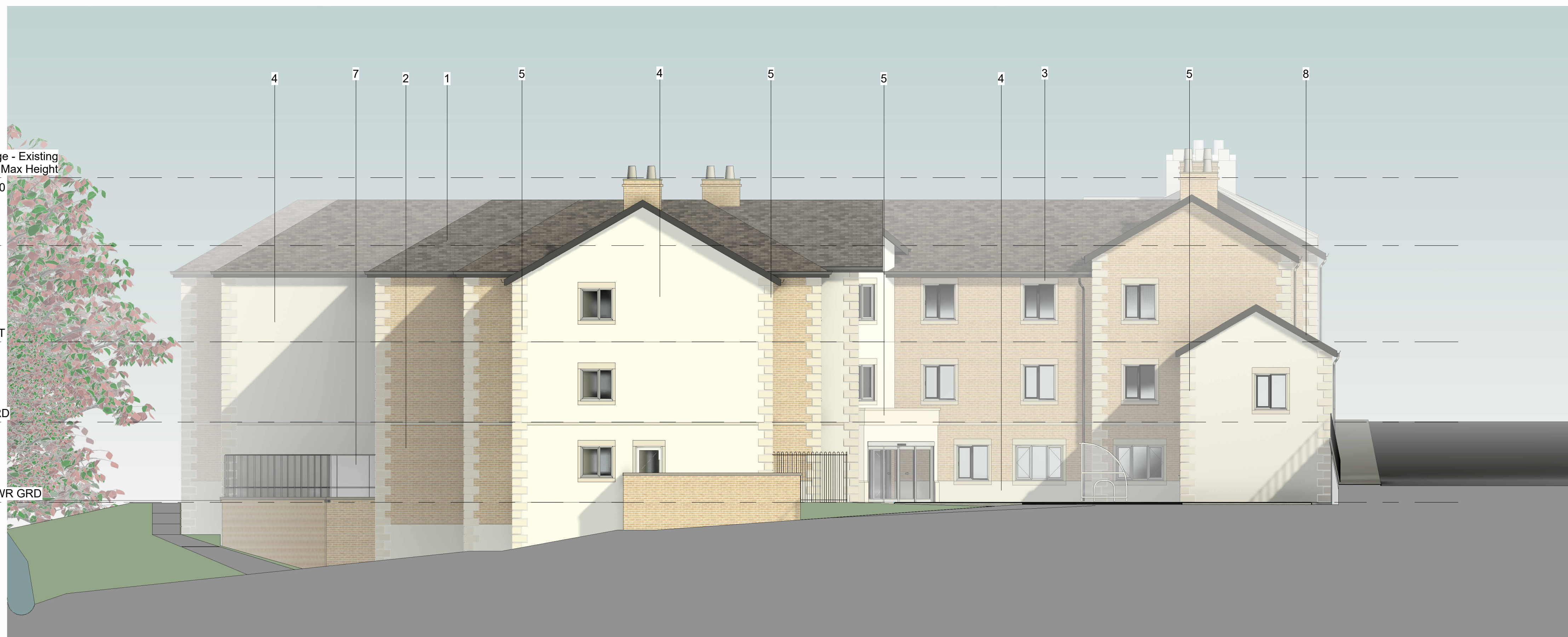
2 West Elevation 1 : 100