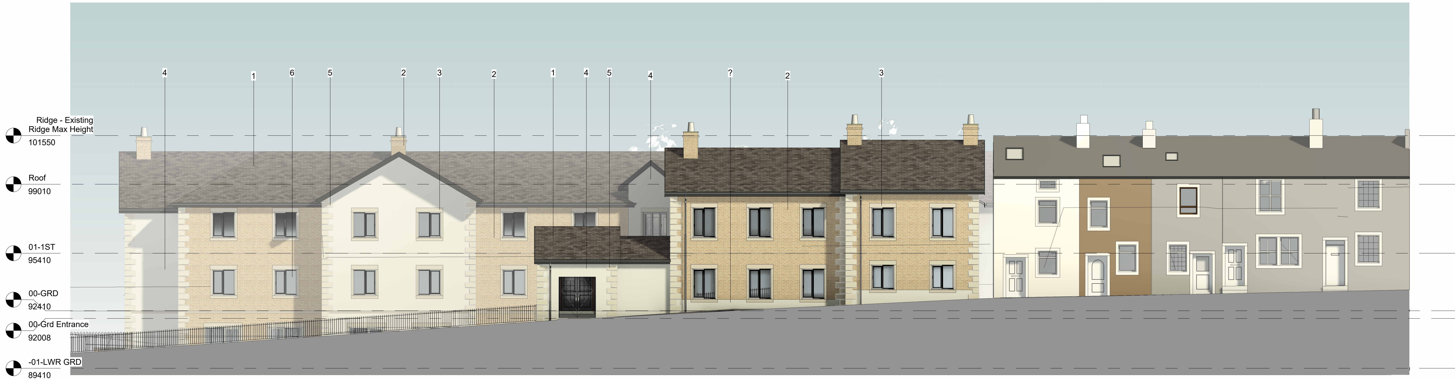
1 South Elevation 1 : 100