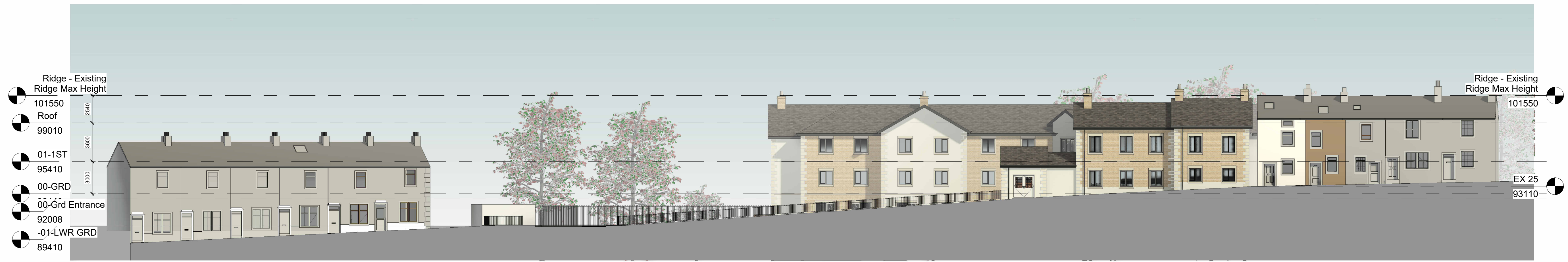
1 Proposed Street Scene 1 : 200