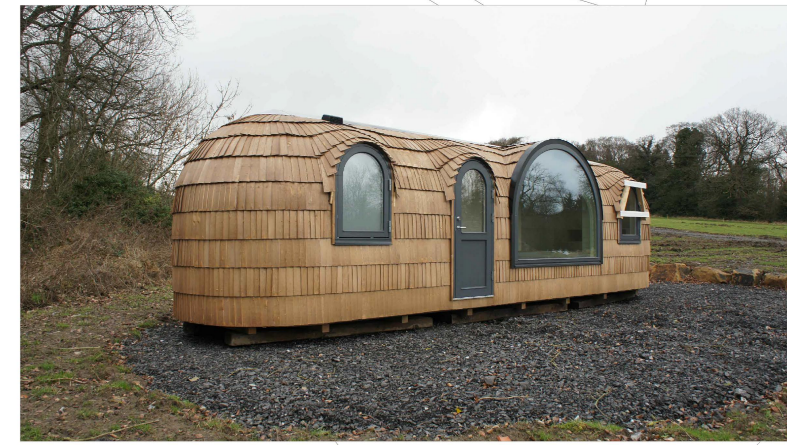
Figure 1: Eco Lodges