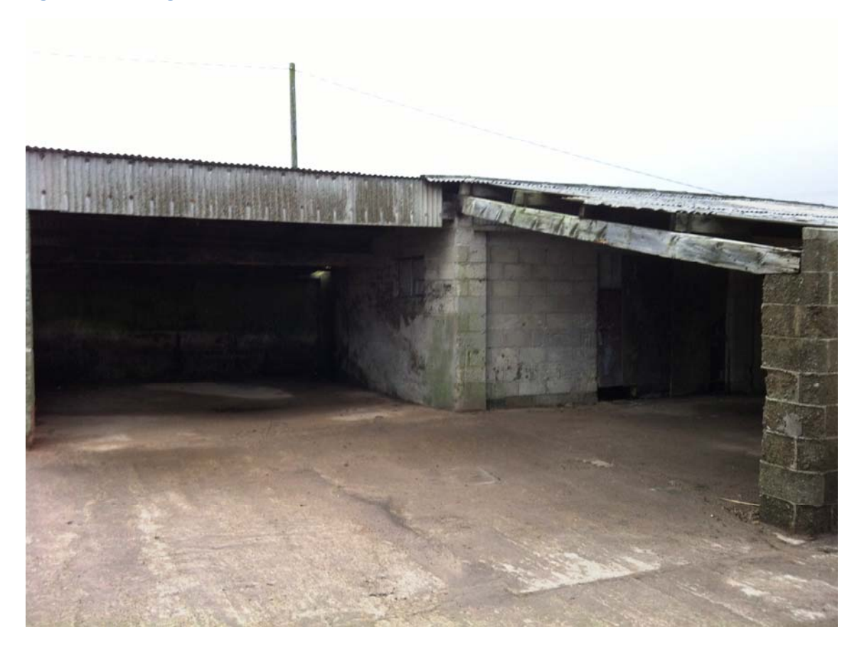
Figure 14 (Building 3) View from South East