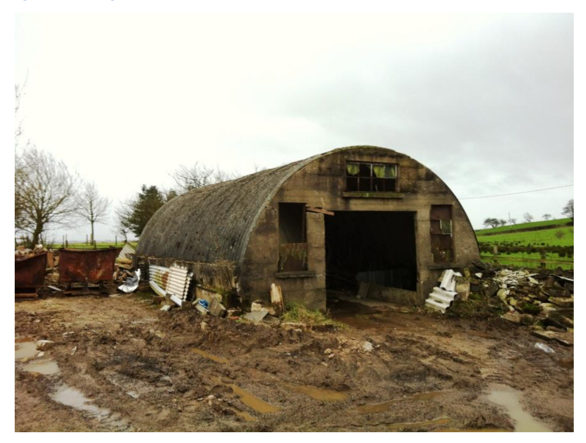
Figure 18 (Building 6) View from North