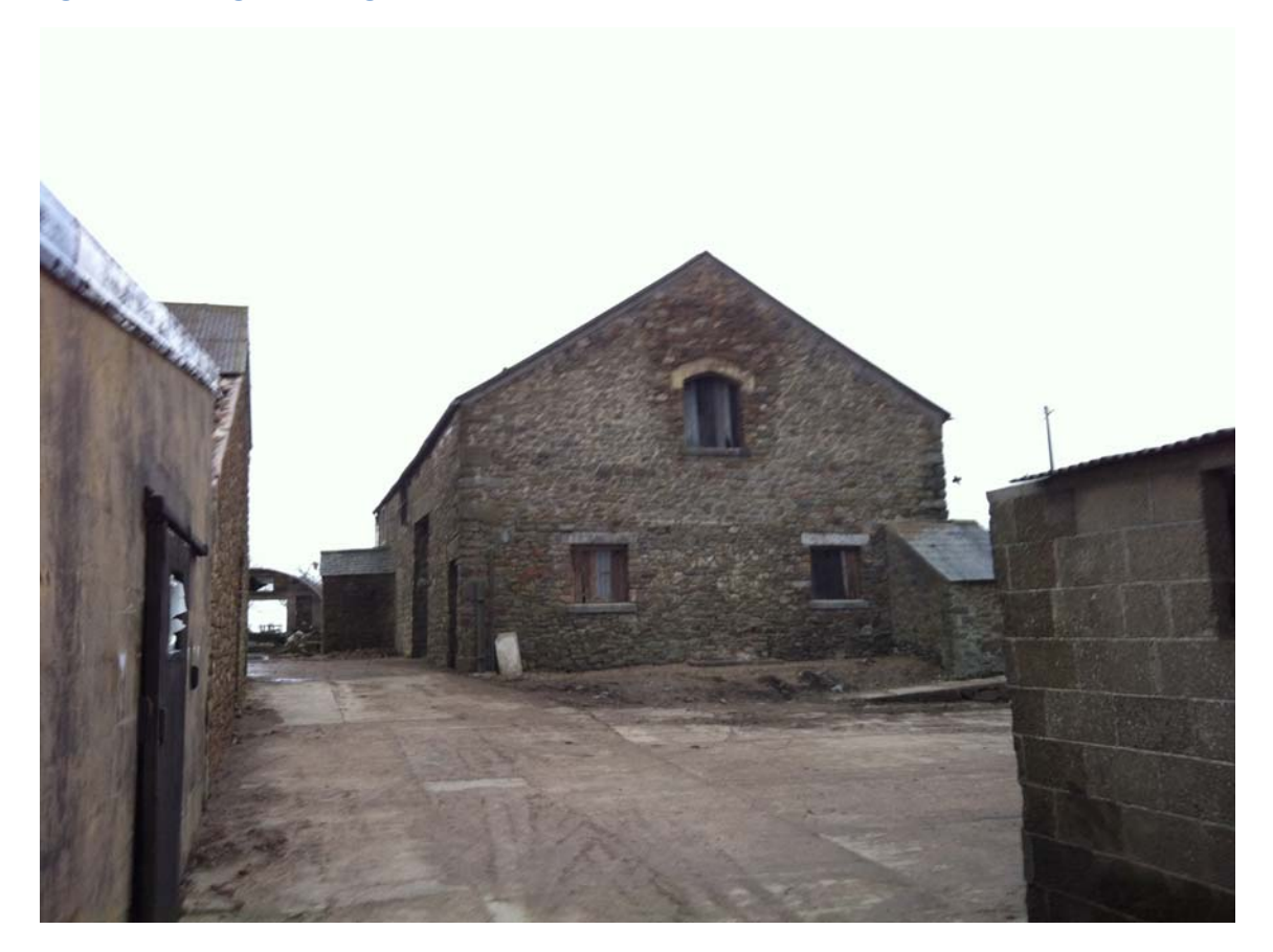
Figure 4 (Building 1) View from North