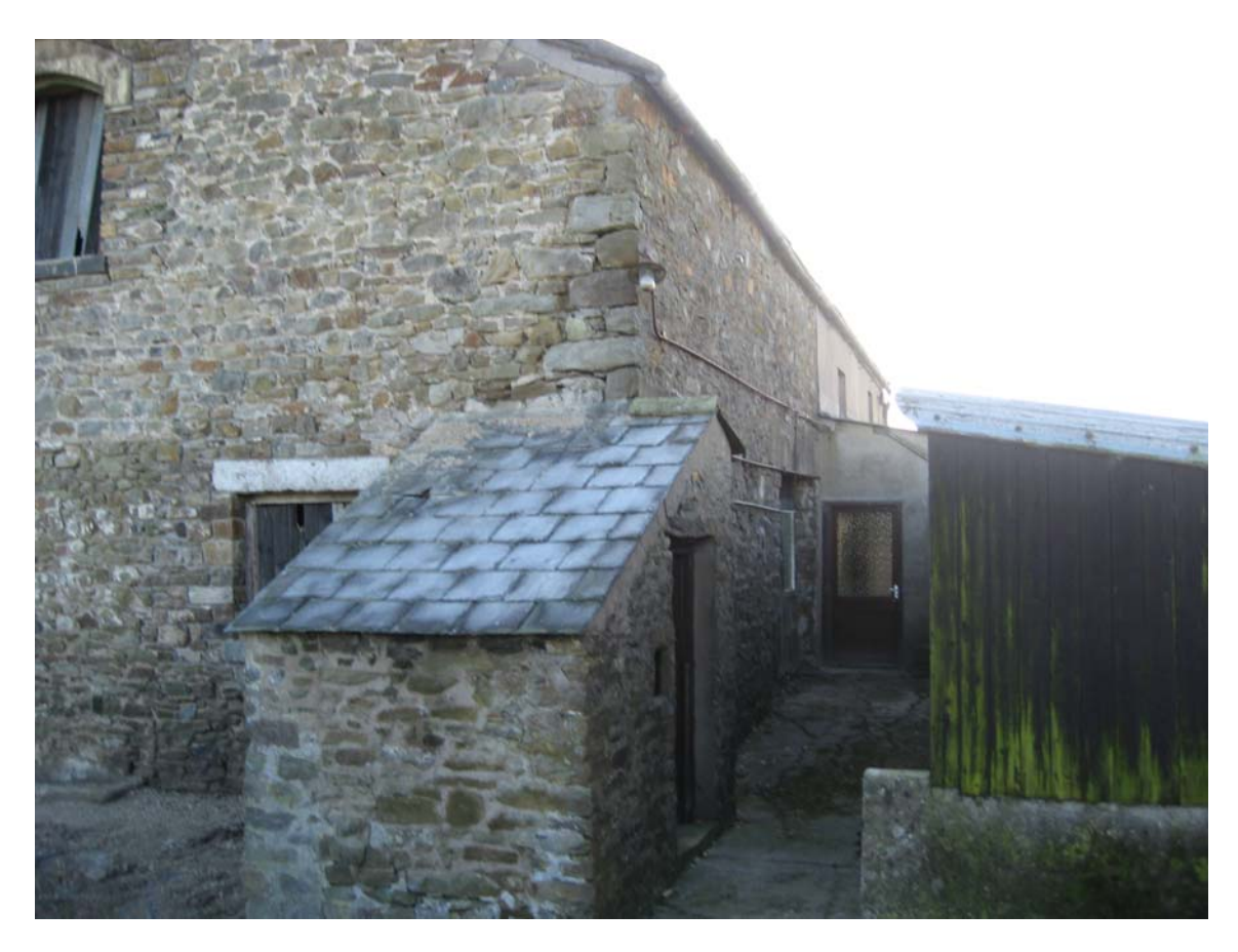
Figure 5 (Building 1, Building 8 to right) View from North West down passage