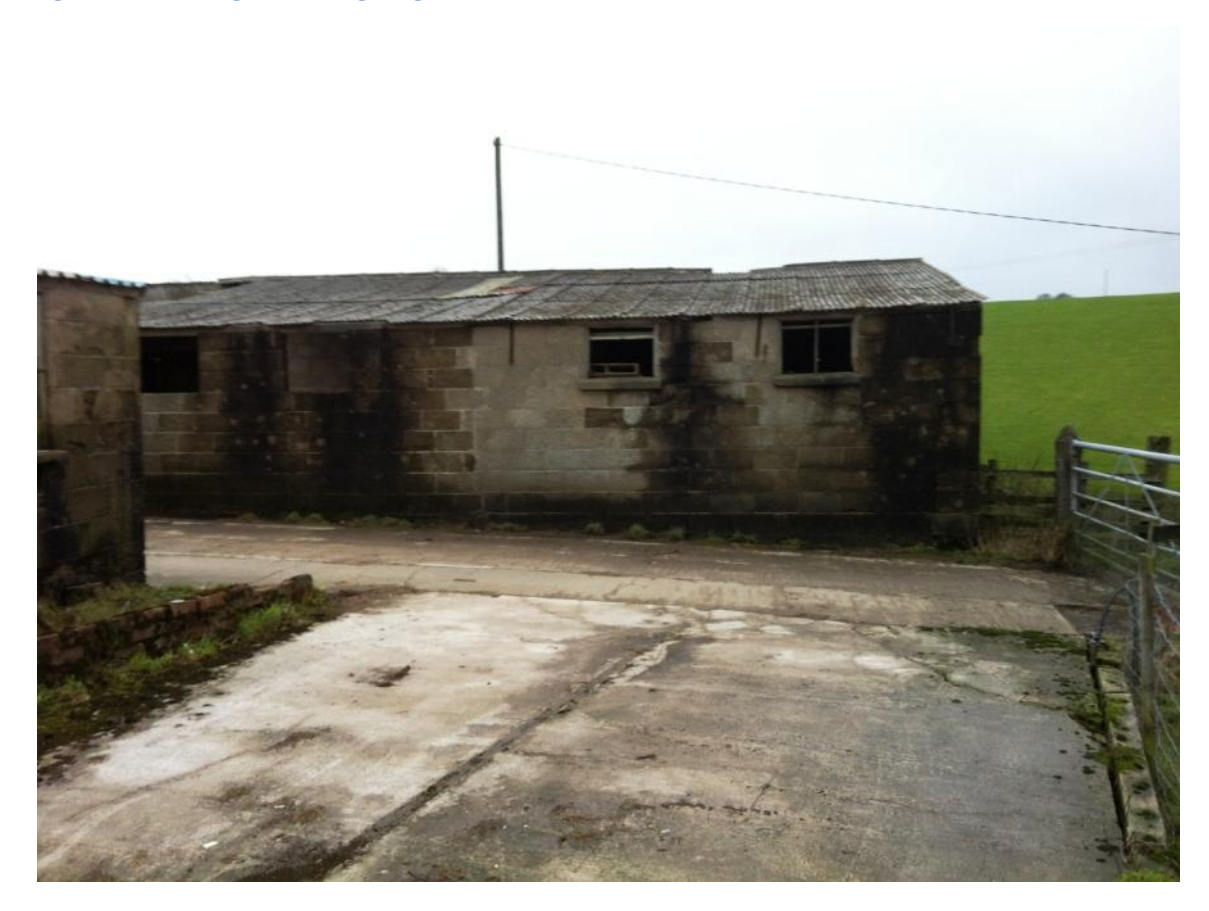
Figure 12 (Building 3) View from East