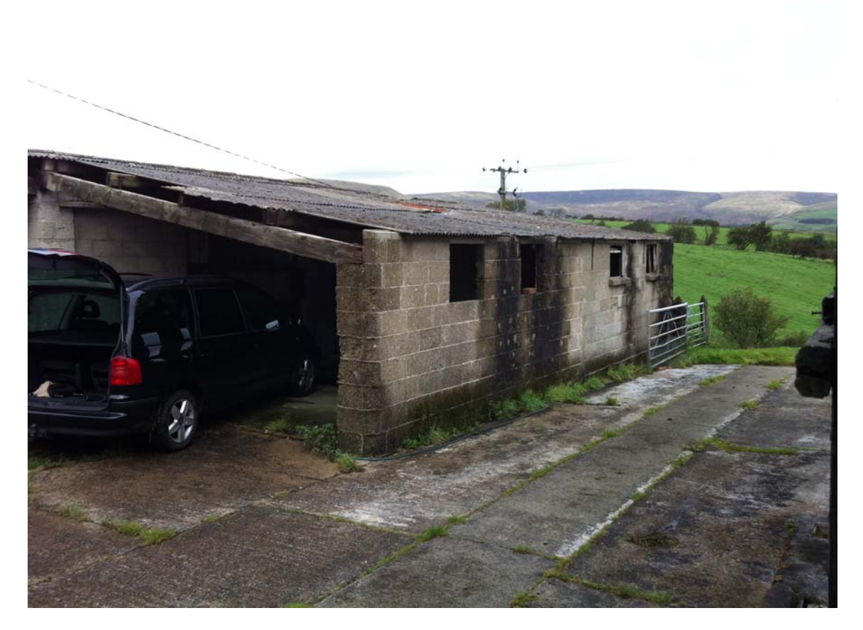
Figure 13 (Building 3 View from South East