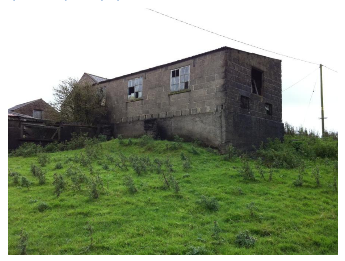
Figure 16 (Building 4) View from North West