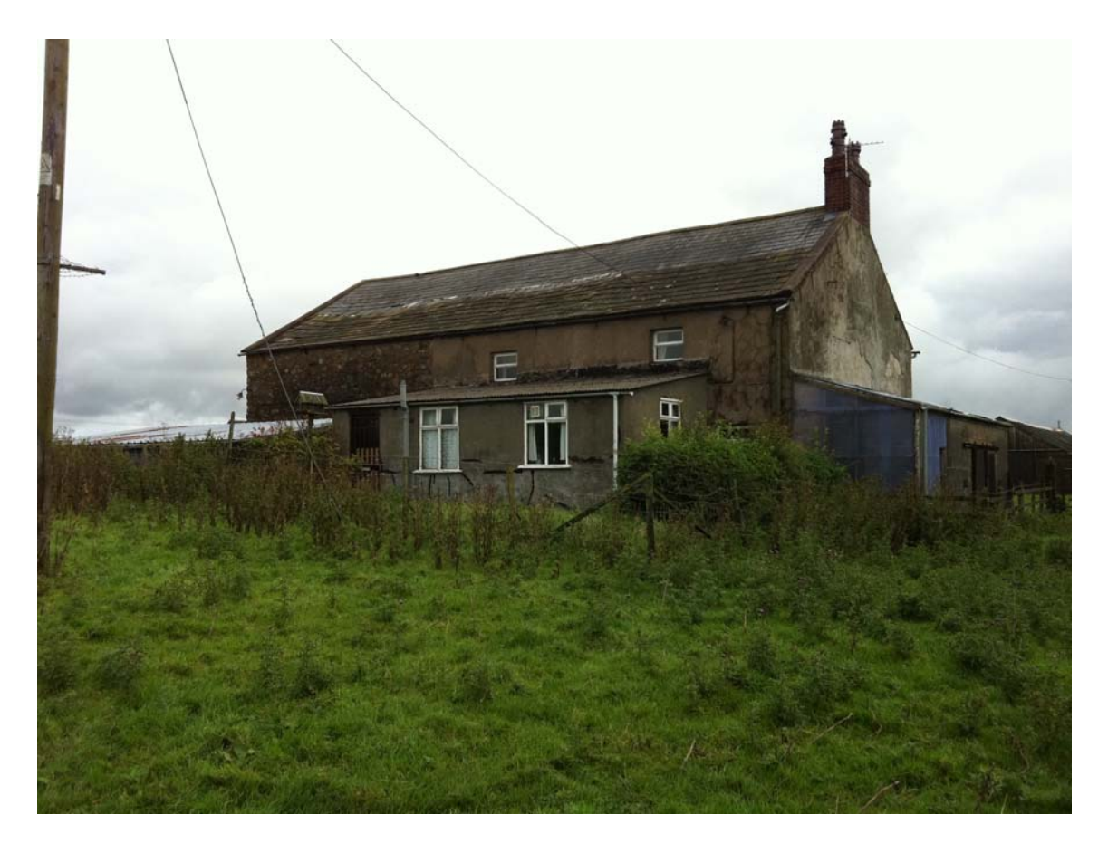
Figure 3 (Building 1, Building 7) View from South West