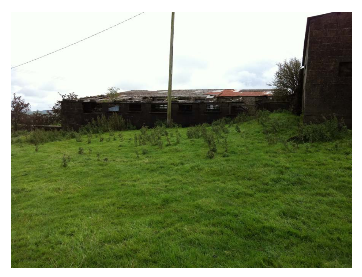
Figure 11 (Building 3, Building 4 right) View from West