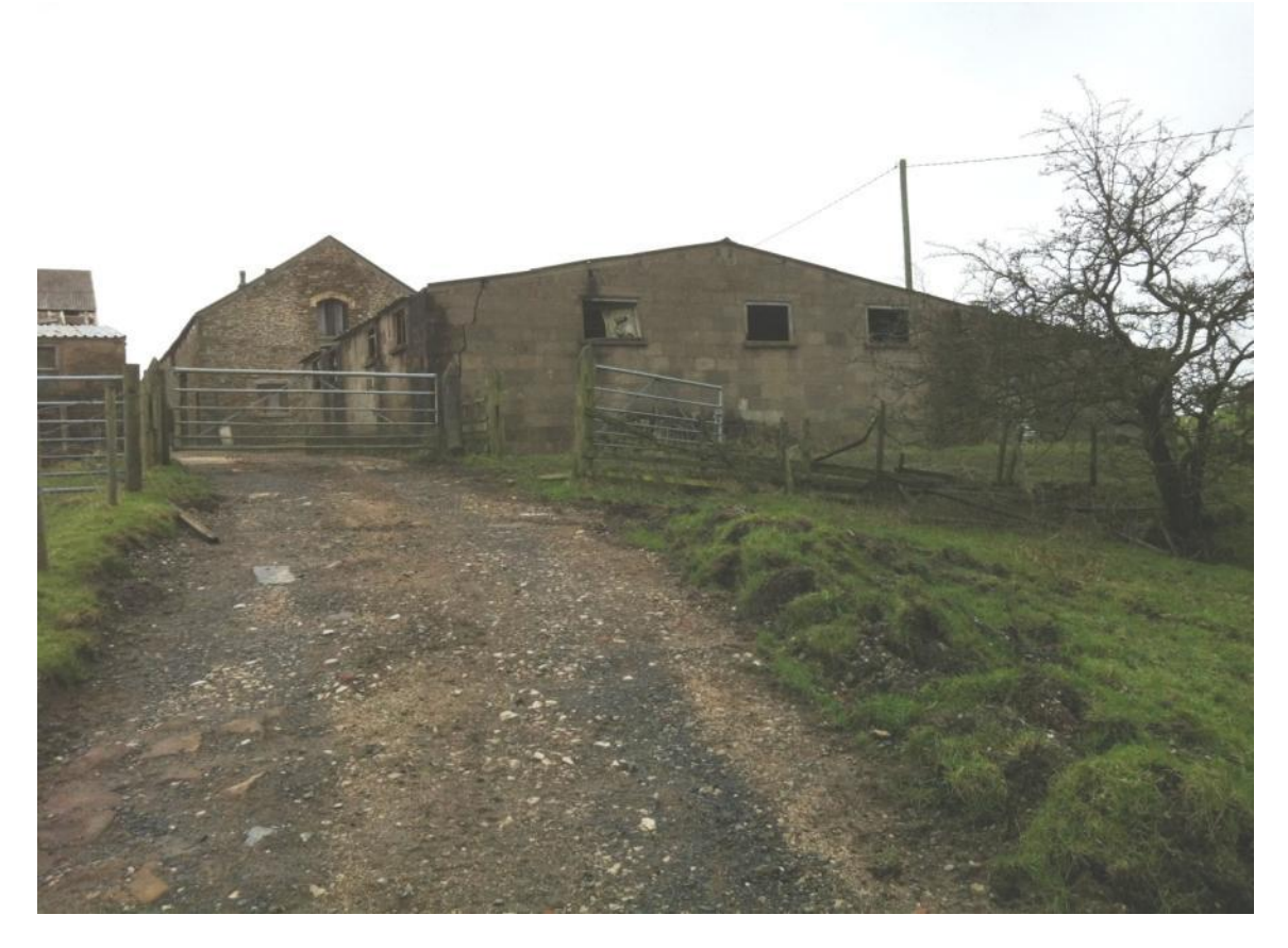
Figure 10 (Building 3) View from North. Existing access track in foreground