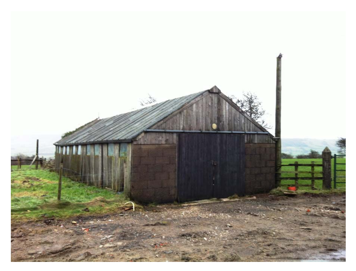
Figure 17 (Building 5) View from North West