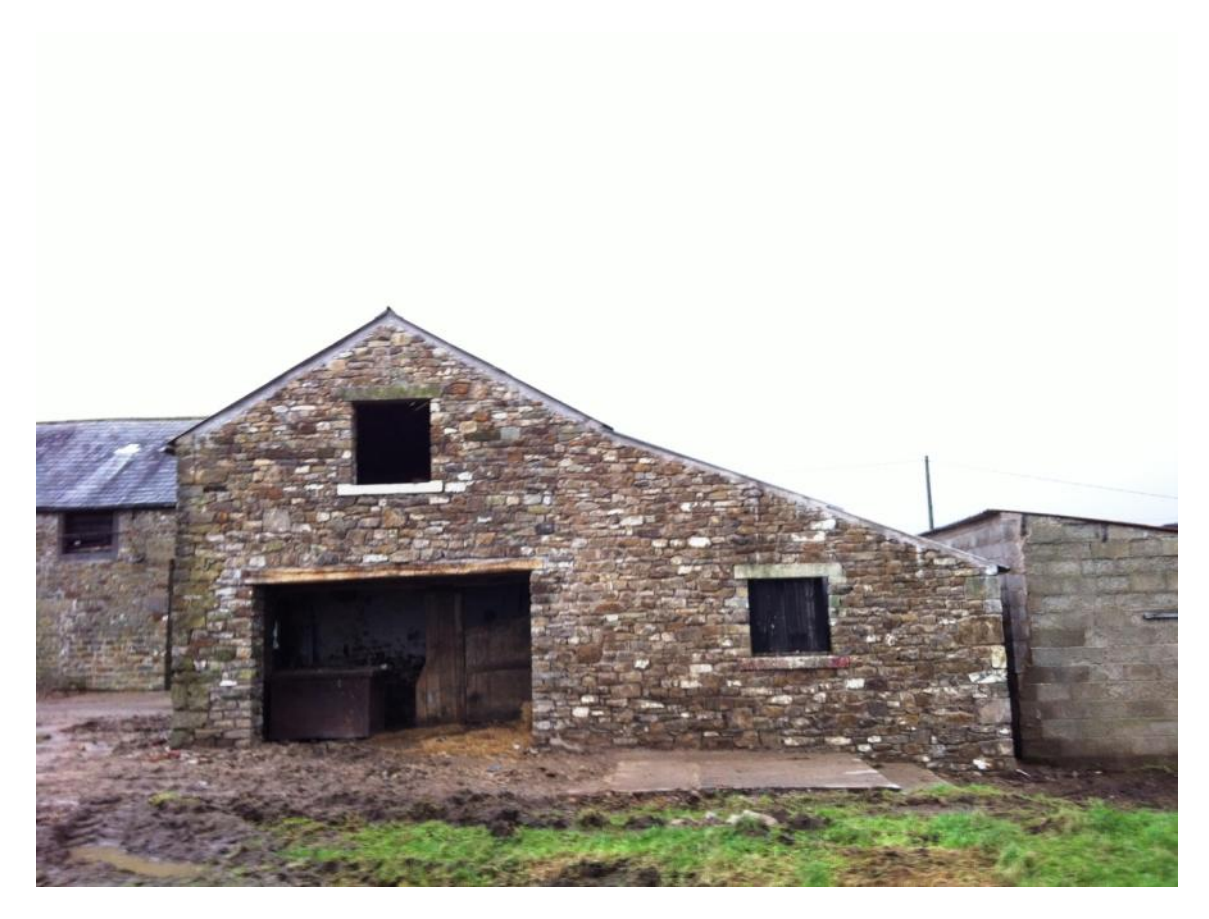
Figure 7 (Building 2, Building 9 to right, Building 1 in background left) View from East