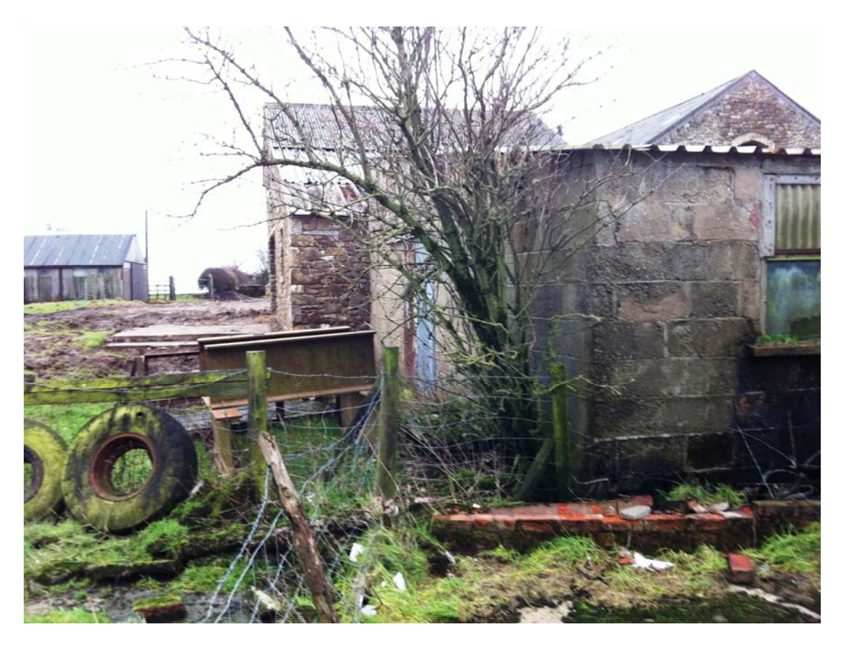
Figure 9 (Building 9, Building 2 behind Building 5 background left) View from North