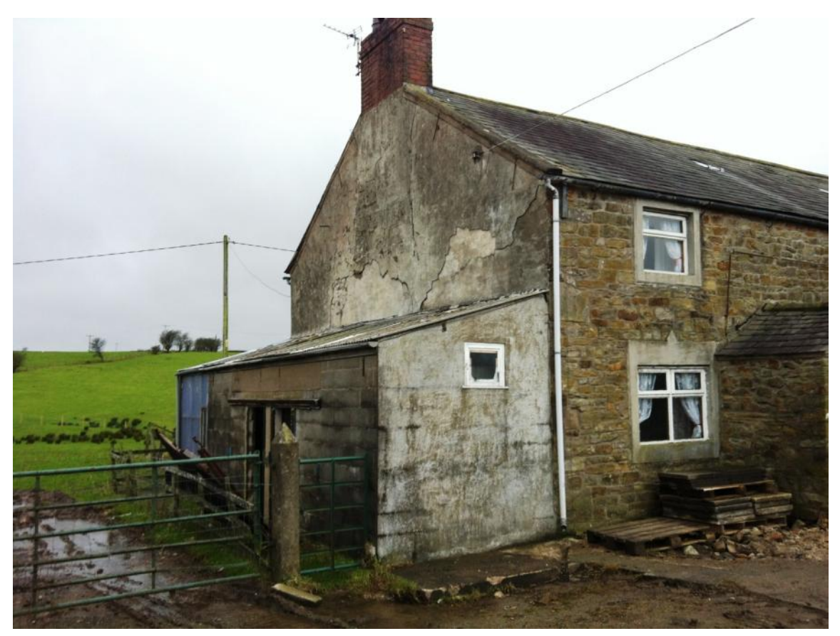
Figure 2 (Building 1) House South East Corner