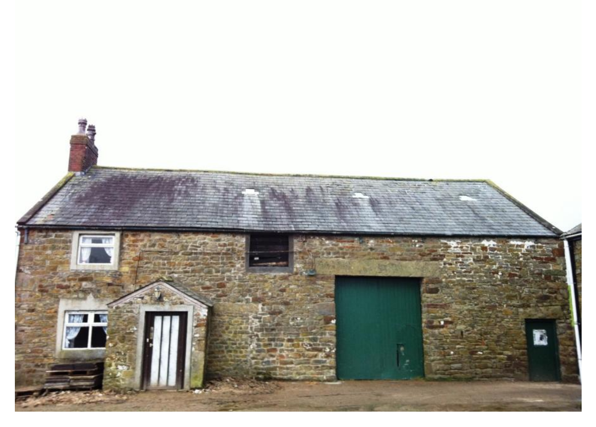
Figure 1 (Building 1) House and attached barn East Elevation