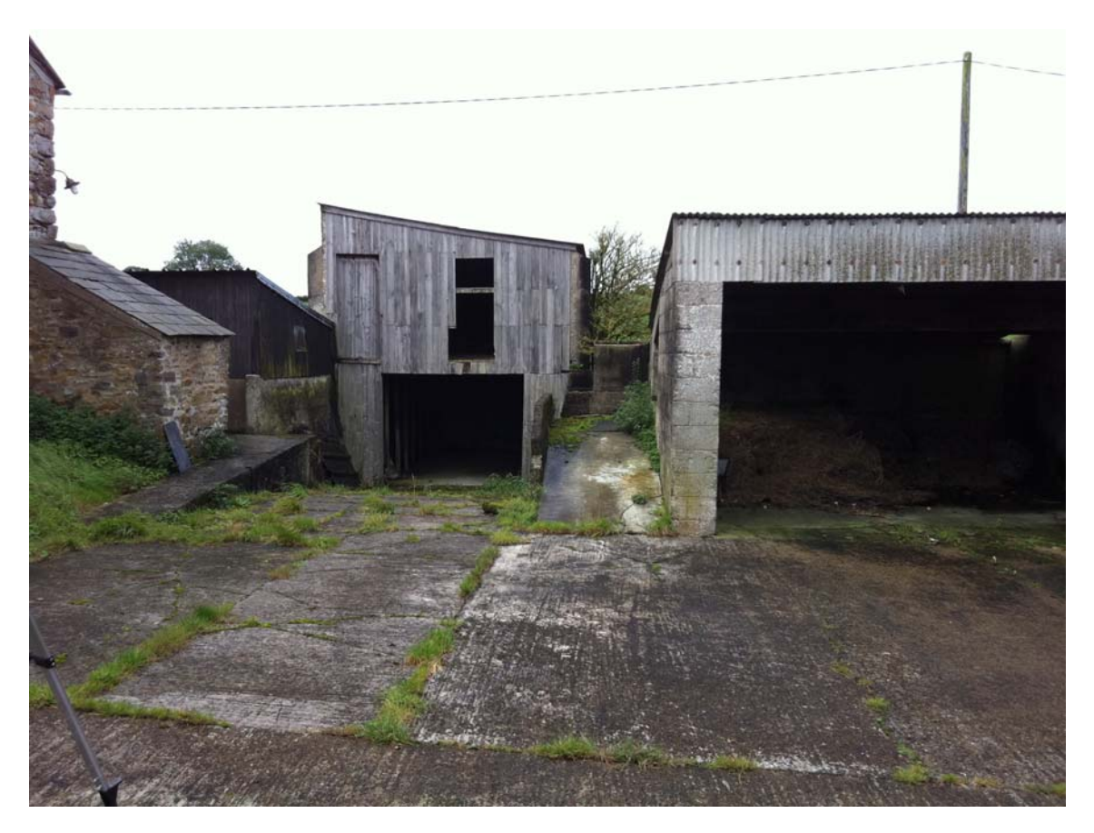
Figure 15 (Building 4, Building 3 right and 1 left) View from East