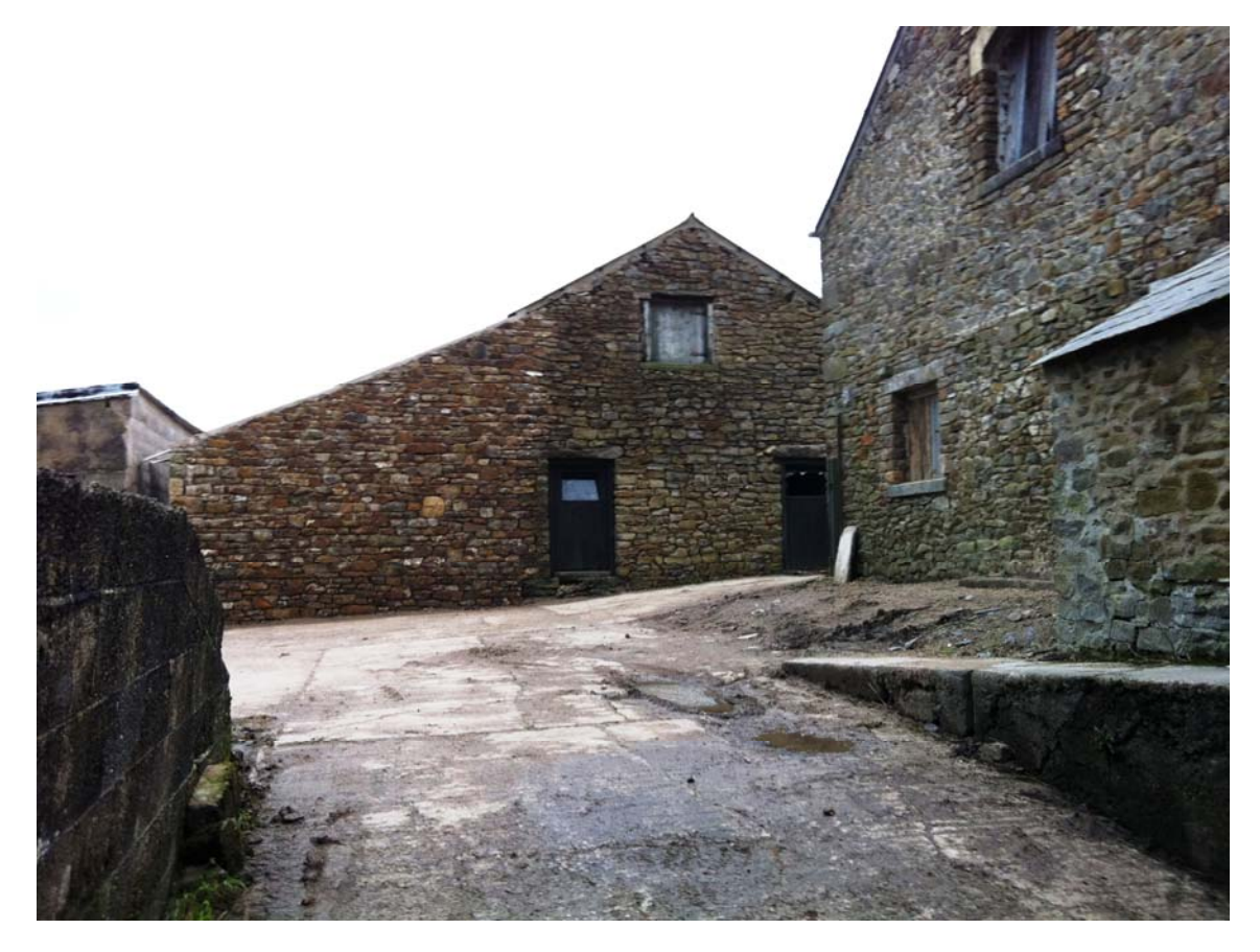
Figure 8 (Building 2, Building 1 right) View from West