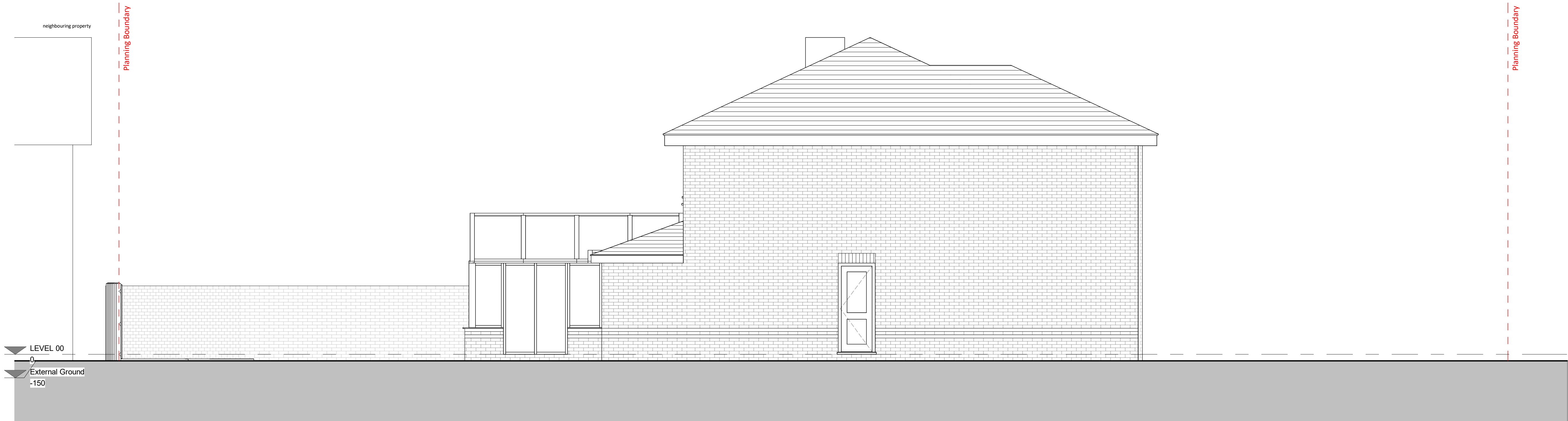
Side Elevation B - EXISTING