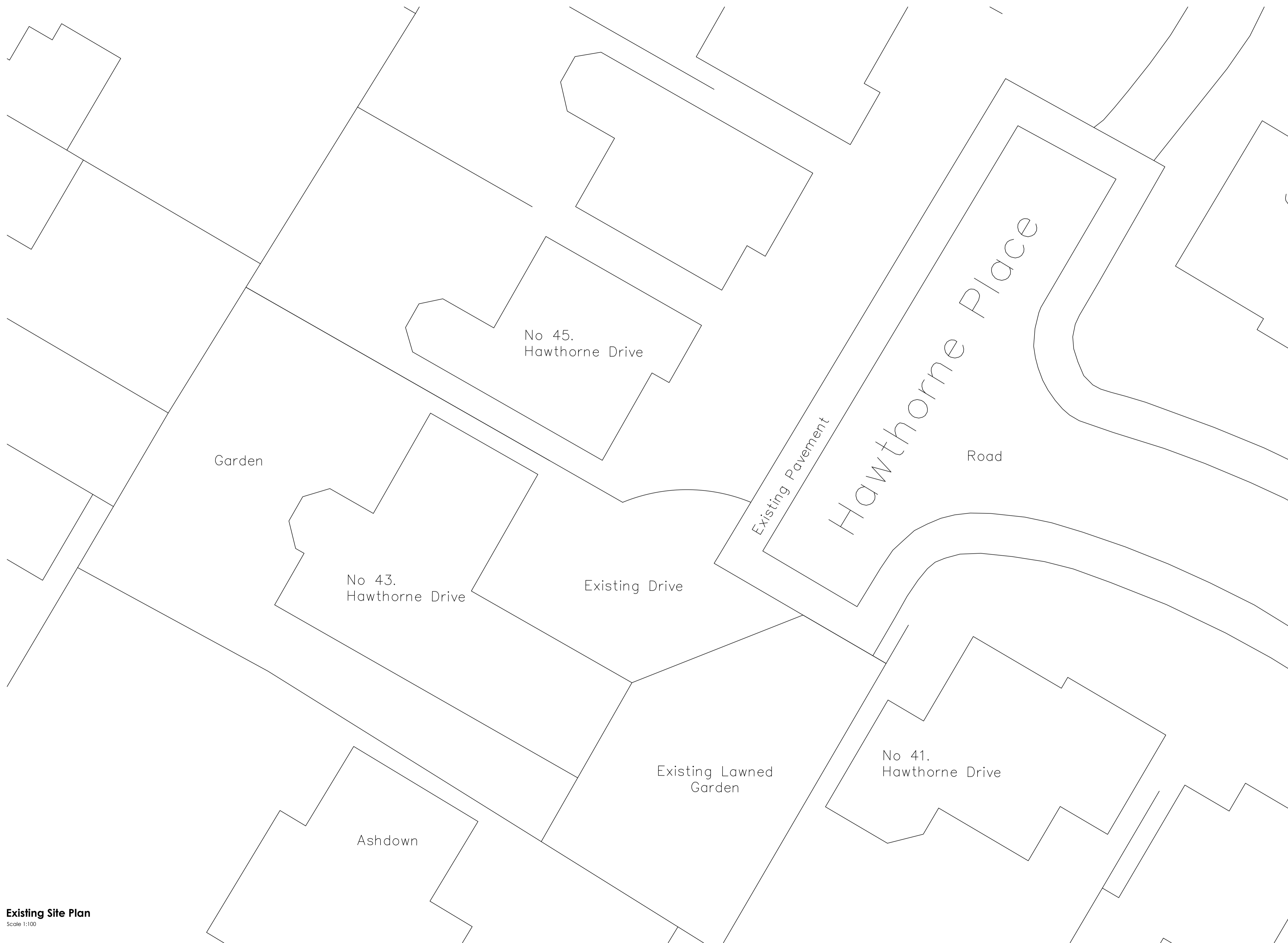
Existing Site Plan Scale 1:100