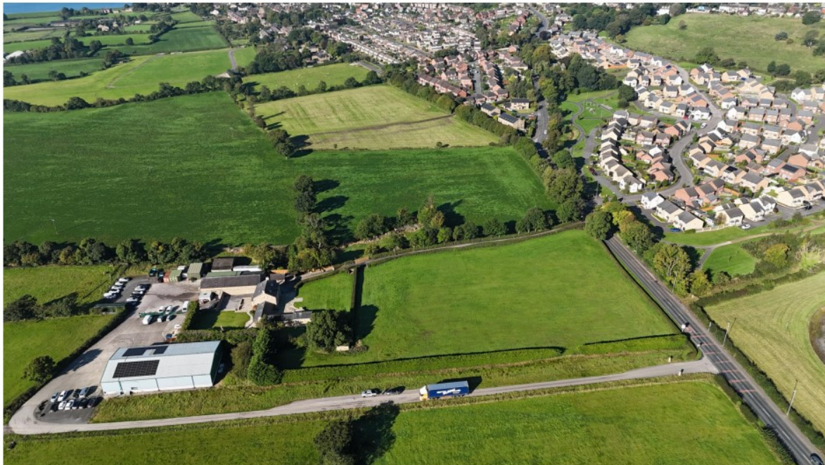
Aerial image showing the wider site context, including HGV layby, Cleggs Cheese Factory, the butcher's, and the adjacent residential estate.