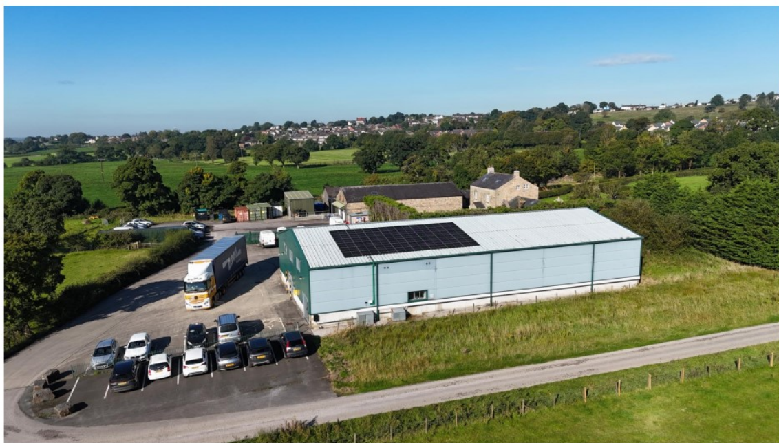
Closer image of Clegg's Cheese Factory, Higher College Farmhouse in far view.