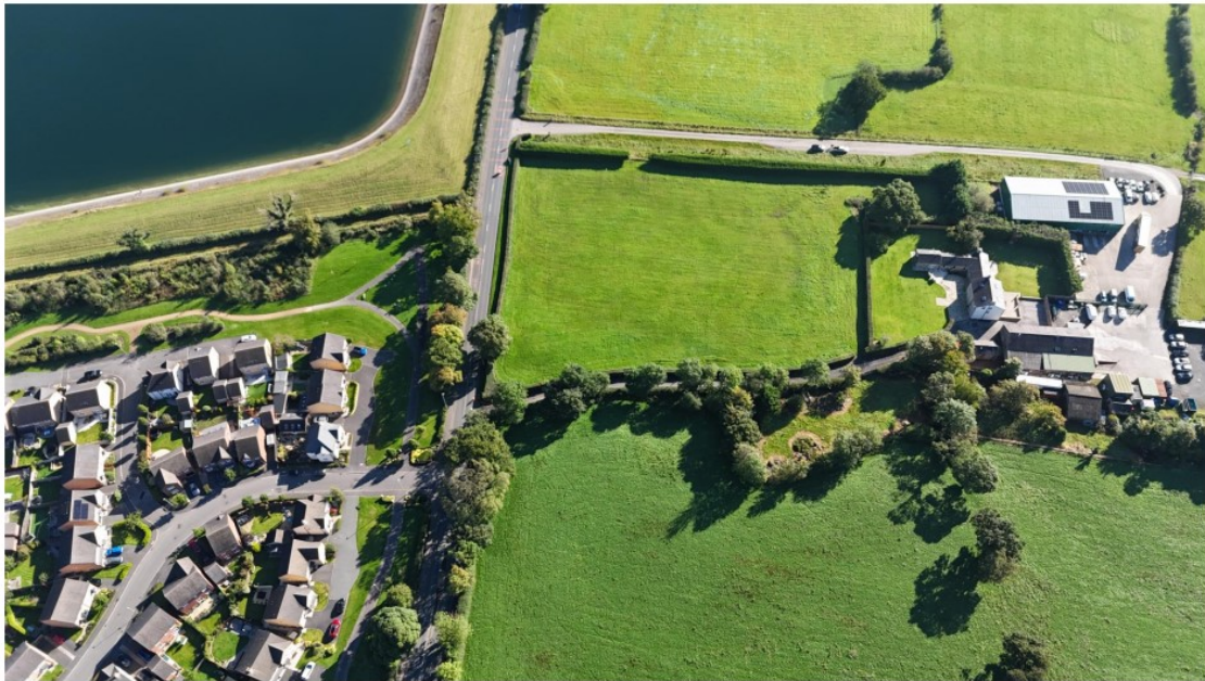
Image of the site and the adjacent residential estate and surrounding uses.