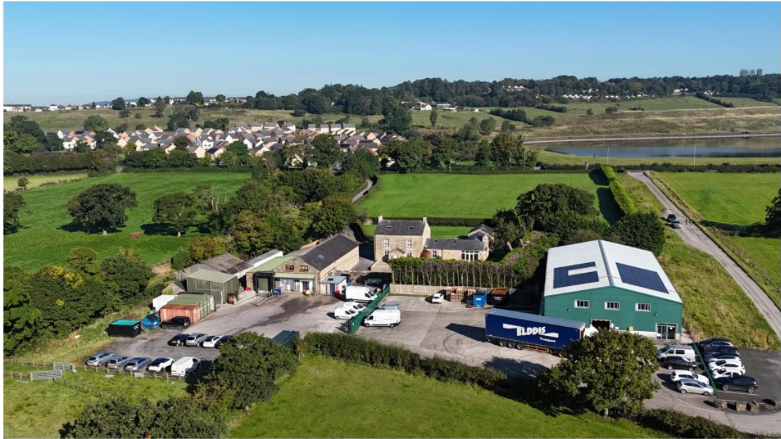
Image of the site and wider context, taken from the south looking due north.