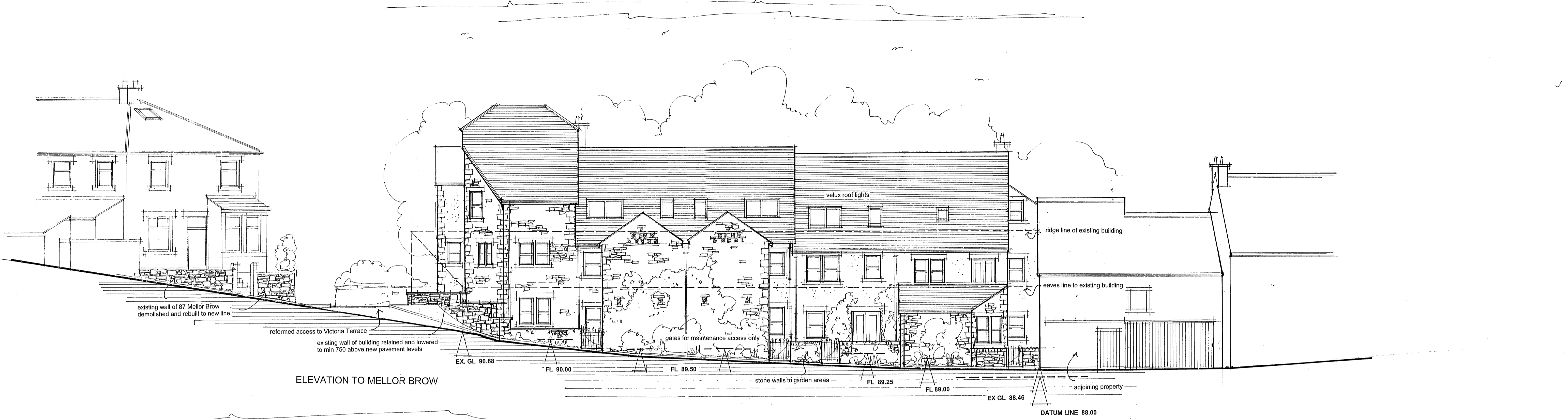
ELEVATION TO MELLOR BROW