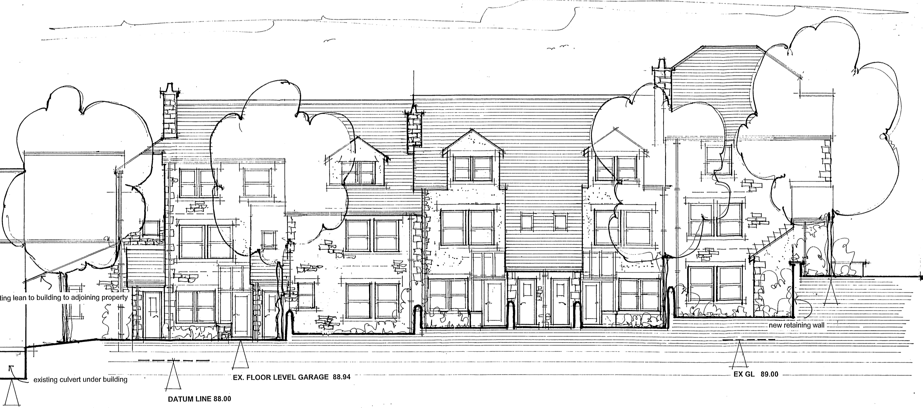
ELEVATION TO REAR