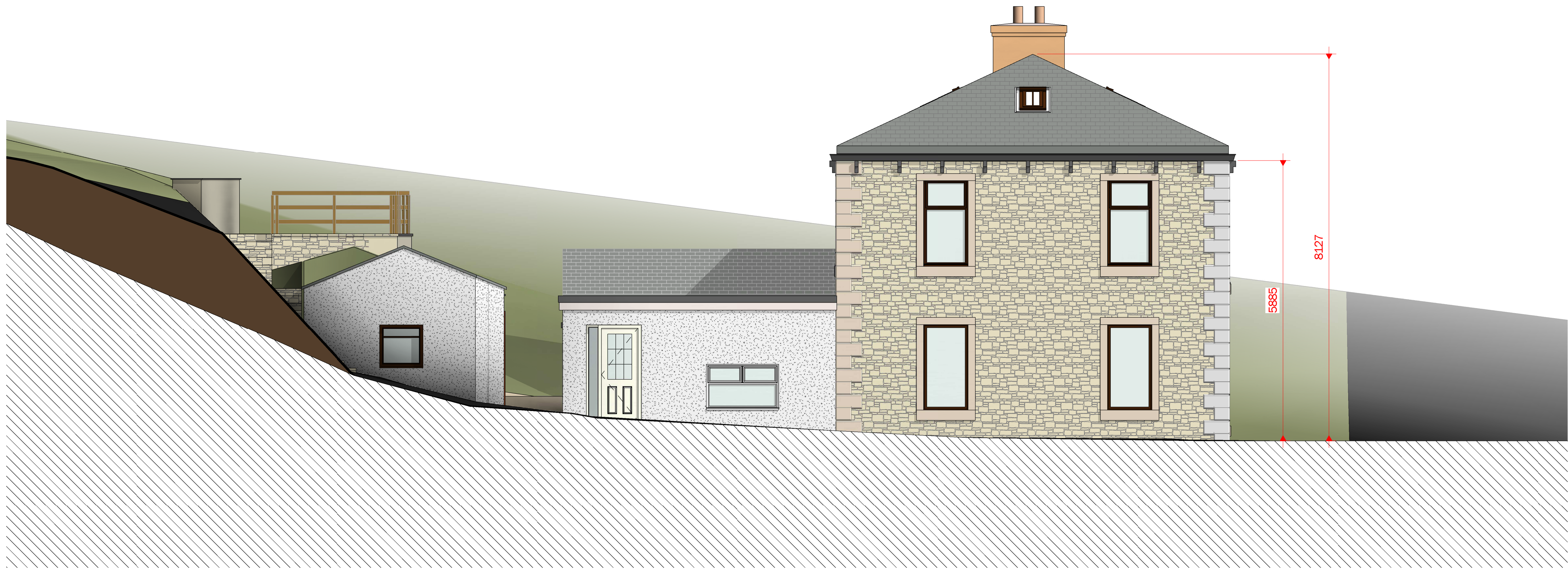
4 PROPOSED EAST 1 : 50