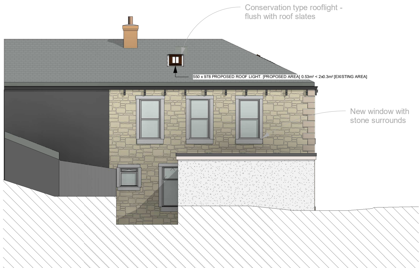
2 PROPOSED SOUTH 1 : 100