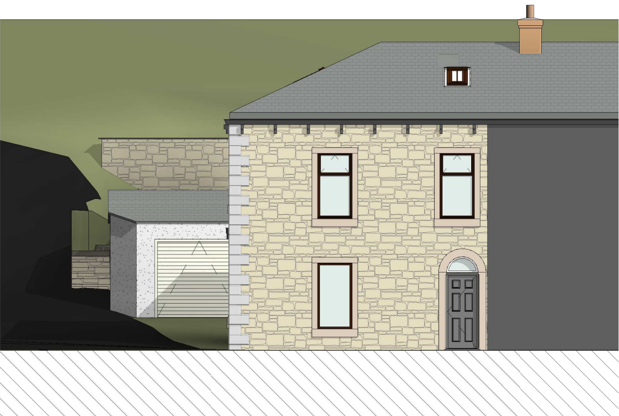
1 PROPOSED NORTH 1 : 100