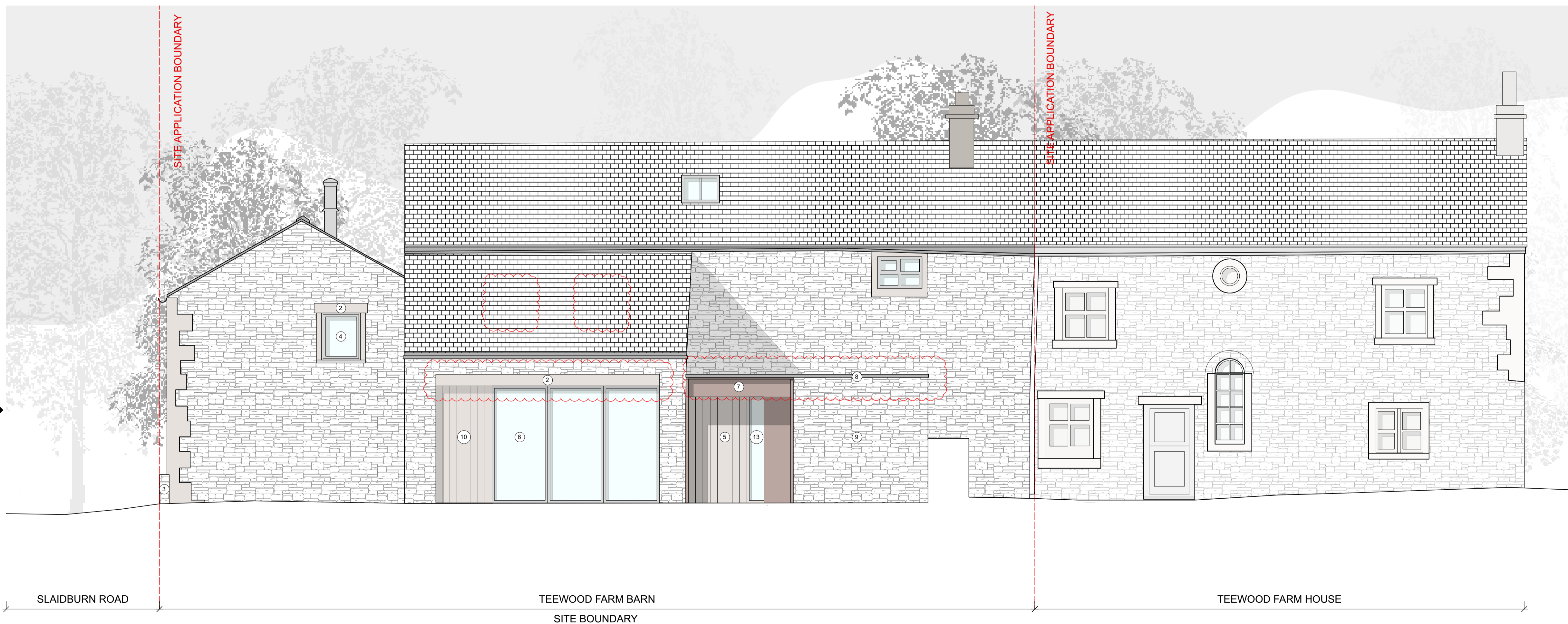
2 Proposed North Elevation Scale: 1:50