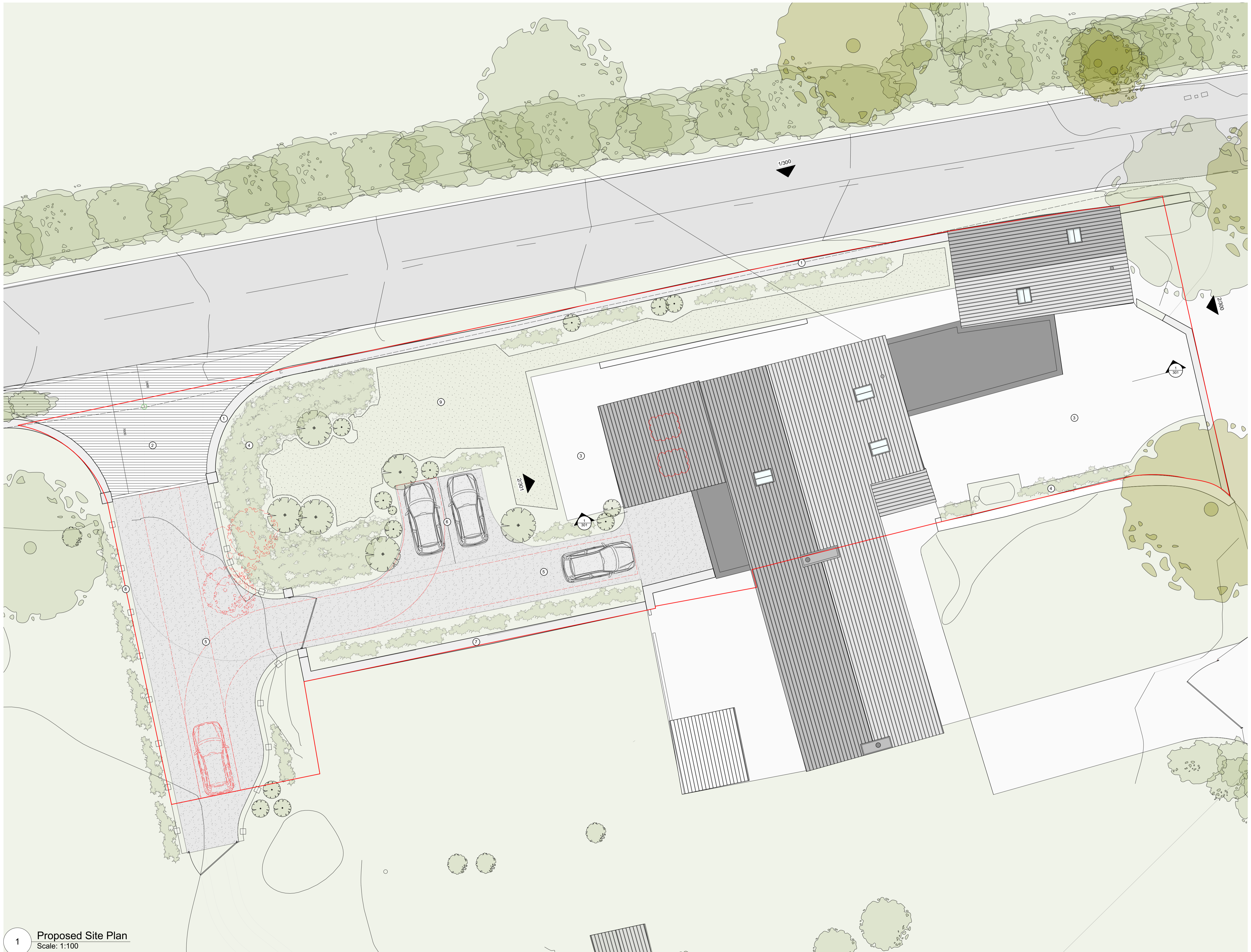
1 Proposed Site Plan Scale: 1:100