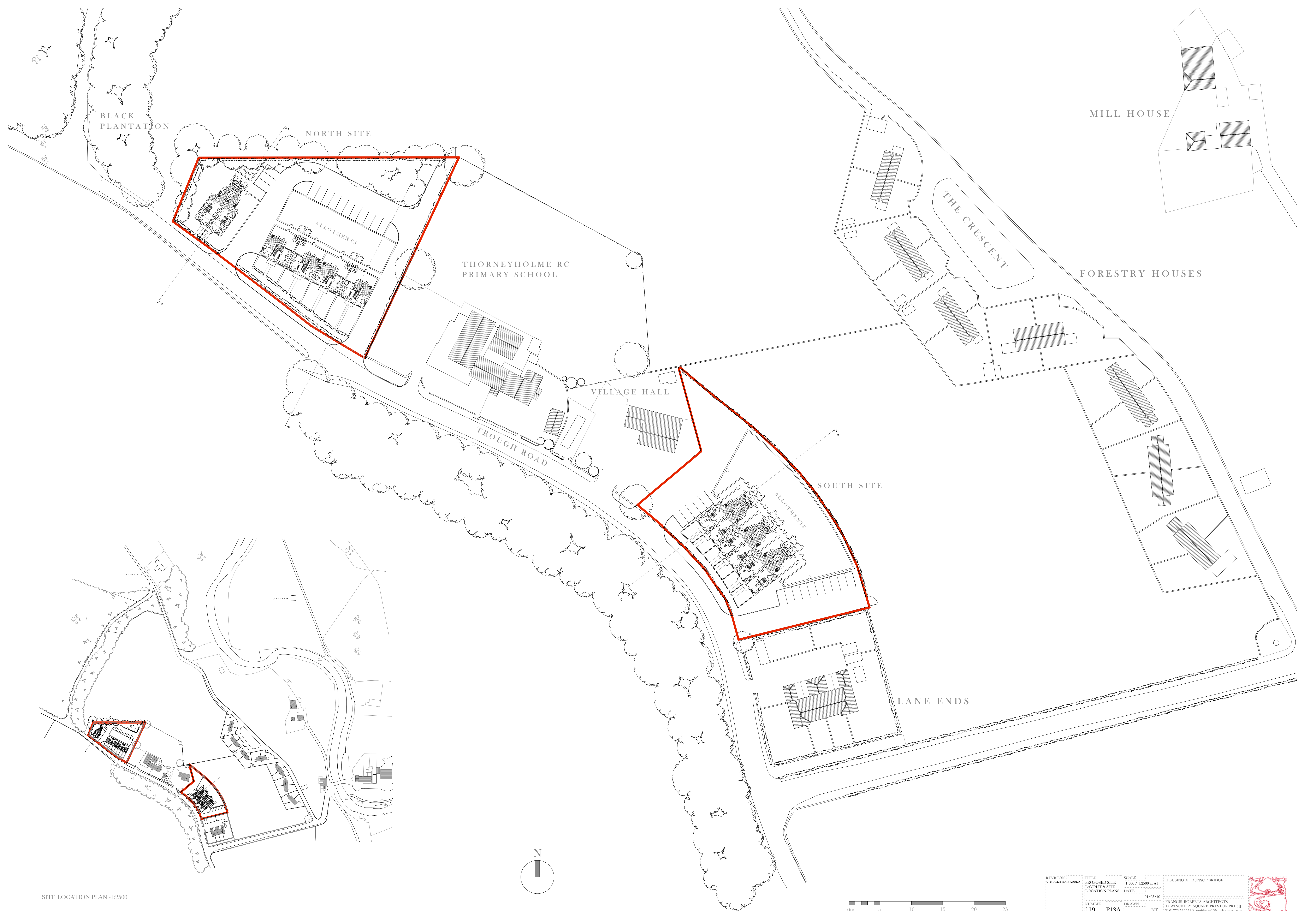
SITE LOCATION PLAN -1:2500