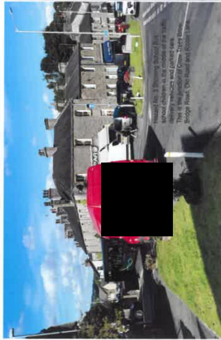
Hazard No. 3 Showing school play area children in the middle of the road. Heavy vehicles and parked cars. This is the position of Crow-Trees Brook. Brooge Road, Old Road and Pimlico Lane.