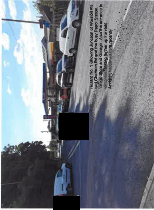
Hazard No. 1 Showing Junction of Worship Rd, Chalfont Rd and the busy Payrol Station. Also the entrance to the Garage. Also the entrance to the trading estate. Accident happened in this proximity.