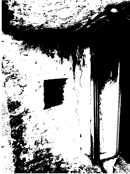
Minor Cracking between stairs and rear wall