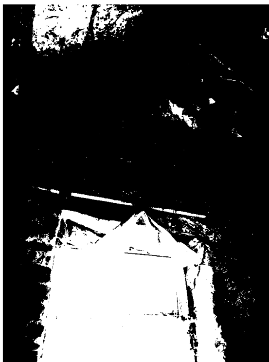
Internal Gable Wall

The gable wall cracking is directly below the bearing points of the purlins and lintels over the window has failed.