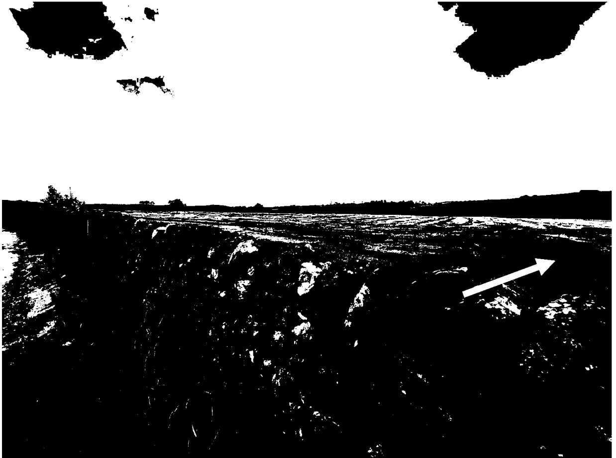
Fig. 2 Proposed site photo