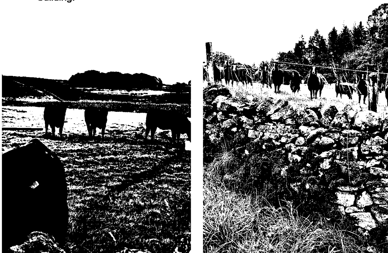
Fig. 3 Aberdeen Angus Cattle & Zwartable Gimmers

2.2 The farm also stocks 12 Zwartable gimmer lambs which will go to the tup in November and will lamb the following April. Supplementary feeding these sheep outside can cause damage to the land during wet conditions. By housing the ewes in January, February and March the diet can be managed better, and the land is also rested in readiness for spring growth. There is also a requirement for indoor housing for these sheep in lambing time. Indoor lambing can offer a heightened level of surveillance and can offer superior welfare. Once the lambs are born, they can remain in the facility until they are around 48 hours old at which point they will be robust enough to go out onto the pasture. The applicant would also like to increase these numbers once appropriate housing and lambing facilities are created through the erection of the proposed building.