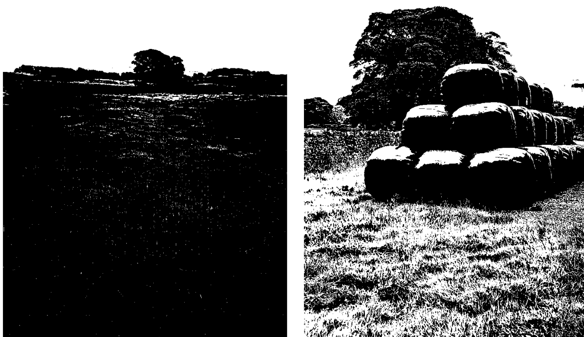
Fig. 4 Land and silage bales made summer 2023

3.2 The current use of the land includes grazing by the cattle and sheep as detailed at 2.1 and 2.2. The holding is made up of pasture used for grazing only and 15 acres of meadow which is cut and made into silage bales. Alongside grazing, the land is managed by mechanical operations including rolling, chain harrowing, fertilising and muck spreading. All of this is done using the applicant's own machinery and implements.