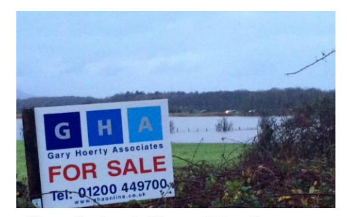
Figure B - Agents Sign and Flooding