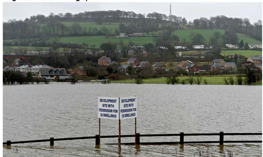
Figure A - 'Viral' Photograph