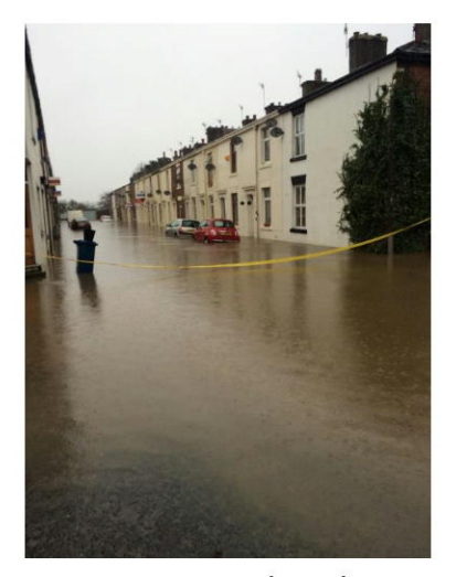
Figure C - Longworth Road