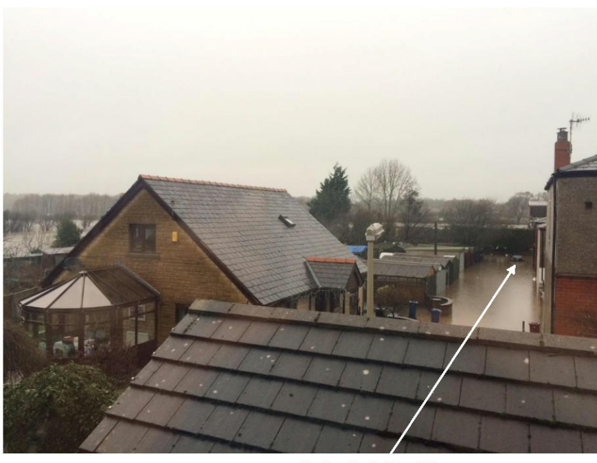
Car Floating in Flood Water