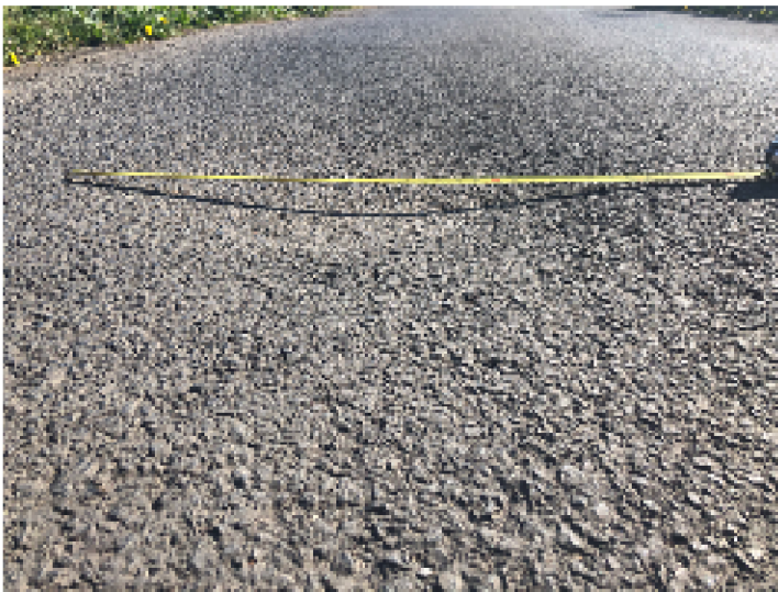
Sink hole developing outside our property [REDACTED]

Attached are some recent photos of some of the issues I have raised in this letter.