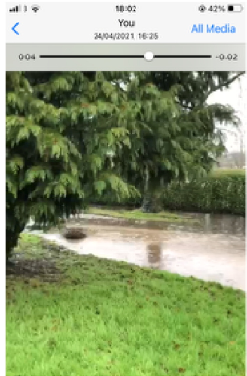
Flooding problem at the start of the track on the smaller Larkhill green.