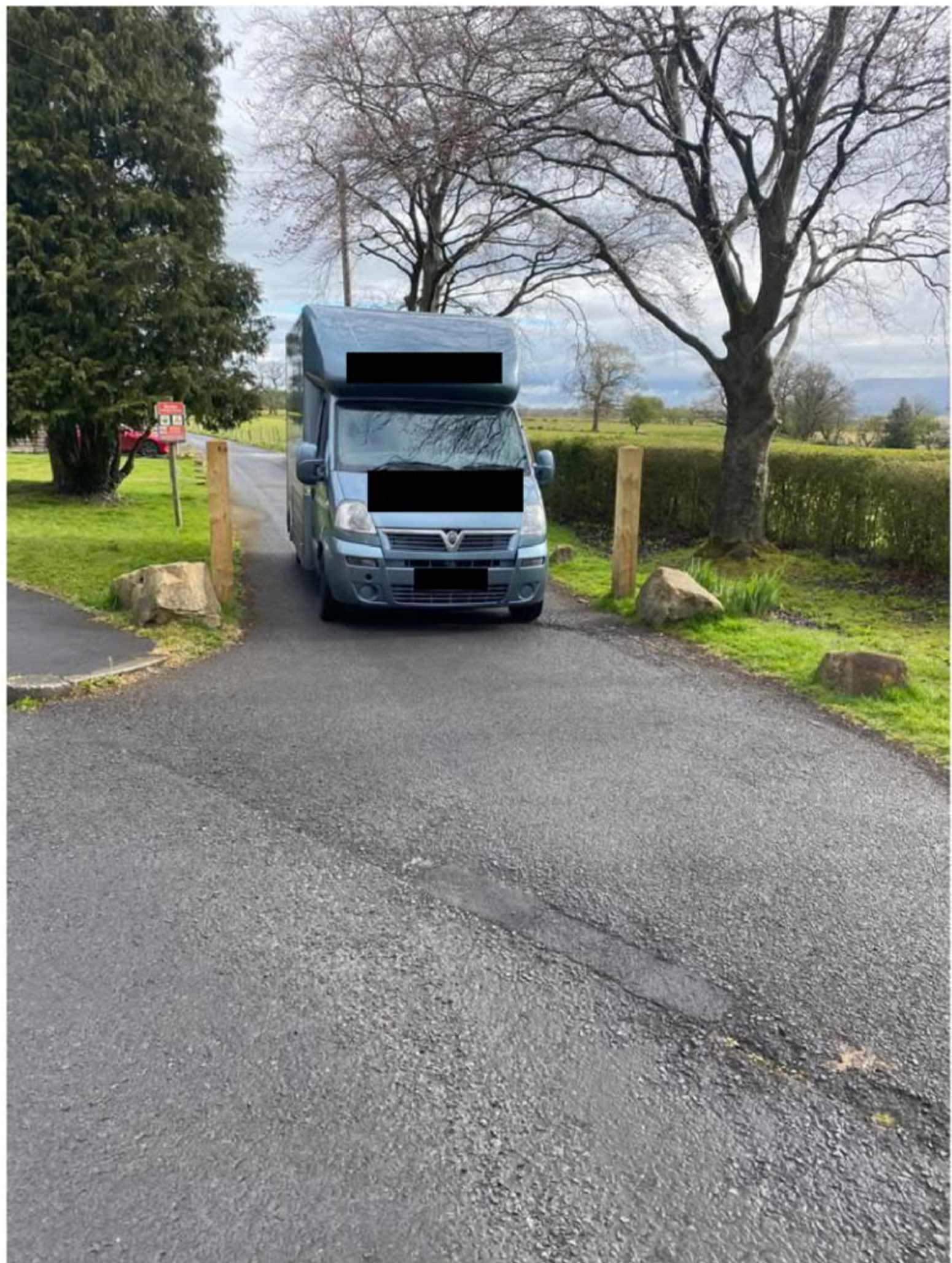
Proposed access - example of insufficient width - Fire Safety concerns