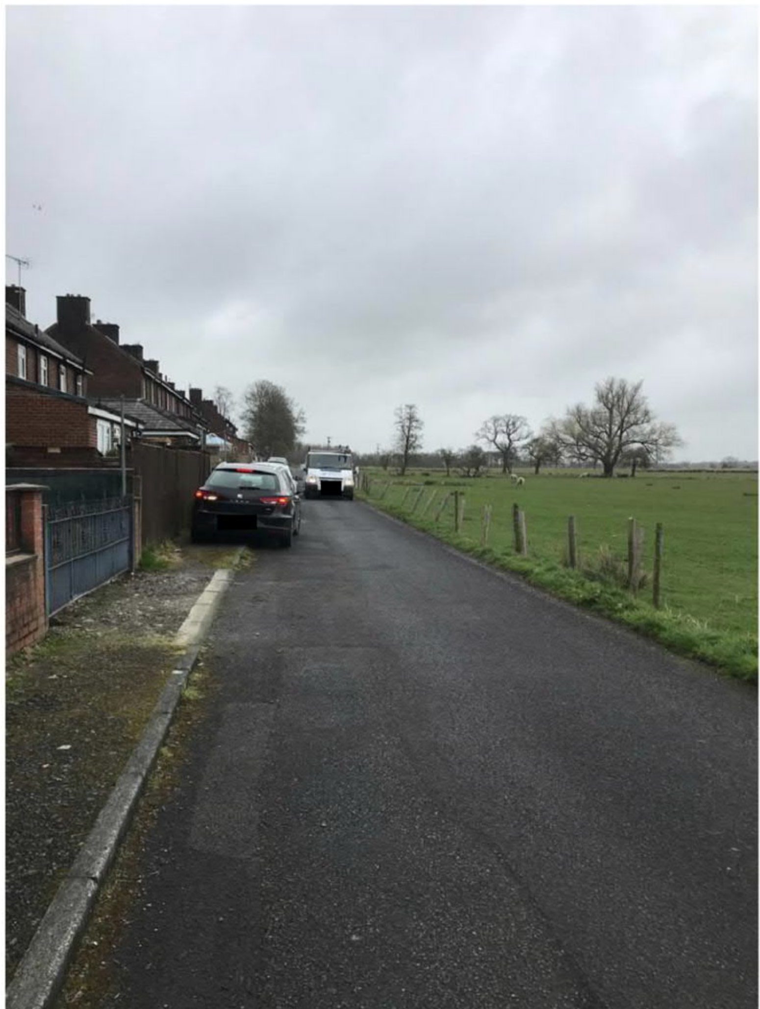
Example of likely clash / no passing places