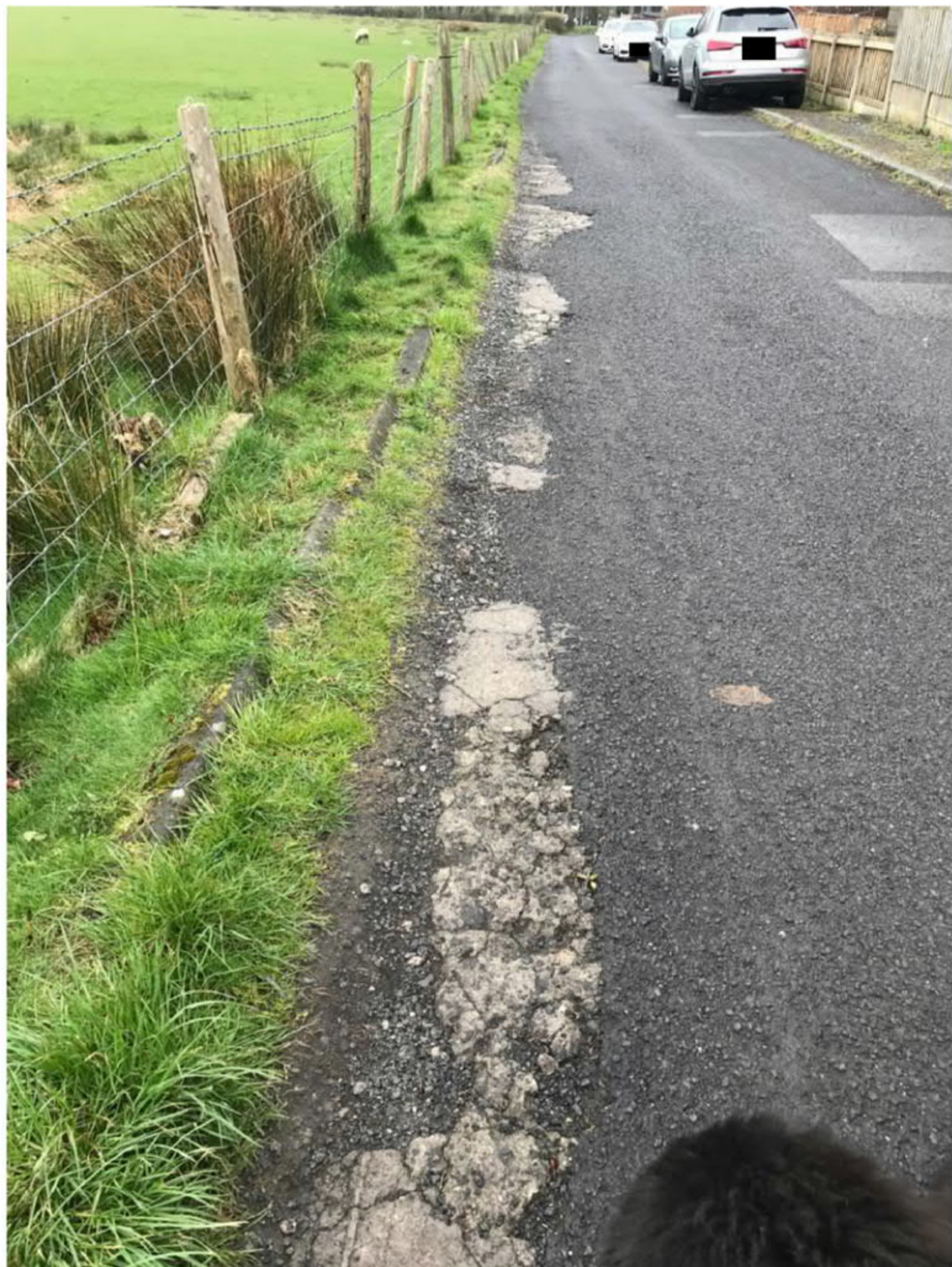
Example of current condition of the lane