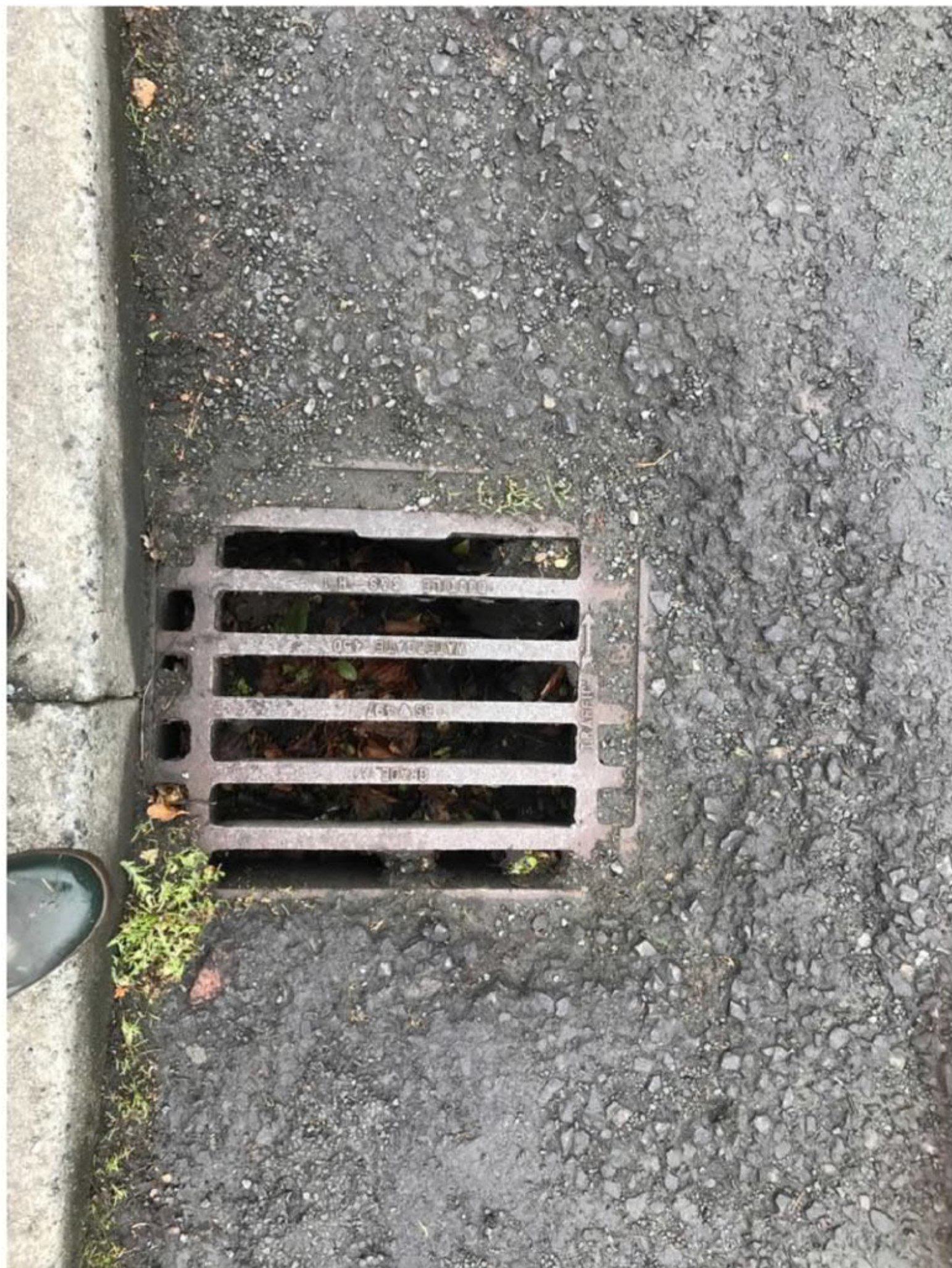
Example of blocked drains