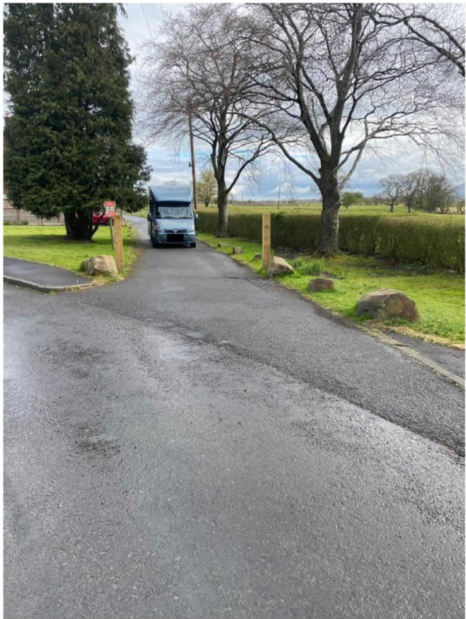
Proposed access - example (2) of insufficient width - Fire Safety concerns