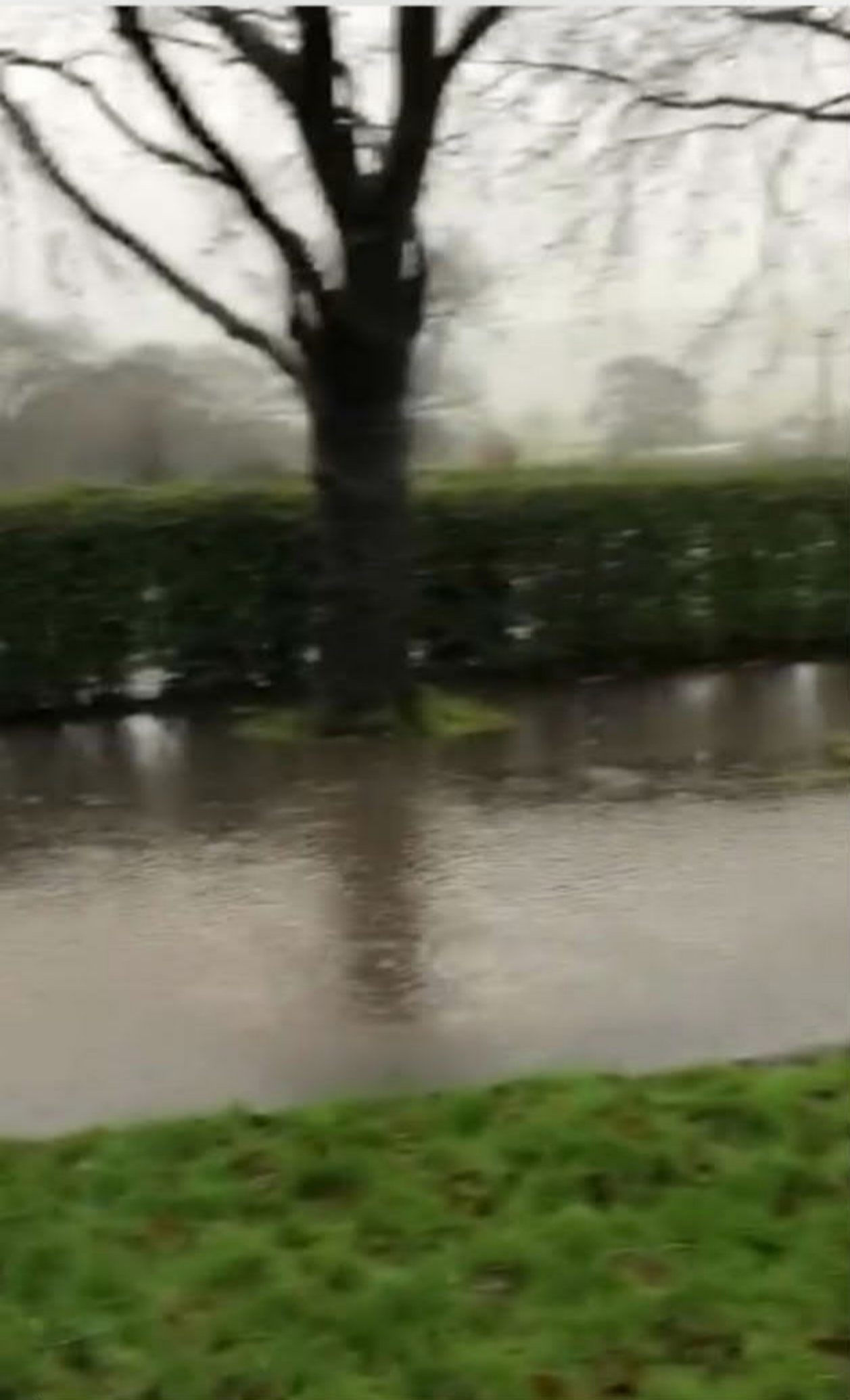
Example of flooding on proposed access (image still taken from video recording)