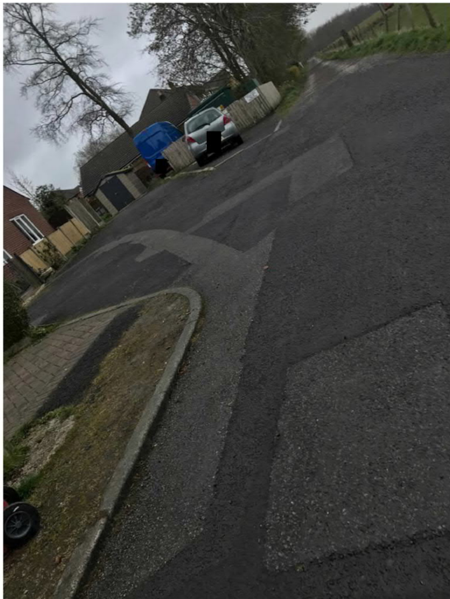
Example 2, area to the rear of No.11 adjacent to No.10 (Larkhill owned land)