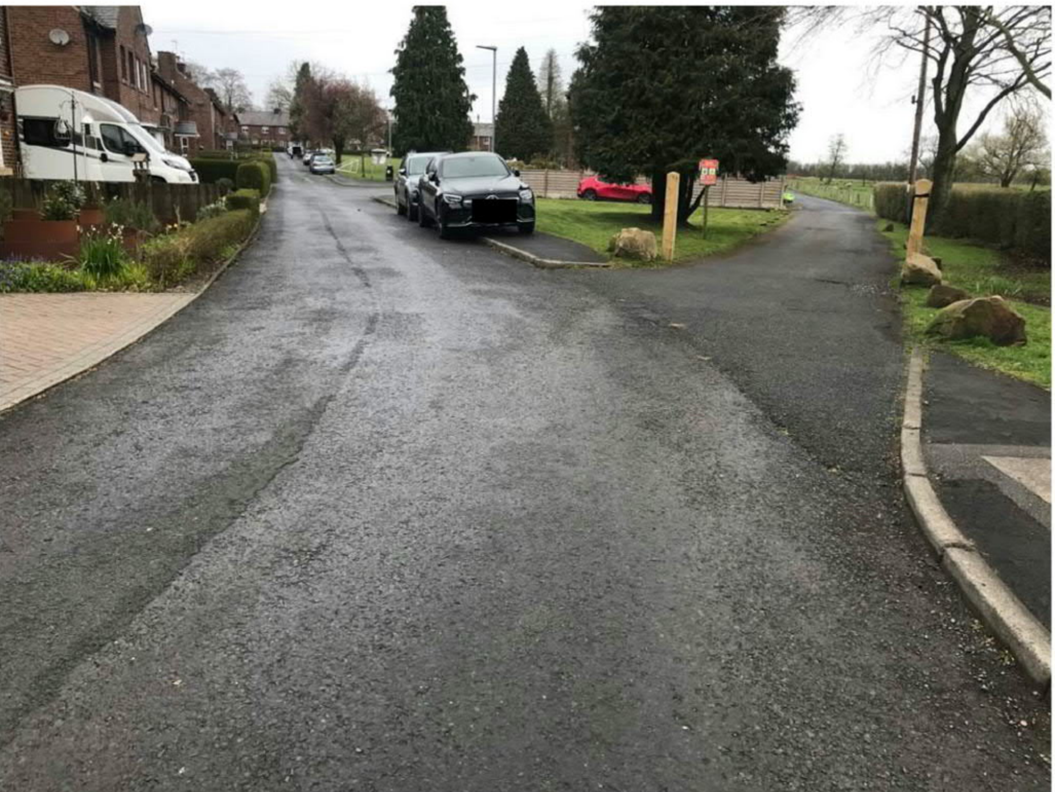
Further example proposed access