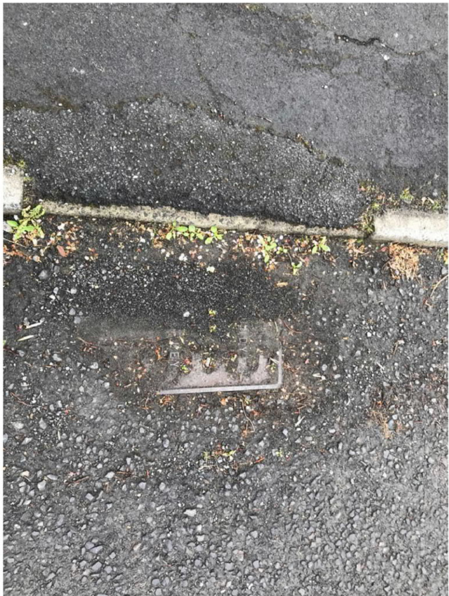
Recent example of drainage issues