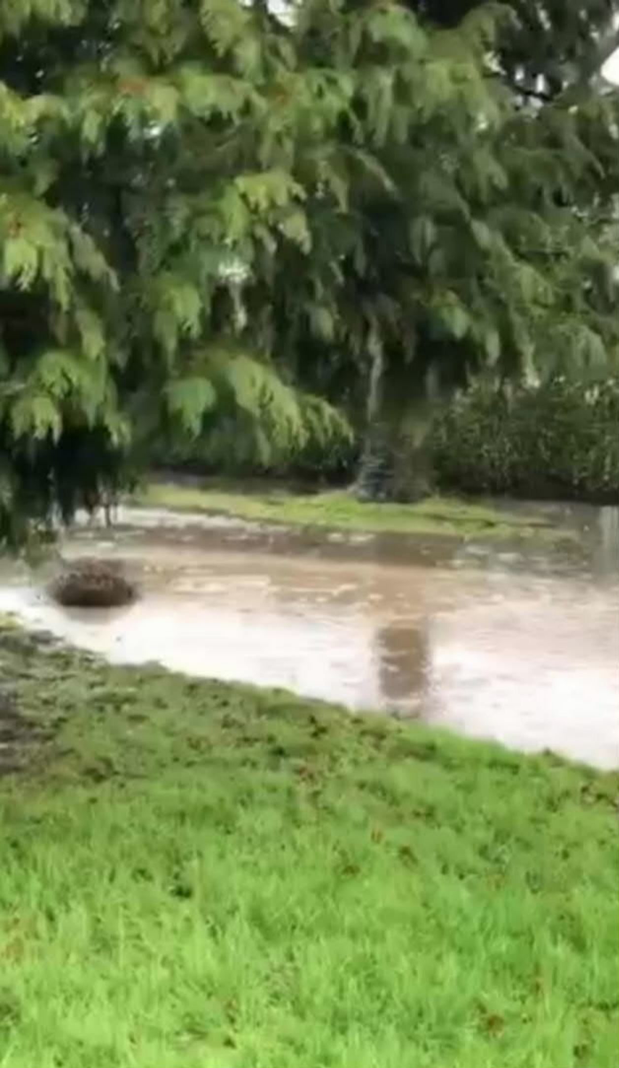
Further example of flooding on proposed access (image still taken from video recording) 21