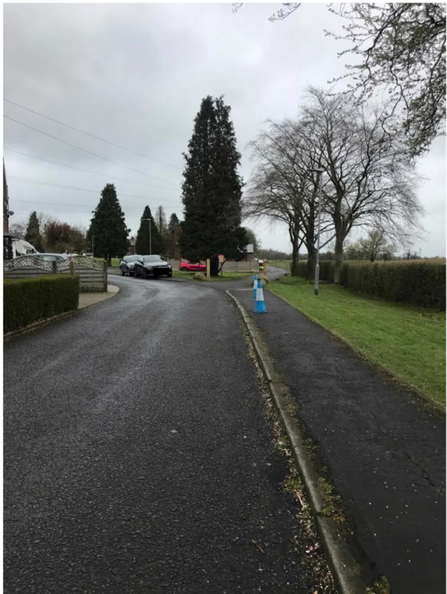
Further example proposed access to development