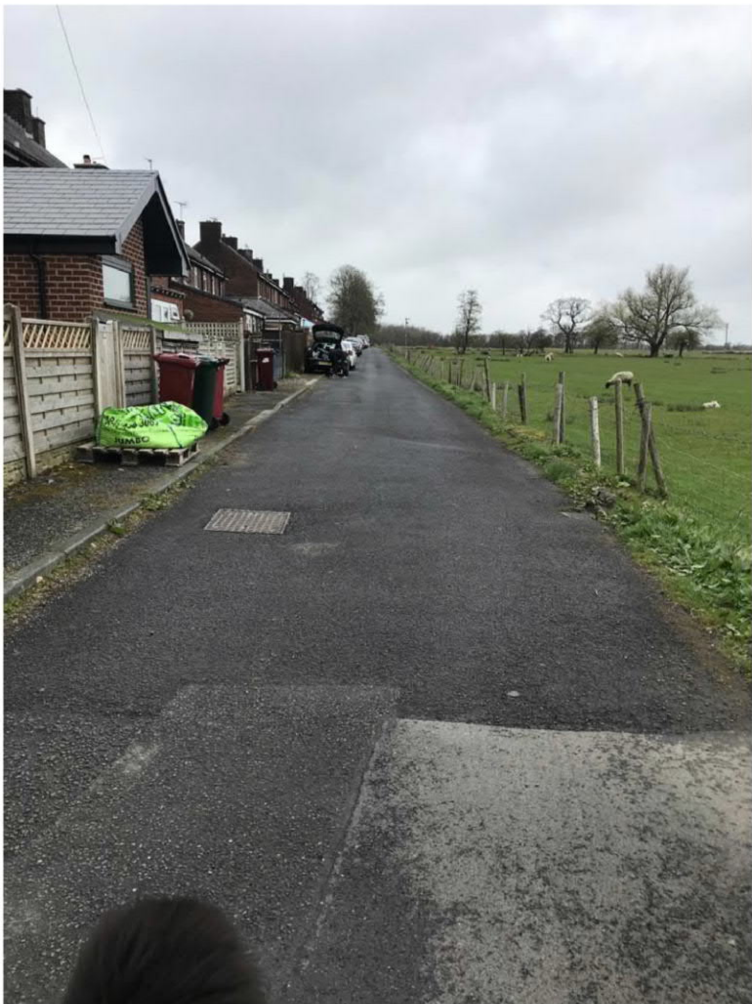
Further example of parking to rear of 11-25 Larkhill