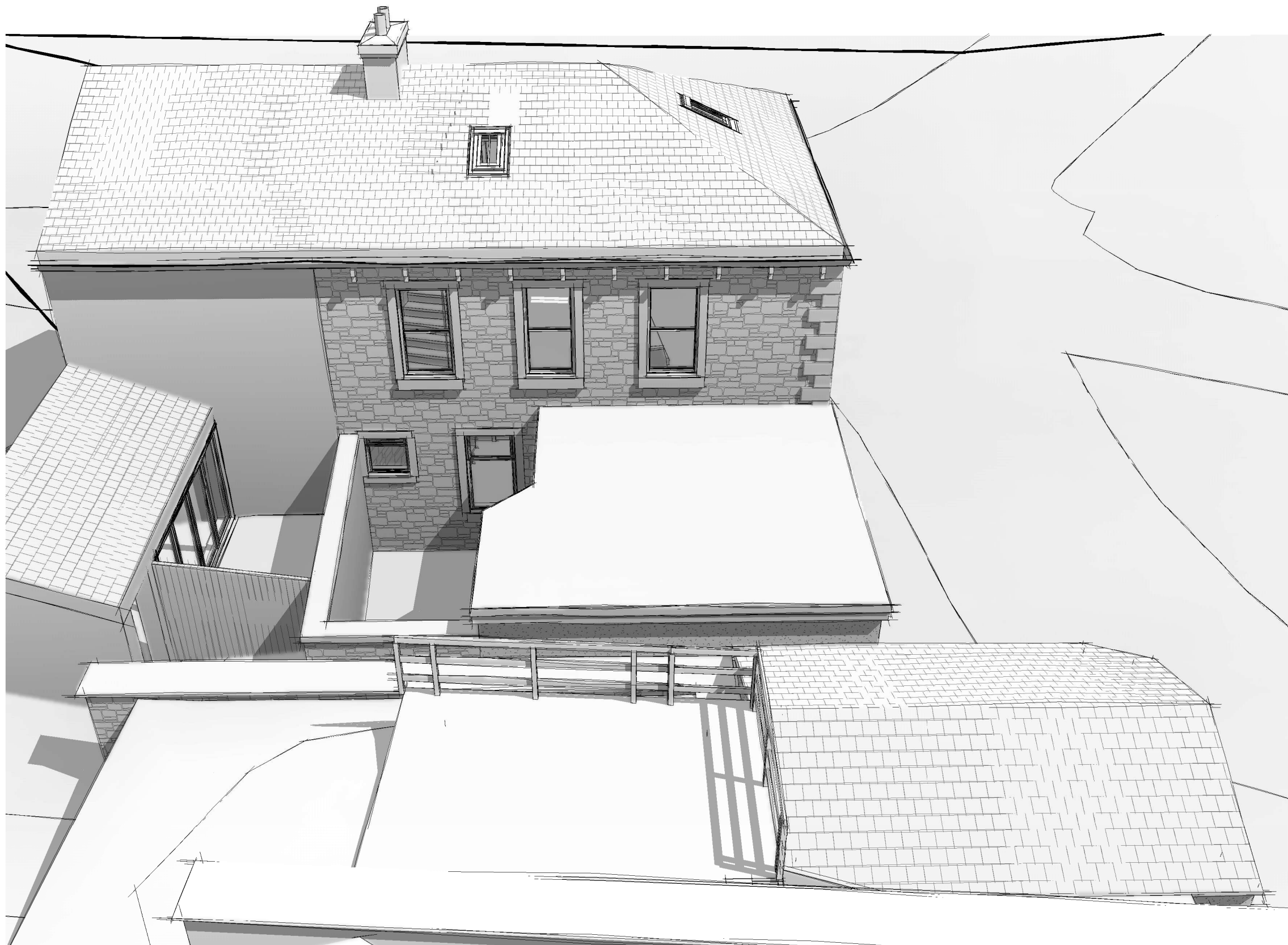
2 AERIAL 2