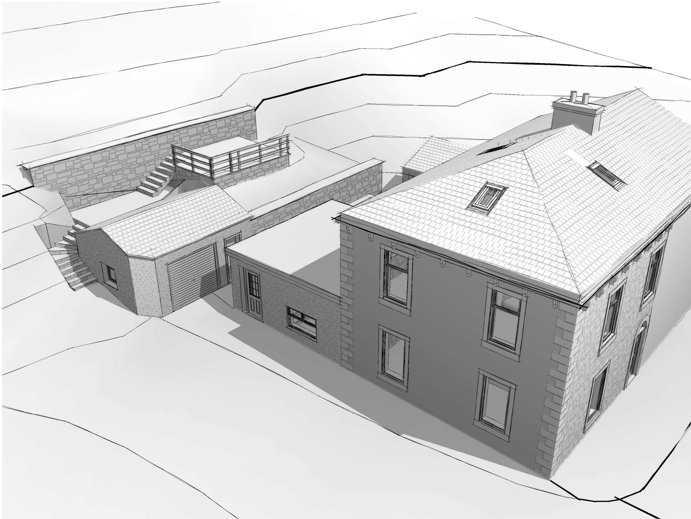
1 AERIAL 1