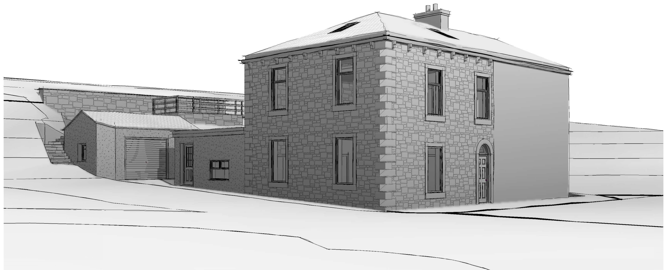
4 WHALLEY RD VIEW