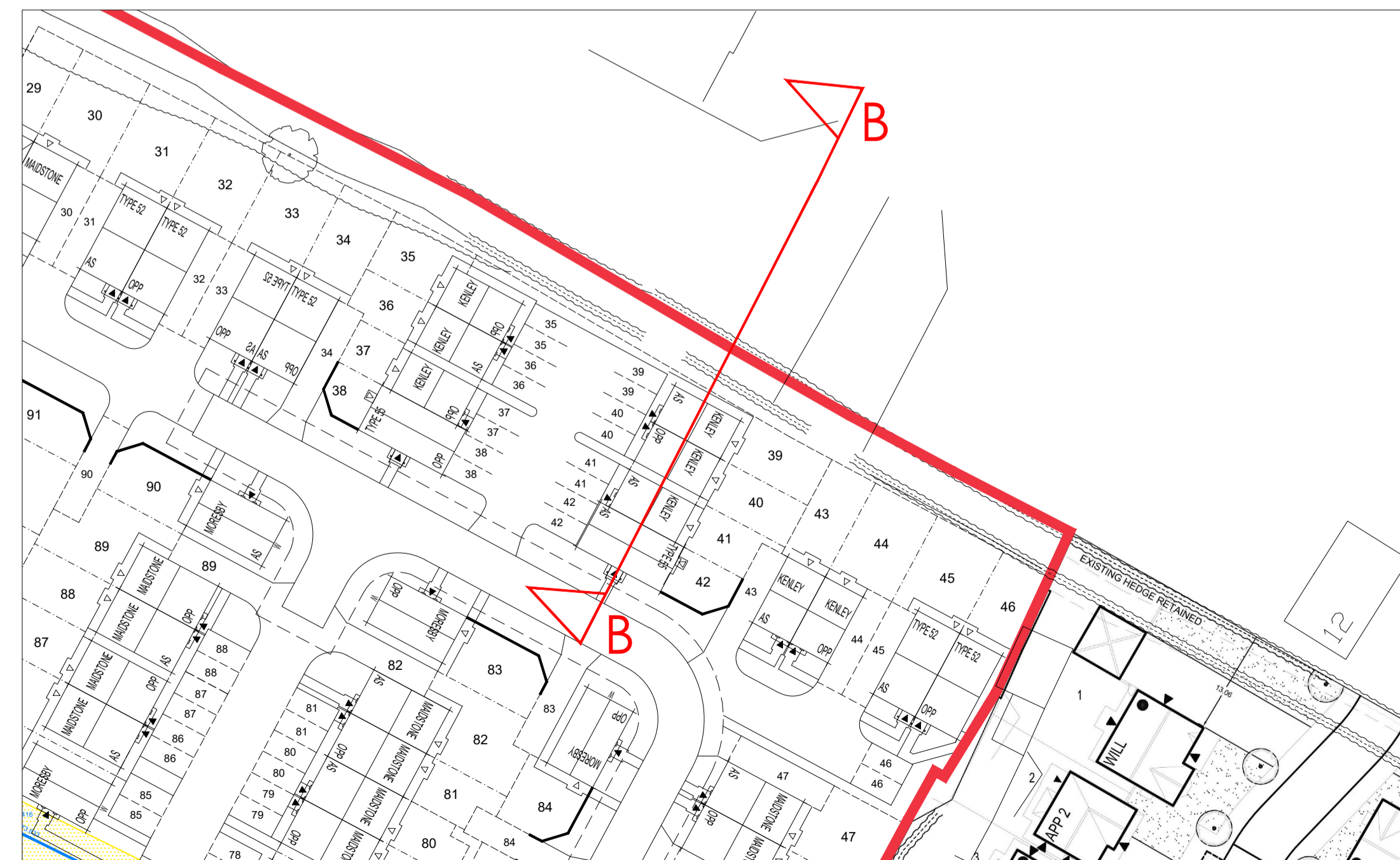
Section B-B Location Plan